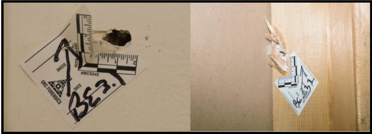
(BE 3.1 and 3.2)

Officer Involved Critical Incident - 1010 Wapakoneta Ave., Sidney, OH 45365 (L)