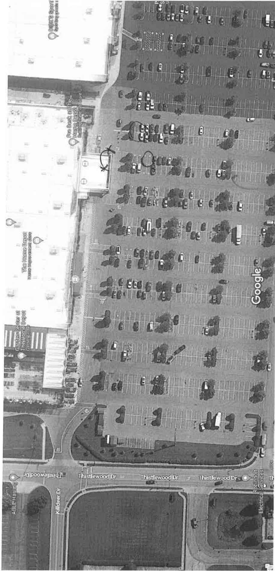
50 ft