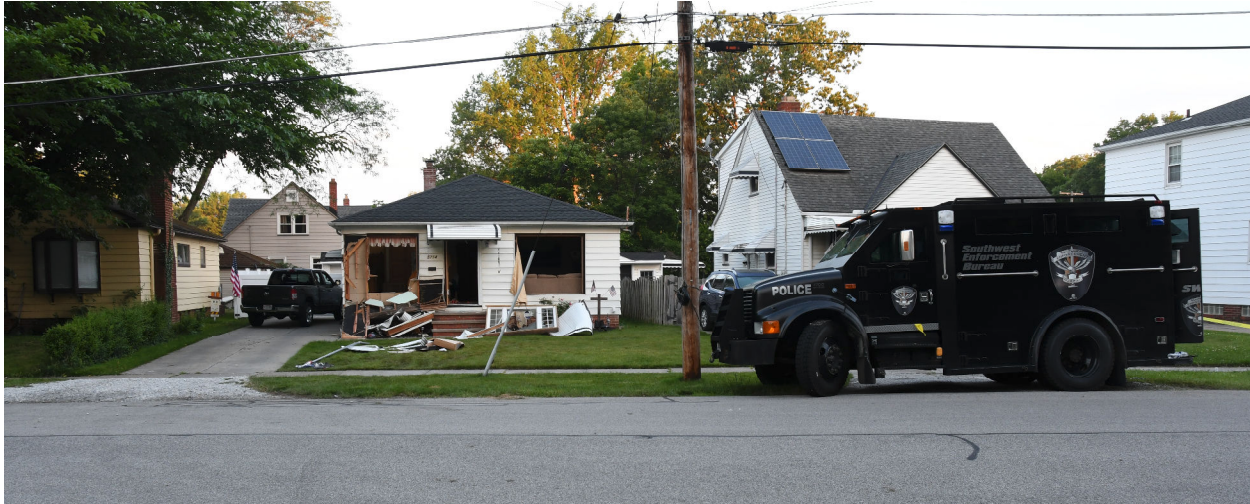
5714 South Park Blvd.