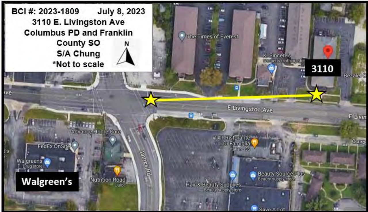
(Google Maps of scene)