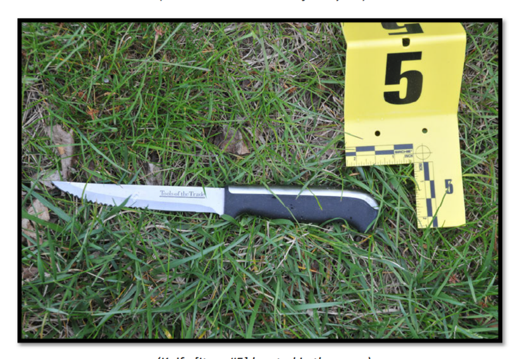
(Knife [Item #5] located in the grass)

This document is the property of the Ohio Bureau of Criminal Investigation and is confidential in nature. Neither the document nor its contents are to be disseminated outside your agency except as provided by law - a statute, an administrative rule, or any rule of procedure.