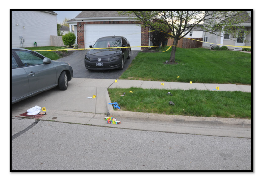
(Evidence located in the front yard)