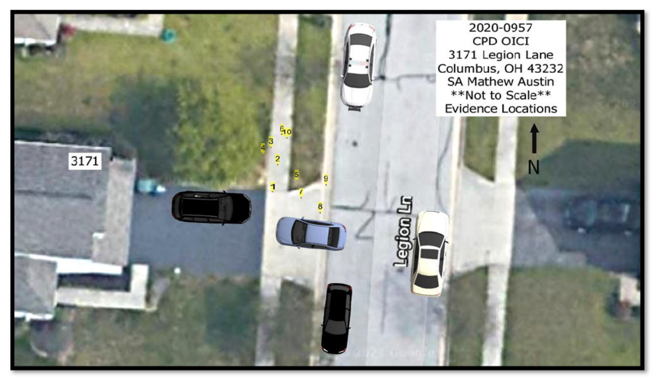
(Diagram of the scene)