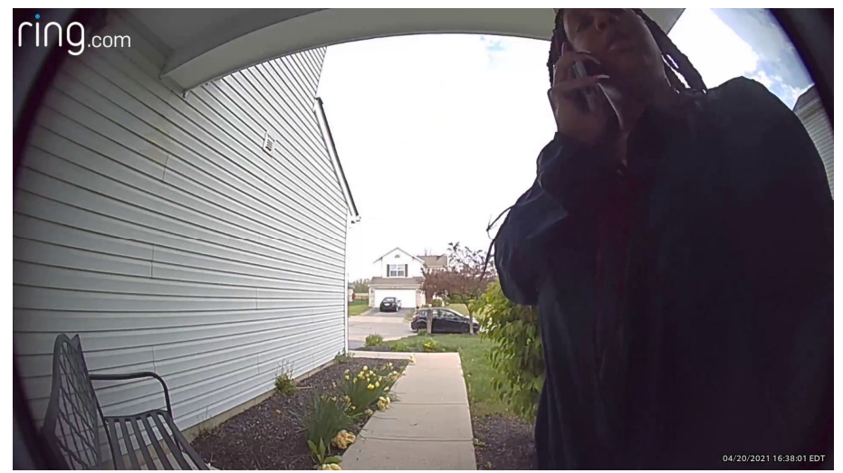
Figure 12: Shai-Onta at front door

• 16:39 hours, Shai-Onta came to the front door and it appeared she was talking on the phone (Figure 12).