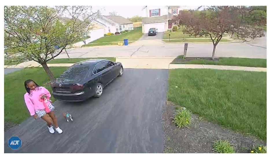
Figure 4: Tionna Bonner returning to 3171 Legion

• 15:54 hours, Tionna Bonner returning to 3171 Legion Ln. (Figure 4).