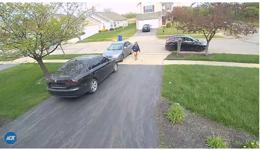
Figure 5: Shai-Onta arriving to the house. Jeanene's vehicle too is parked in front.

16:29 hours, Shai-Onta Craig arrived. Jeanene Hammonds vehicle was seen parked in front of 3171 Legion Ln. and appeared to be occupied, based on movement (Figure 5).