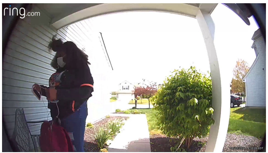
Figure 8: Ma'Khia returning home

• 14:10 hours, Ma'Khia returned home from school (Figure 8).