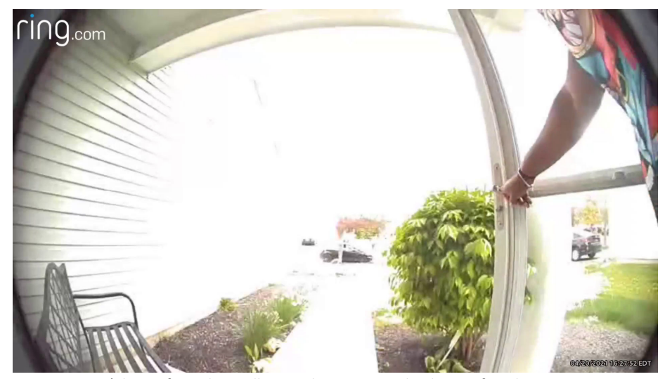
Figure 10: Ma'Khia at front door talking with Jeanene and unknown female

This document is the property of the Ohio Bureau of Criminal Investigation and is confidential in nature. Neither the document nor its contents are to be disseminated outside your agency.