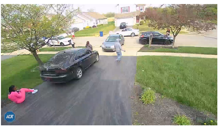
Figure 7: Post Shooting incident

• 16:46 hours, CPD is on scene. It appeared the shooting incident was over. Tionna was sitting behind her black car in the driveway ( Figure 7 ).