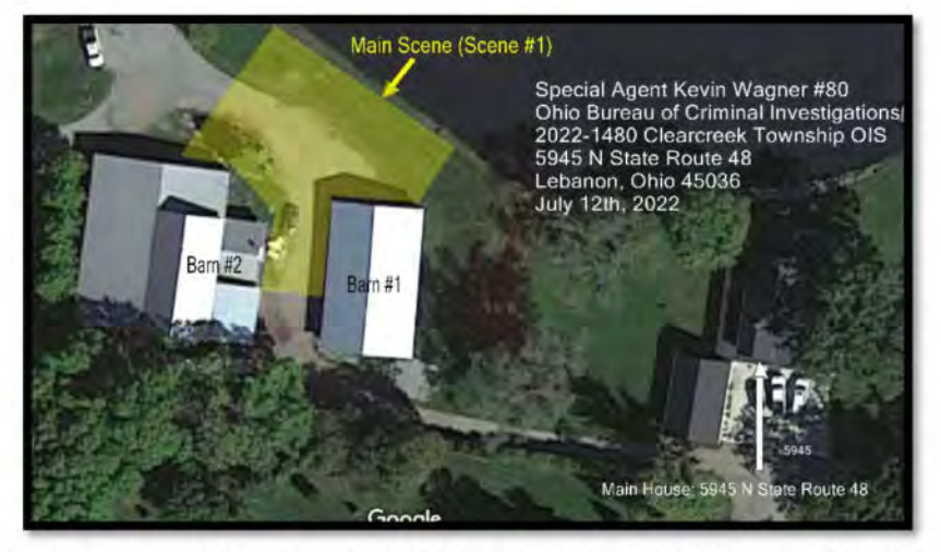
Image 1 - Google Map Overview of 5945 N State Route 48 Lebanon, Ohio 45036

SA Wagner arrived at 5945 N State Route 48 at 2300 hours. Once a search warrant was obtained, SA Wagner photographed the scene as it was upon arrival. 5945 N State Route 48 was on a large parcel of land, with a curved driveway leading from the roadway, up to the house and barns. At the bottom of the hill, just off the roadway, sat a white GMC Denali with Ohio license plate 893YWP. There was visible damage to both rear passenger doors. It was reported that Evers had rammed an All-Terrain Vehicle (ATV) into the Denali. At the top of the hill was a blue house. Further down the driveway, past the house, were several barns. The driveway continued in between both barns, past a pond, and extended to a small horse track. The main shooting incidenct took place in between the two barns, and just behind them, next to the pond.