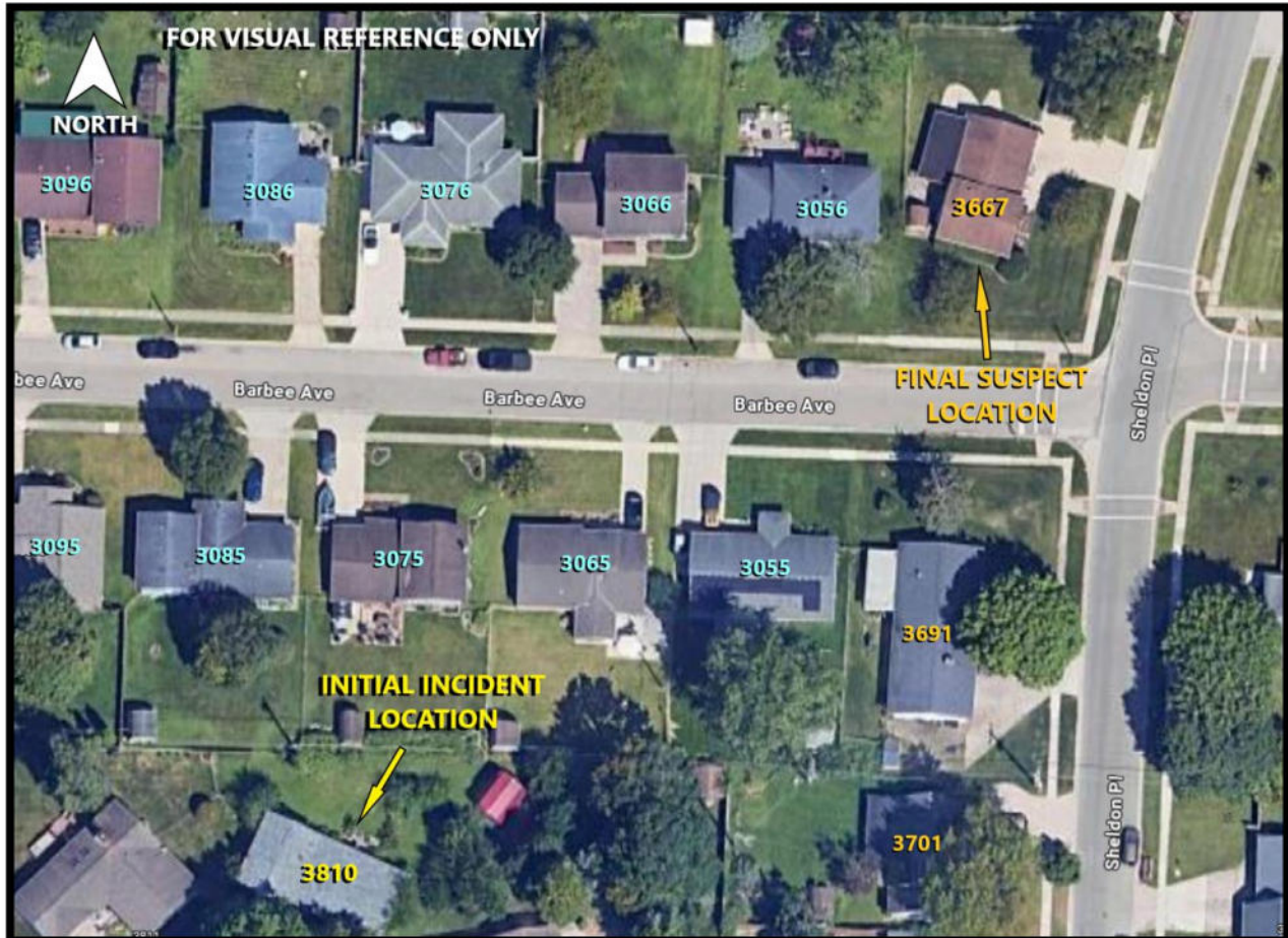
Figure 2: Reference map

[REDACTED] stated that he was approximately one hundred-fifty feet to the west down Barbee Avenue when he fired at the suspect. He said he fired three rounds in about two seconds. [REDACTED] said he was wearing his gas mask at the time that he fired. Although it was dark outside, he added, he utilized the weapon-mounted light on his rifle, and the suspect was also illuminated by an exterior light at 3667 Sheldon Place, which was where the suspect was located.