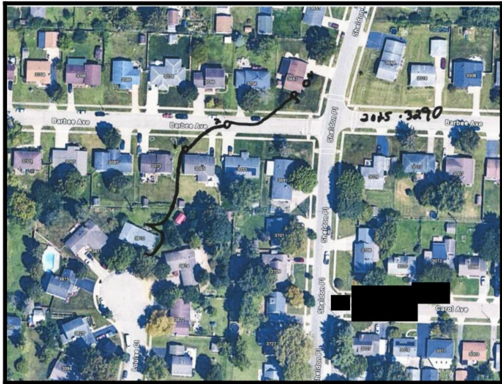
Figure 3: ██████████ route of travel

Area maps were provided to ██████████ to assist in his recall of the event. ██████████ drew his approximate route on one of the maps, from where he was initially staged in front of 3810 Louise Court, to where he ended up at 3667 Sheldon Place.