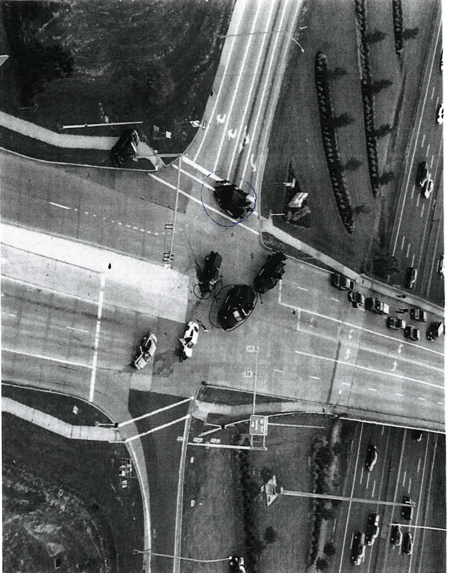
EXHIBIT A JULY 9, 2025