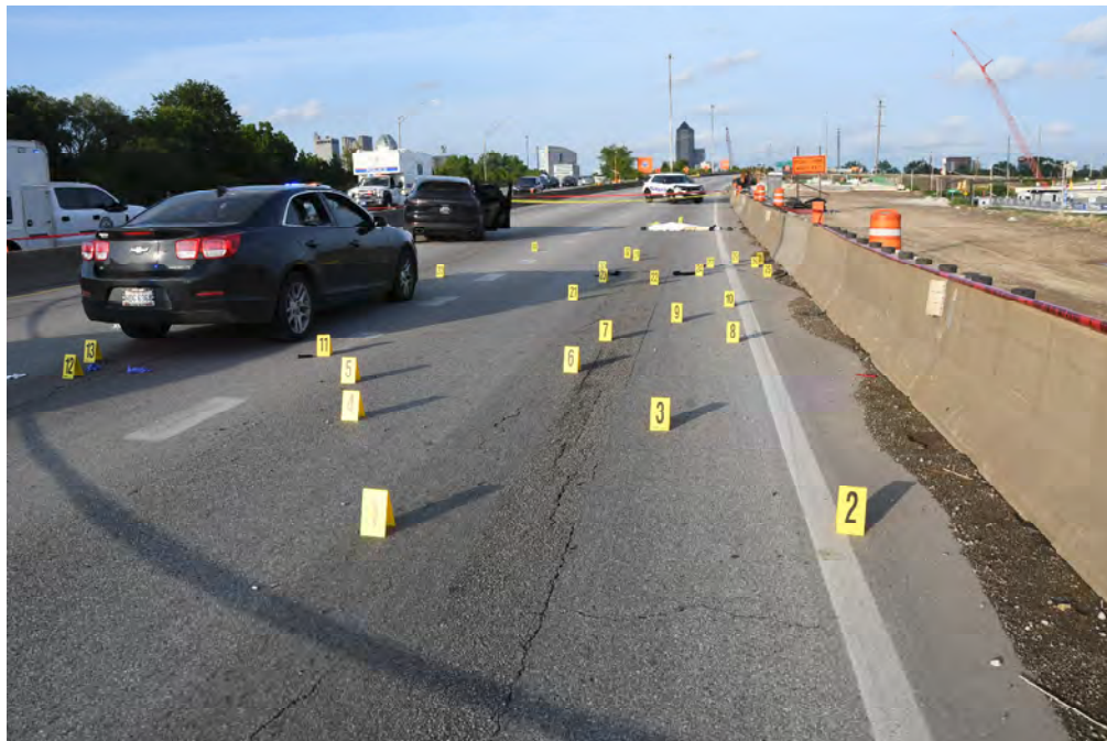
Image 1. I70 Eastbound near Mile Marker 98.8