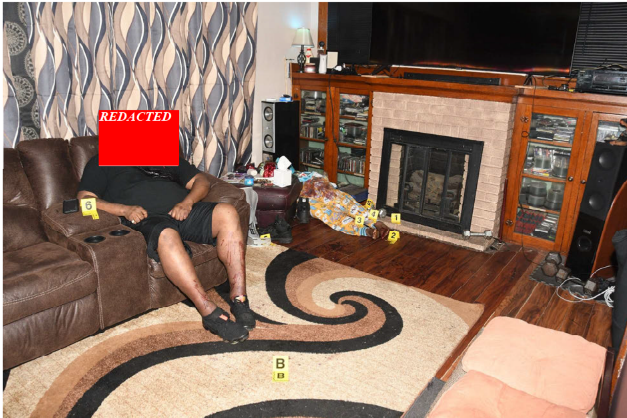
Living Area with Placards in Place

Officer Involved Critical Incident - 507 Ritchie Ave, Akron, OH 44320, Summit County