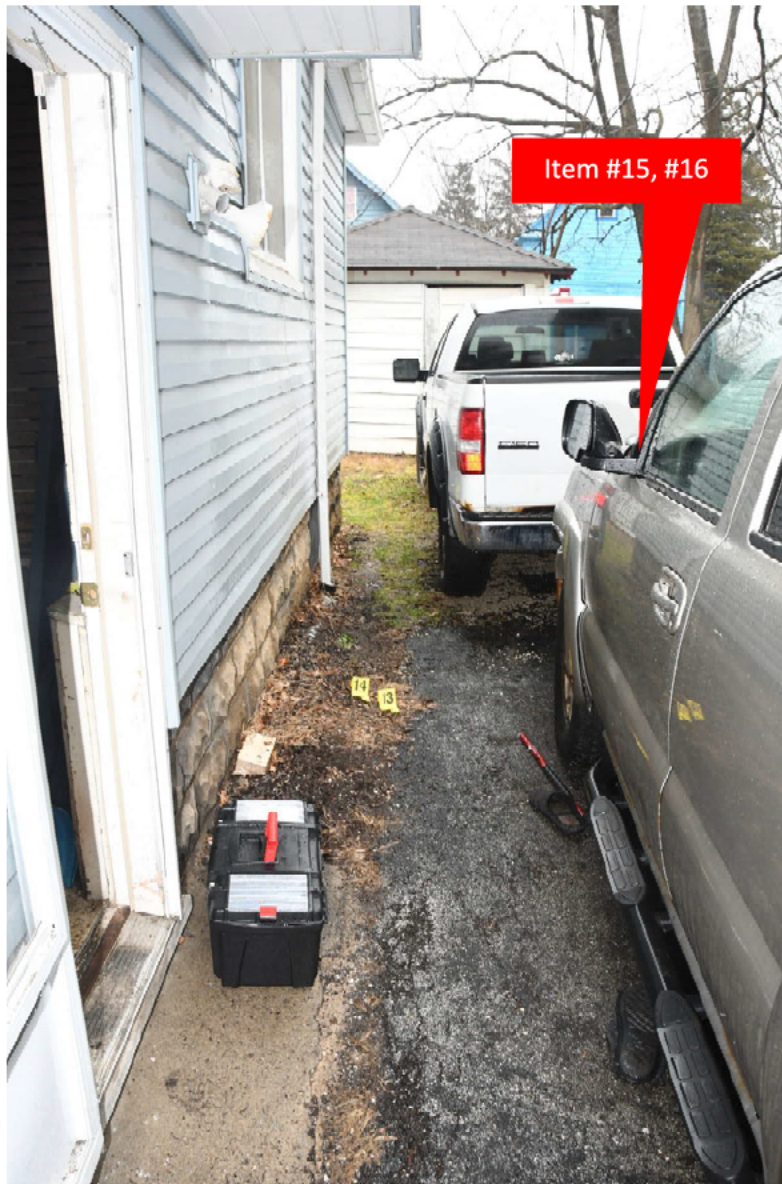
South, Side Door with Placards in Place

detector and did not locate any additional cartridge cases. S/A Soroka searched underneath the vehicles and the grass to the south of the vehicles both visually and with the use of a metal detector and did not locate any additional cartridge cases.