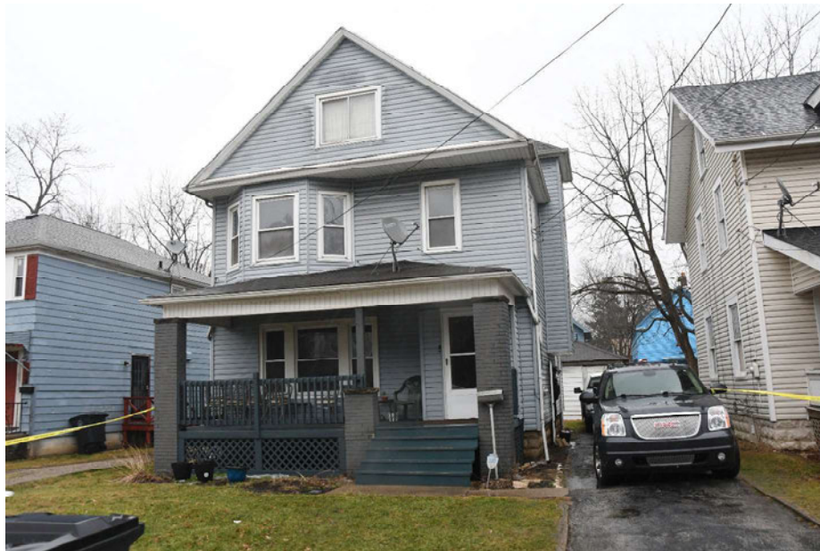
507 Ritchie Ave.