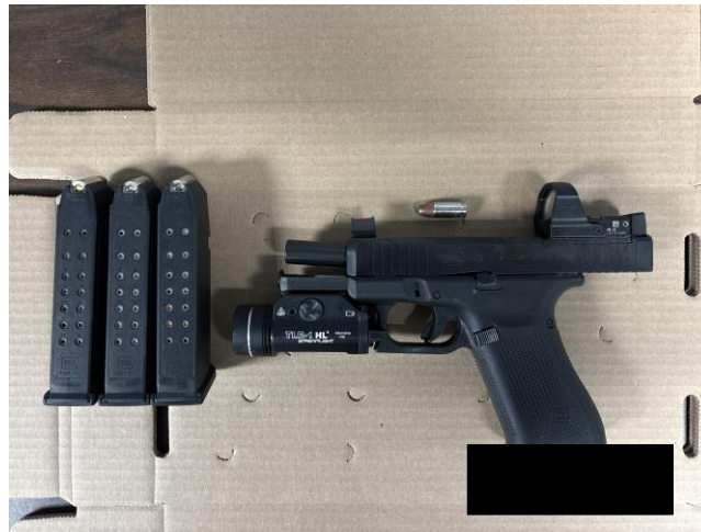
Figure 8, [REDACTED] firearm

This document is the property of the Ohio Bureau of Criminal Investigation and is confidential in nature. Neither the document nor its contents are to be disseminated outside your agency except as provided by law - a statute, an administrative rule, or any rule of procedure.