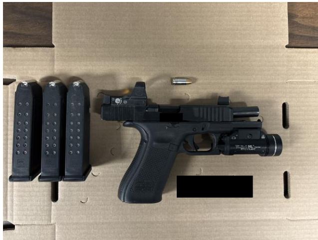
Figure 7, [REDACTED] firearm

This document is the property of the Ohio Bureau of Criminal Investigation and is confidential in nature. Neither the document nor its contents are to be disseminated outside your agency except as provided by law - a statute, an administrative rule, or any rule of procedure.