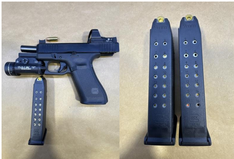
Figures 5-6, Dep. Chicarell's firearm

SA Boerner subsequently documented the condition of Dep. Chicarell's firearm. Dep. Chicarell's firearm was a Glock 45, 9mm, SN: [REDACTED] with one (1) cartridge in the chamber and seventeen (17) cartridges in the magazine ( Figures 5-6, Dep. Chicarell's firearm ). Dep. Chicarell's two (2) additional magazines were examined and found to have seventeen (17) and fifteen (15) cartridges respectively. 1