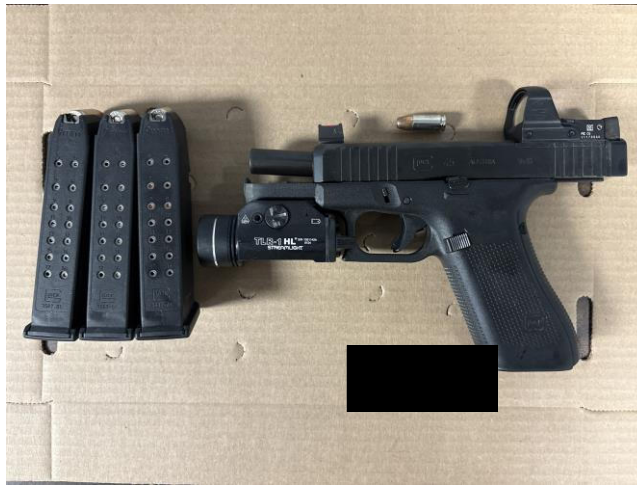
Figure 9, [REDACTED] firearm

This document is the property of the Ohio Bureau of Criminal Investigation and is confidential in nature. Neither the document nor its contents are to be disseminated outside your agency except as provided by law - a statute, an administrative rule, or any rule of procedure.