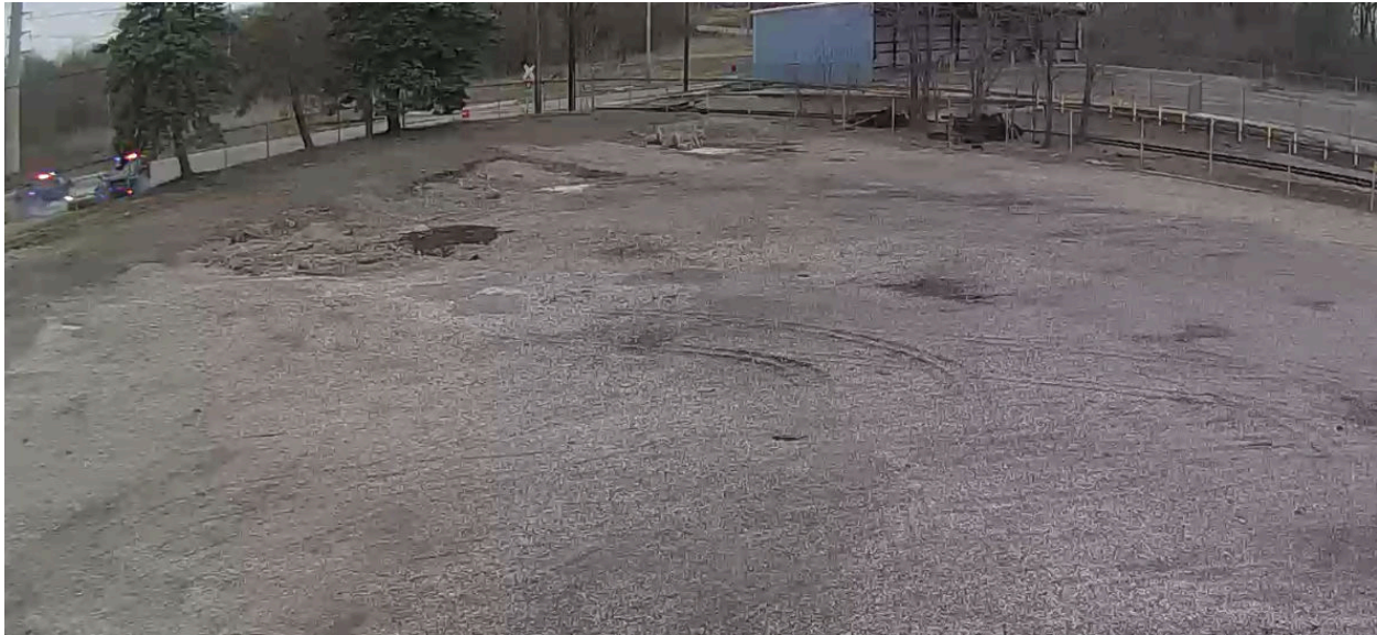
Figure 5: The above image captures the initial traffic stop by Struthers police officers. Video came from an outside surveillance camera from Crafcro Inc., located across the street from the incident.

Officer-Involved Critical Incident - 914 Salt Springs Road, Youngstown, Ohio 44509