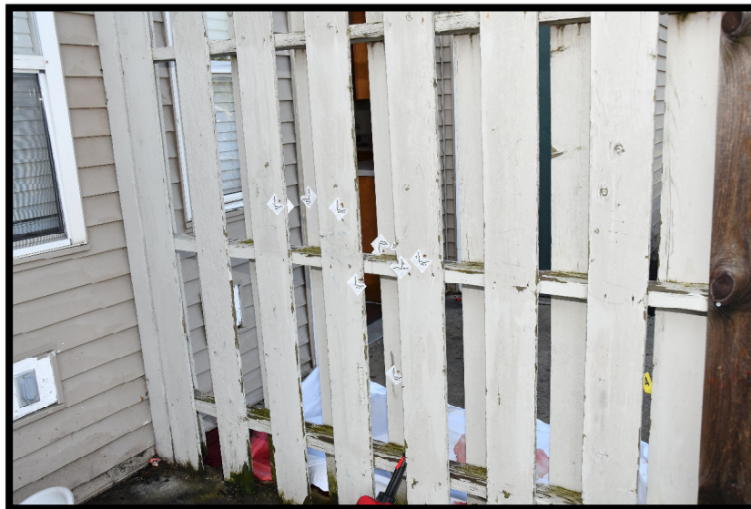
(View of BE 1.0-9.0 with Warfield's body on opposite side)

Multiple ballistic events (BE) were located on the exterior and interior of the apartment and were labeled with adhesive scales as BE 1.0 - 46.0 for documentation purposes. BE's 1.0 - 9.0 were located on the northeast side of the white fence, near the body of Warfield. The projectiles perforated the fence, and each hole was small in size. SA Taylor was able to identify and document some of the corresponding holes on the interior side of the fence (BE 1.1, 3.1, 4.1, 5.1, 7.1, 9.1).