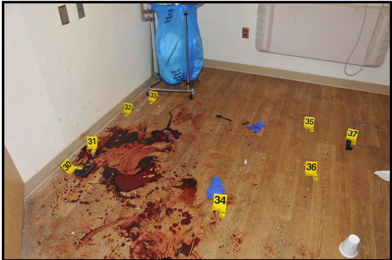
[Evidence located in Patient Room #9]

Officer Involved Critical Incident - 500 South Cleveland Ave., Westerville, Ohio 43081 (L)