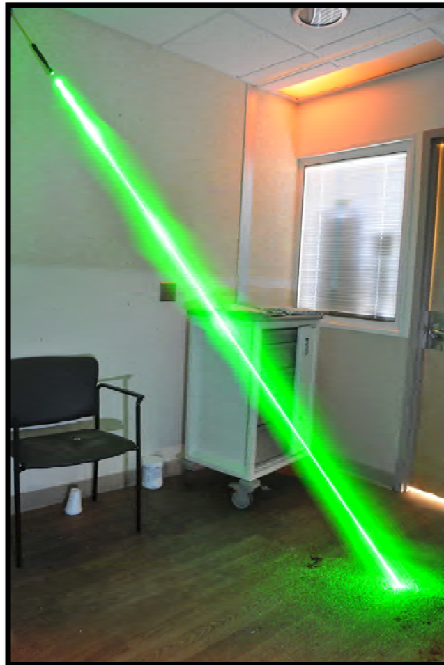
[Laser trajectory toward west wall of patient room #9]

Officer Involved Critical Incident - 500 South Cleveland Ave., Westerville, Ohio 43081 (L)