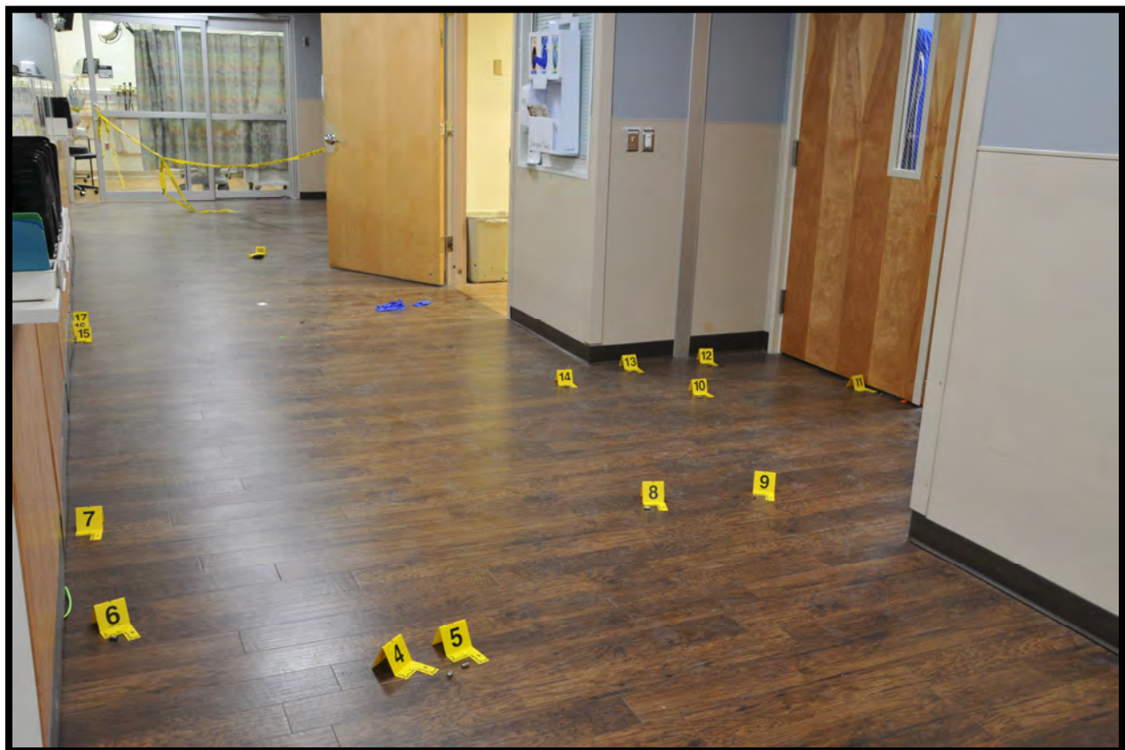
[Casings located in the trauma hallway]

Two tasers were observed on the ground in the trauma hallway. A yellow and black taser with '9010B' on the top of the taser was on the ground near the door to patient room #9. The taser had a serial number of, [REDACTED] and no cartridge was present in the taser. The taser was collected as item #18. A yellow and black taser with '14' on the top was lying on the ground behind the double doors to the hallway near patient room #9. The taser had a serial number of, [REDACTED]. The taser had a deployed cartridge still attached, and the wires stretched from the taser, under the hallway door, around the corner and into patient room #9. Agents located a taser barb that was stuck in the floor inside patient room #9. The taser and the taser wire barb were all collected as item #26.