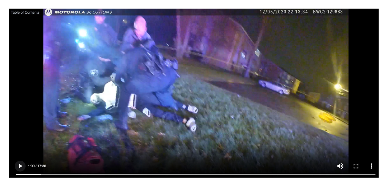
At 22:14:23, France's camera falls to or is set on the ground. At 22:14:41, the camera is positioned to face toward the officers that are providing aid to Fornash. See screenshot below.