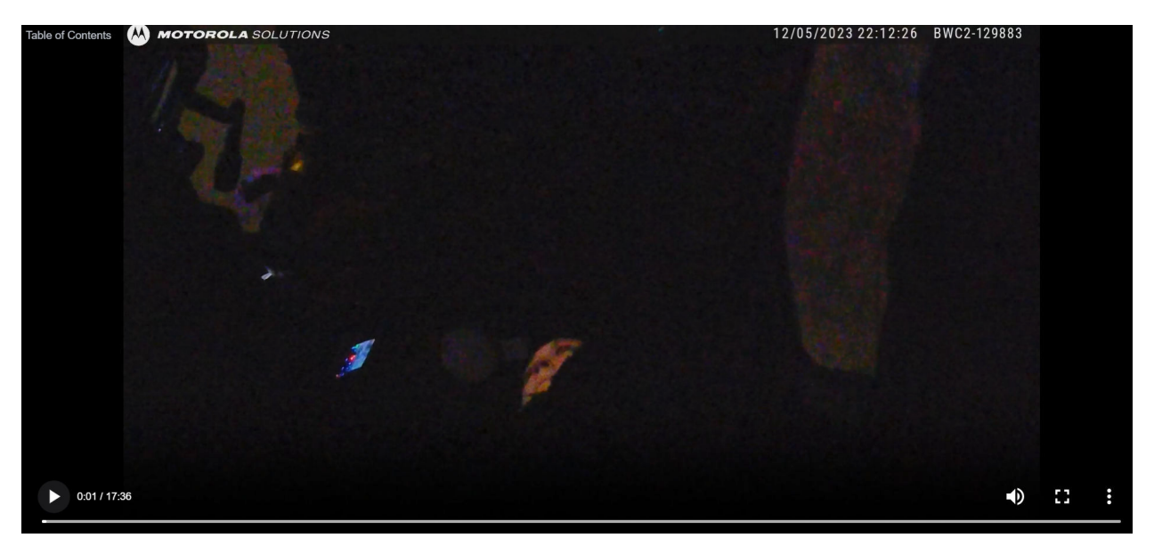
At 22:12:35, France begins to exit her vehicle. France retrieves a medic bag from her vehicle trunk and proceeds on foot toward the shooting scene. Note that the camera still appears in a sideways orientation. See screenshot below.

The video begins showing France driving a vehicle. Note that the camera appears to be located on the driver side floorboard of the vehicle. See screenshot below.