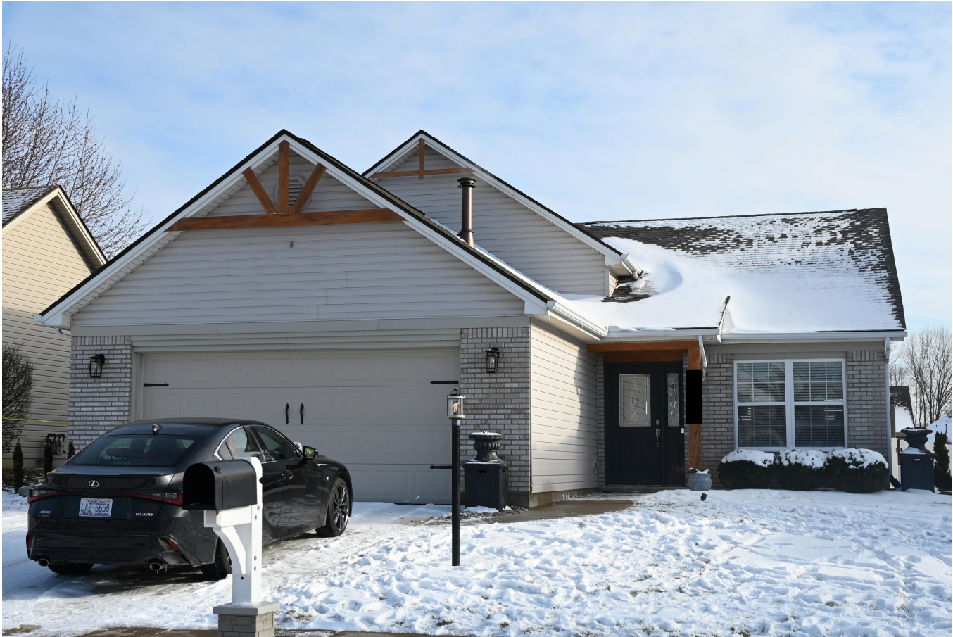
HVR_0001 – Overall front of [REDACTED]

photographed from the roadway and once the warrant had been signed, the entire scene was documented through photography. A Leica BLK360 3D scanner was utilized to collect measurements of the living room and second floor.