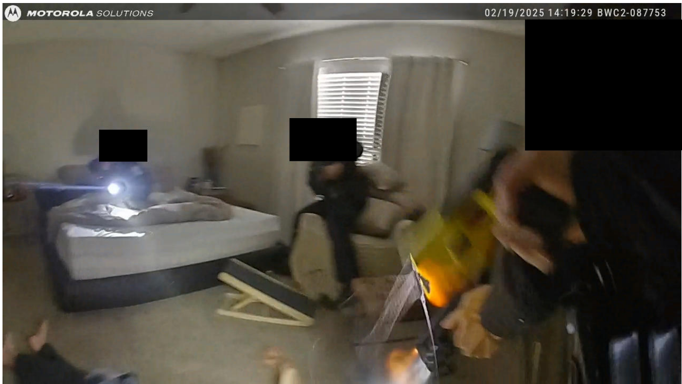
██████████ BWC at frame 28605