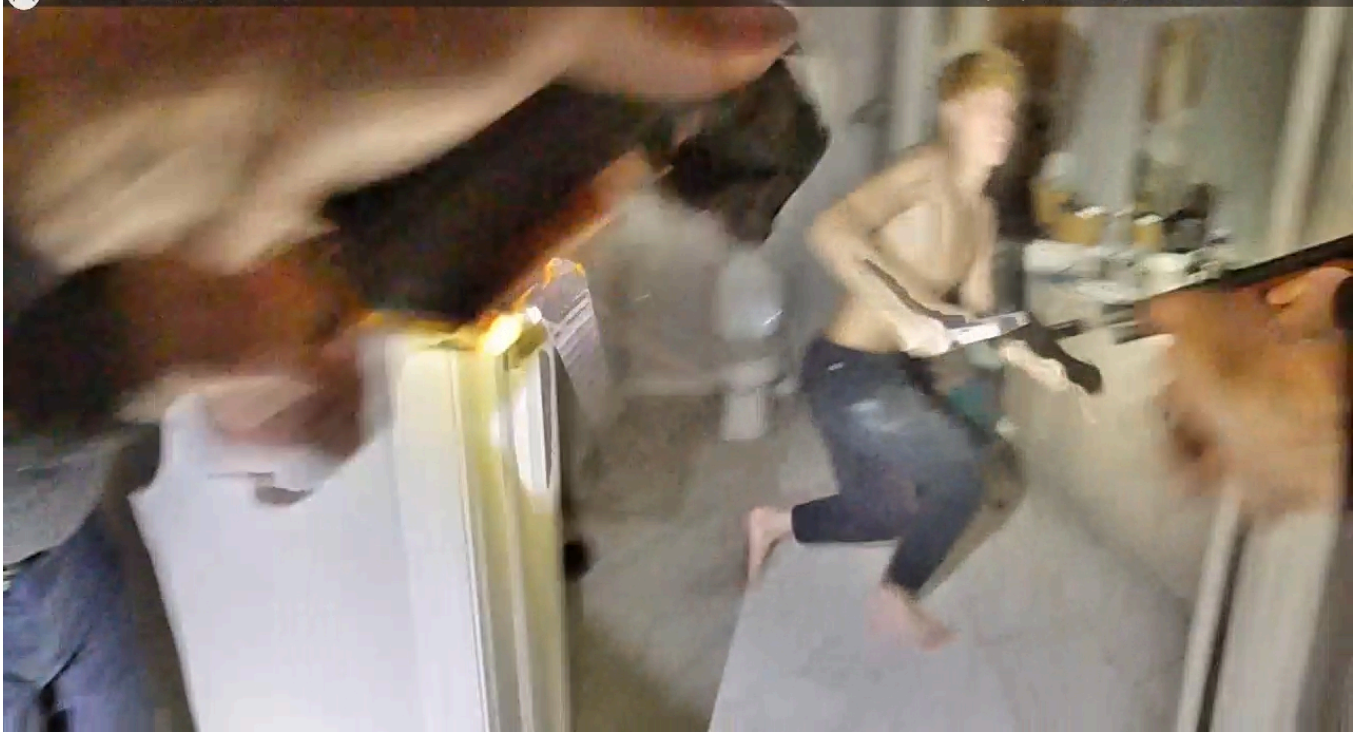
██████████ BWC at frame 44727