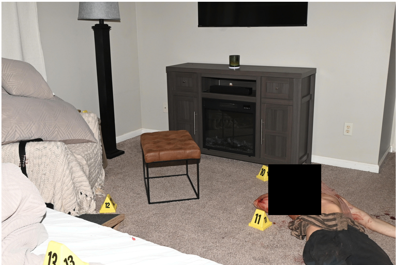
HVR_0227-Overall of Jayden and taser prongs (item 11), projectile and knife (item 12)

The decedent was located in the upstairs master bedroom. There was damage to the doorframe of the master bedroom, with a piece of the frame located across the hallway in the south bedroom. Suspected blood was located on the frame piece. Stephenson was located lying face-up on the floor just inside the master bedroom. He was not wearing any clothing on his torso; however, he had a mauve long-sleeved shirt draped across his left shoulder and a black and beige striped long-sleeved shirt around his hips. He was wearing a pair of black sweatpants and was not wearing any socks or shoes. He had a diamond-like earring in his right ear and was wearing a white rubber bracelet on his left wrist. Taser prongs/wire were located across the decedent's left arm that extended out into the second-floor hallway. These were collected for documentation purposes. A projectile was located on the floor next to the right side of the decedent's torso.