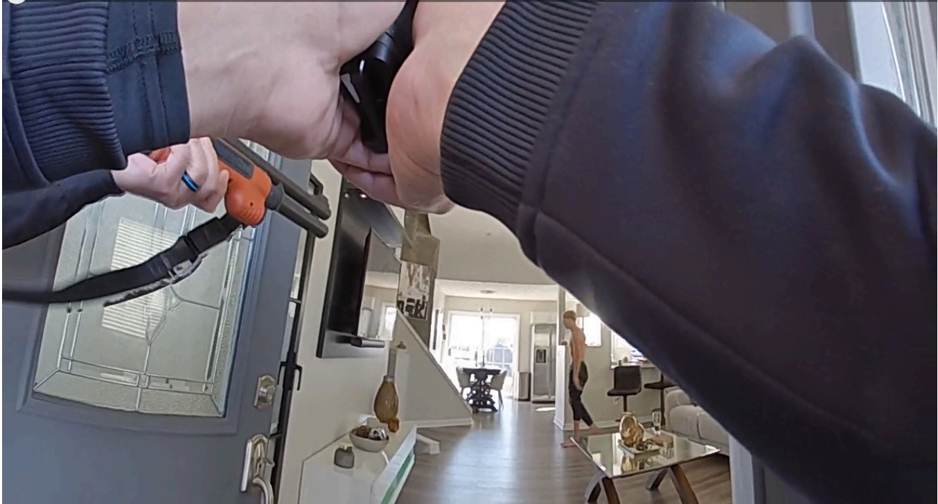
██████████ BWC footage at frame 42522

The less lethal shotgun was deployed (approximately frame 42537). (Agent's note: It is known through additional investigation that ██████████ was the officer who discharged the less lethal shotgun). It appeared to have impacted Jayden's left leg. A second less lethal shotgun round was fired (approximately frame 42565). A third beanbag round was fired (approximately frame 42602). Between the second and third less lethal shotgun deployments, ██████████ discharged his Taser. After the last beanbag round was fired, Jayden ran upstairs, entered a bedroom, and shut the door.