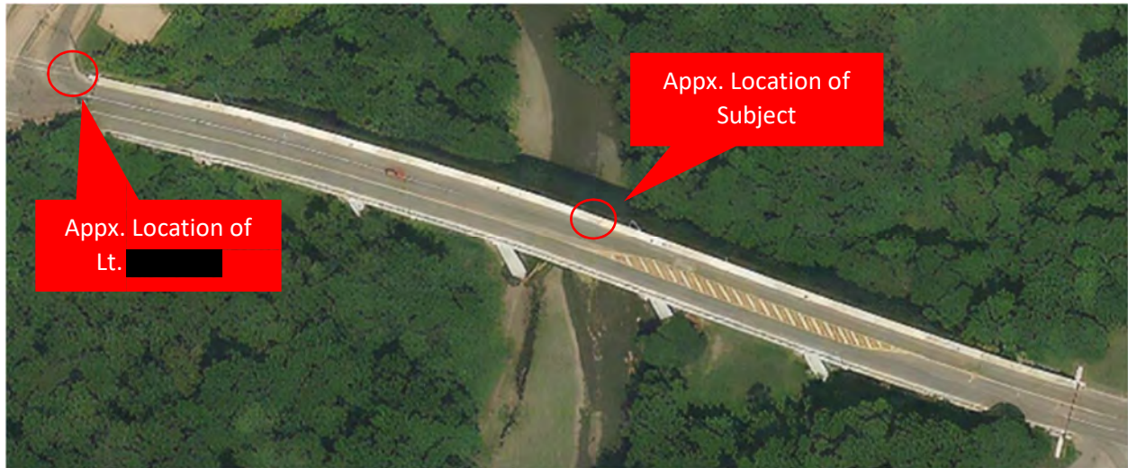
Google Earth Image