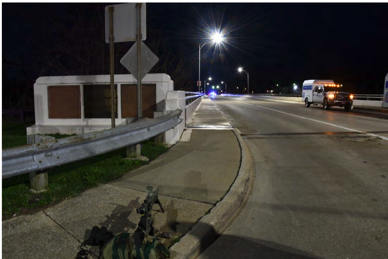
Position of Lt. [REDACTED] / Looking East

magazine was still seated. Around the rifle were a pair of black binoculars and, what appeared to be, a range/distance finding optic device. A cartridge was observed on the sidewalk near the curb next to the scoped rifle, and a cartridge case was observed in the roadway to the rear of the scoped rifle. Parked in the roadway behind the scoped rifle was marked, Ashtabula Cruiser L-2. The scoped rifle was marked as item #4. The rifle was found to be a Ruger Precision .308 WIN, bearing serial number [REDACTED]. A bipod was attached to the front of the rifle, and a Vortex Optics 4-16 x 50 Viper scope was attached to the top of the rifle. The PMAG 10 magazine was removed and found to contain 8 cartridges marked with headstamp "Hornady .308 WIN". The cartridges were placed back in the magazine and the magazine was packaged with the handgun. The cartridge and cartridge case were marked as item #5 and item #6, respectively. Both were marked with the headstamp "Hornady .308 WIN".