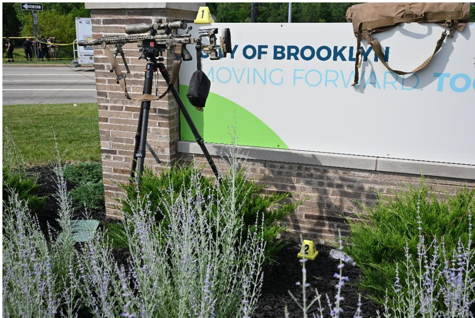
Figure 5: Evidence Items #1-2

SA McClintock photographed the scene as it was found. The crime scene was searched for items of suspected evidence and several items were located, photographed and collected ( Table 1: Items of Evidence ). On the southeast corner near the city of Brooklyn sign a sniper rifle was located on a tripod to the south of the sign. The sniper rifle was fired during the incident. The rifle was photographed and collected as Evidence Item #1 . One fired FC .308 WIN cartridge case was located to the east of the rifles tripod in the mulch. The fired cartridge case was photographed and collected as Evidence Item #2 .