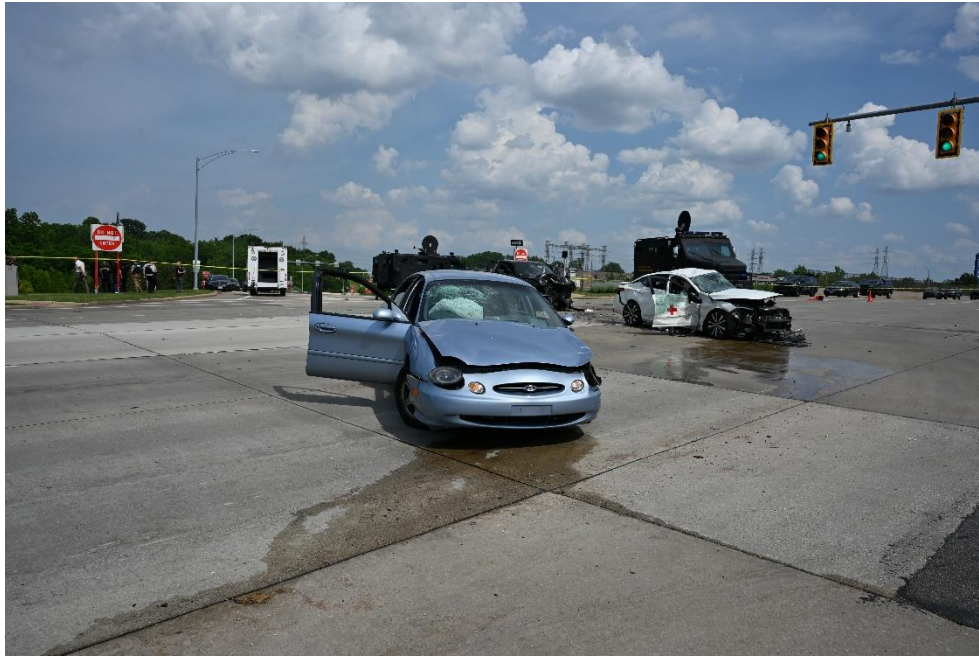
Figure 4: Overall Photograph

Homicide - I-480 West Bound/ Tiedman, Cleveland, OH 44144 (L)