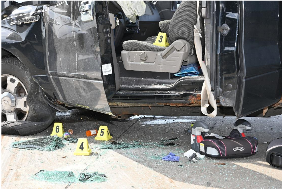
Figure 6: Evidence Items #3-6

Homicide - I-480 West Bound/ Tiedman, Cleveland, OH 44144 (L)