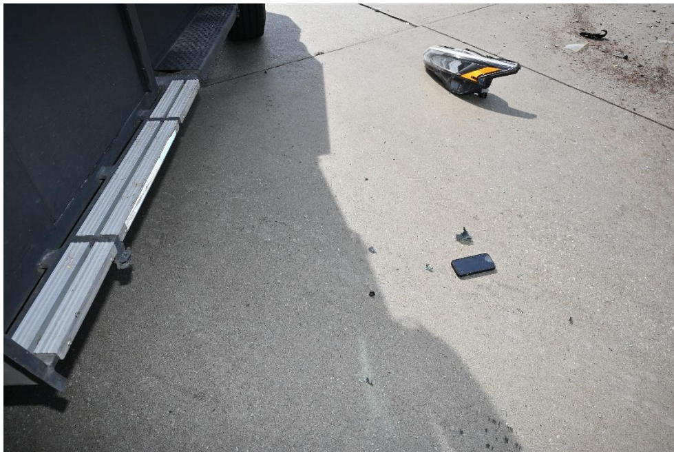
Figure 7: Evidence Item #9

This document is the property of the Ohio Bureau of Criminal Investigation and is confidential in nature. Neither the document nor its contents are to be disseminated outside your agency except as provided by law - a statute, an administrative rule, or any rule of procedure.