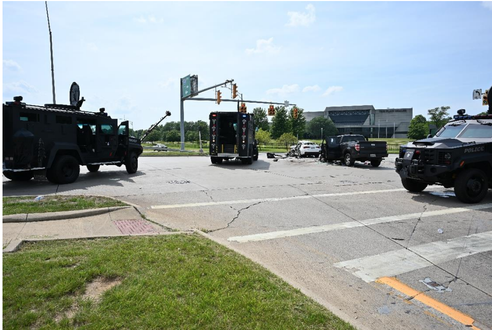
Figure 2: Overall Photograph

Homicide - I-480 West Bound/ Tiedman, Cleveland, OH 44144 (L)