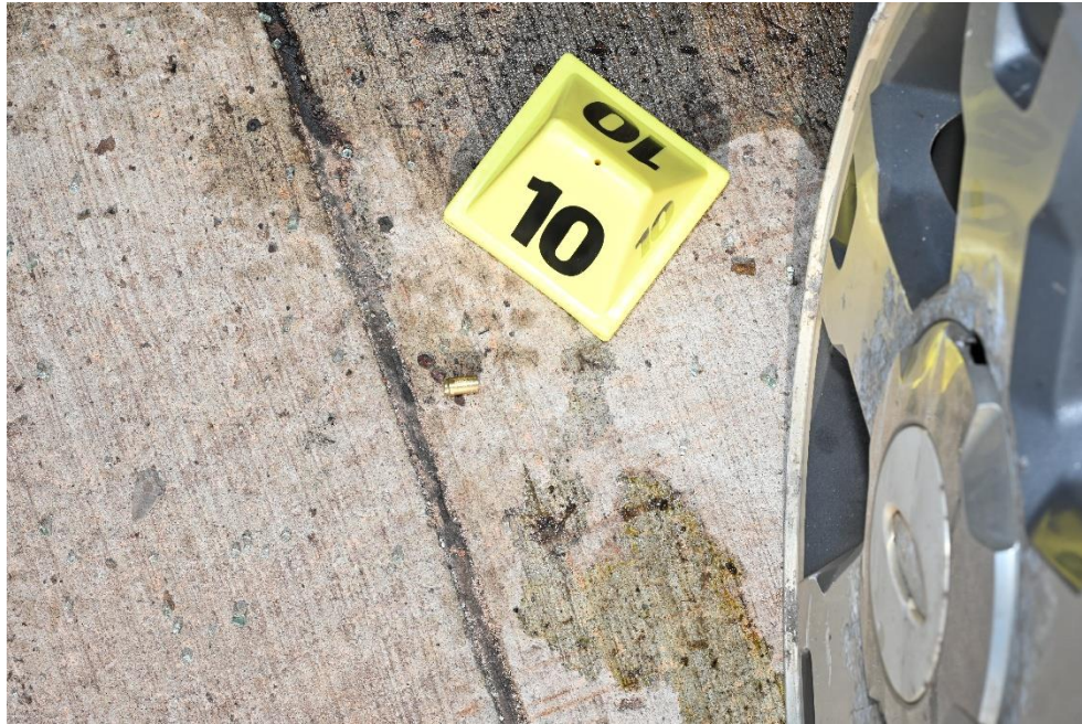
Figure 9: Evidence Item #10

Homicide - I-480 West Bound/ Tiedman, Cleveland, OH 44144 (L)