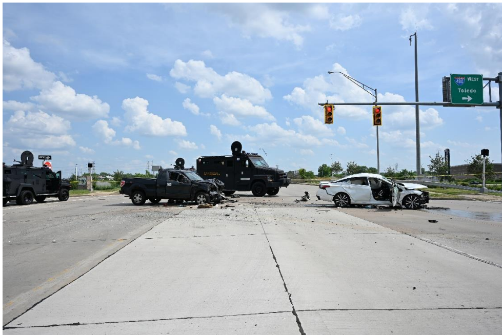
Figure 3: Overall Photograph

This document is the property of the Ohio Bureau of Criminal Investigation and is confidential in nature. Neither the document nor its contents are to be disseminated outside your agency except as provided by law - a statute, an administrative rule, or any rule of procedure.