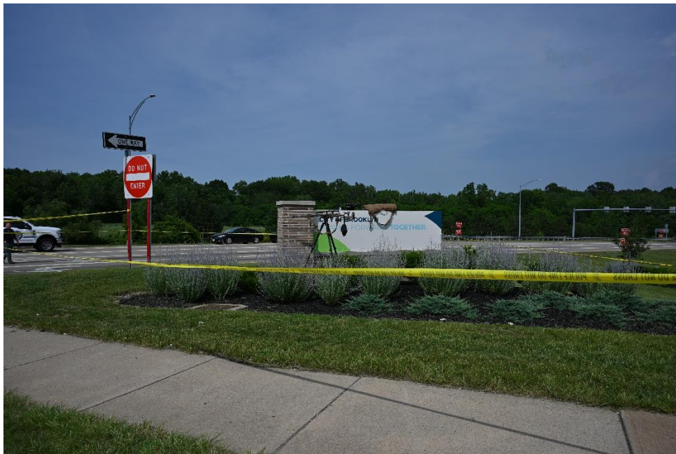
Figure 1: Overall Photograph

The primary scene consisted of Tiedman Road at the intersection of the I-480 west exit and entrance ramps. In the grass to the southeast of the intersection is a sign for the city of Brooklyn. Two armored police vehicles were parked on Tiedman Road on the south side of the intersection, a third was parked on the I-480 westbound exit ramp. A black Ford F-150 with damage to the engine compartment and front quarter panels was in the middle of the intersection facing west. A white Nissan Altima with damage on all sides of the vehicle was facing west in the southbound lanes of Tiedman Road. A light blue Ford Taurus with damage to the driver's side from headlight to rear quarter panel was facing west in the southbound lanes of Tiedman Road in the northwest corner of the intersection.