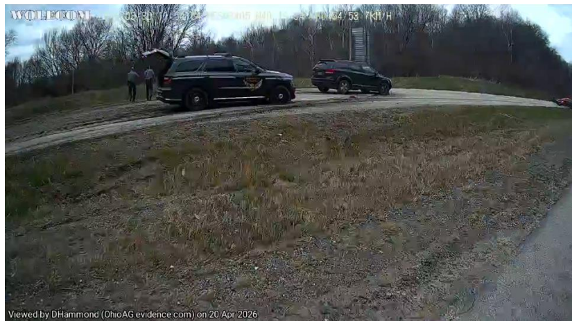
BWC, Figure 7

This document is the property of the Ohio Bureau of Criminal Investigation and is confidential in nature. Neither the document nor its contents are to be disseminated outside your agency except as provided by law - a statute, an administrative rule, or any rule of procedure.