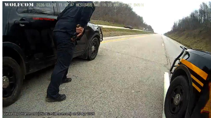
BWC, Figure 2