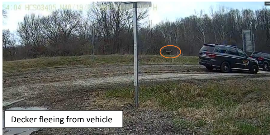
BWC, Figure 5

This document is the property of the Ohio Bureau of Criminal Investigation and is confidential in nature. Neither the document nor its contents are to be disseminated outside your agency except as provided by law - a statute, an administrative rule, or any rule of procedure.