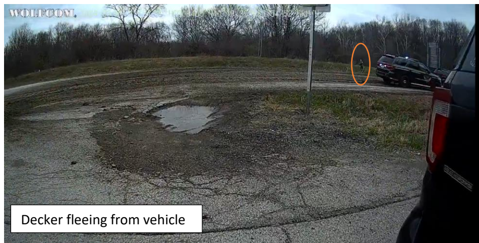
BWC, Figure 3

This document is the property of the Ohio Bureau of Criminal Investigation and is confidential in nature. Neither the document nor its contents are to be disseminated outside your agency except as provided by law - a statute, an administrative rule, or any rule of procedure.