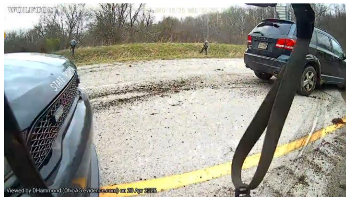
BWC, Figure 9

This document is the property of the Ohio Bureau of Criminal Investigation and is confidential in nature. Neither the document nor its contents are to be disseminated outside your agency except as provided by law - a statute, an administrative rule, or any rule of procedure.