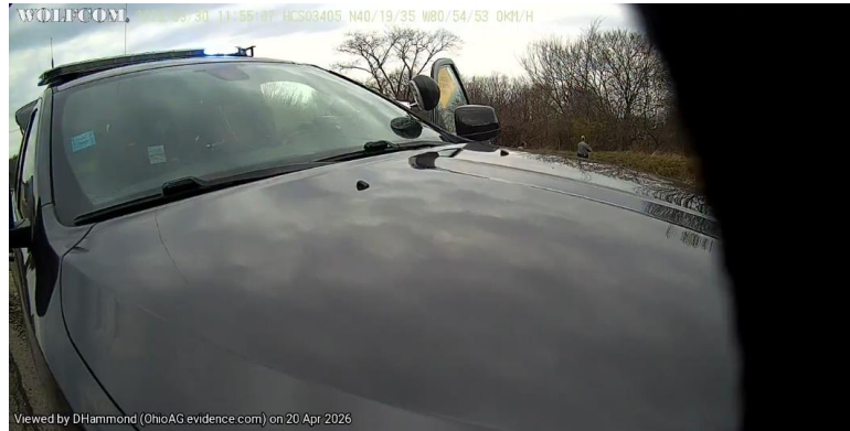
BWC, Figure 8