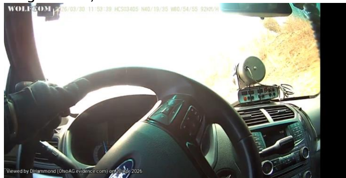
BWC, Figure 1

This document is the property of the Ohio Bureau of Criminal Investigation and is confidential in nature. Neither the document nor its contents are to be disseminated outside your agency except as provided by law - a statute, an administrative rule, or any rule of procedure.