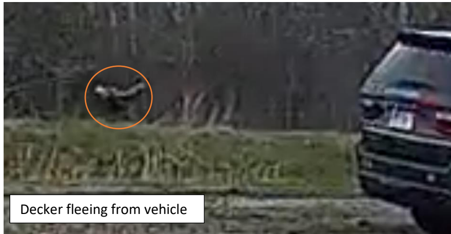
BWC, Figure 6

2026-1239 Officer Involved Critical Incident - 31000 Block U.S. Route 250, Uhrichsville, Ohio 44683, Harrison County