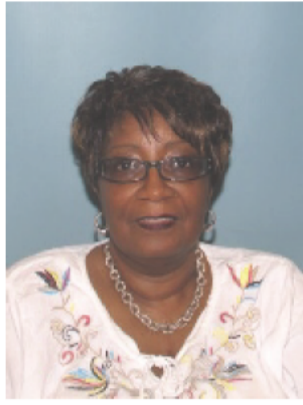
Click to Enlarge Title:2014 Photo Date:5/14/2014