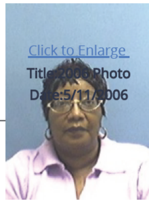
Click to Enlarge Title:2006 Photo Date:5/11/2006