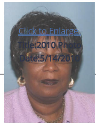
Click to Enlarge Title:2010 Photo Date:5/14/2010