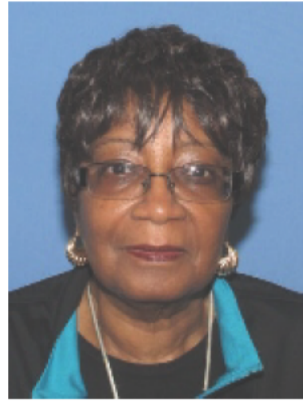
Click to Enlarge Title:2018 Photo Date:5/14/2018