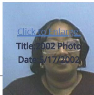
Click to Enlarge Title:2002 Photo Date:5/17/2002