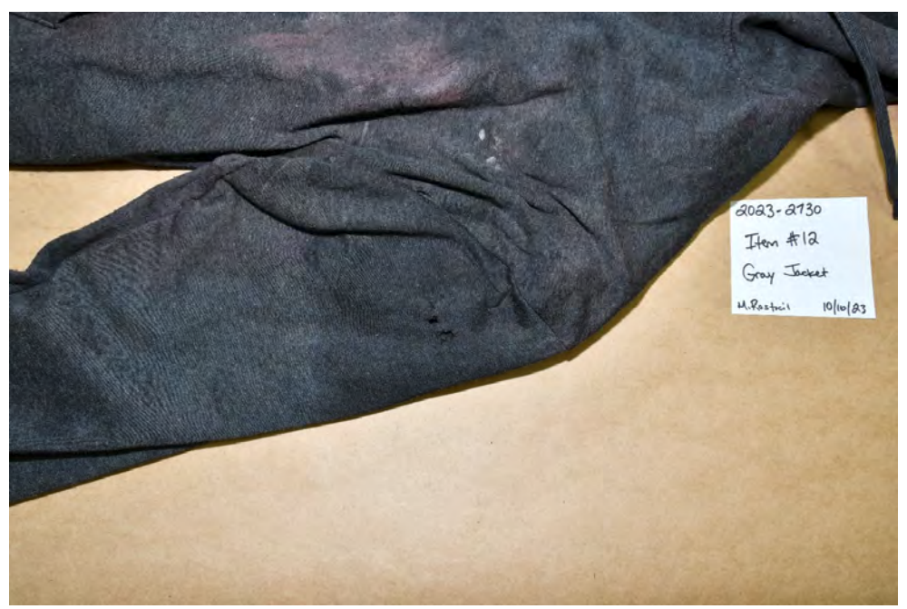
Figure #6 – Defects in left sleeve of Item #12