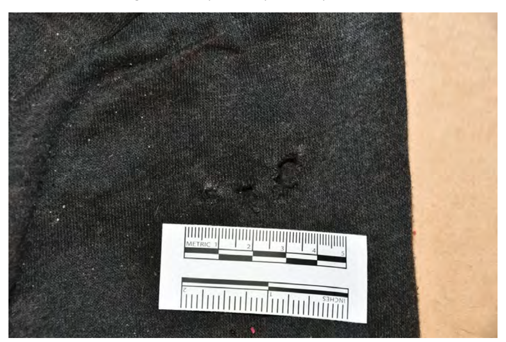
Figure #7 – Close-up of defects in left sleeve of Item #12