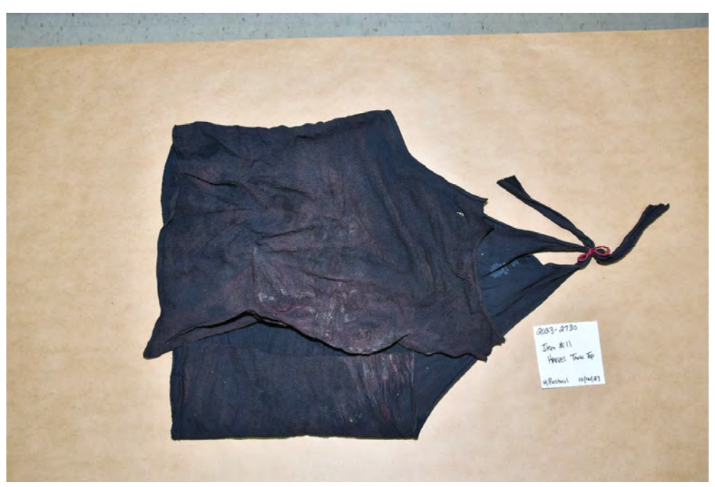
Figure #1 – Front side of Item #11

CST Rostocil removed Items #11-12 from the drying room and photographed the overall condition of them (Figures #1-7). Item #11 was a black Hanes brand tank top, XL. It was bloodstained and cut and had a red rope/tie around the straps. There was a defect in the front right chest area and a defect in the right back area. Item #12 was a gray MISSION RIDGE brand hooded and zippered jacket, size 2XL. It was bloodstained and cut on the right side. There were defects in the upper left sleeve. CST Rostocil packaged Items #11-12 separately and placed them into temporary evidence locker #4.