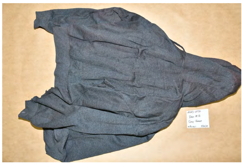
Figure #8 – Back side of Item #12