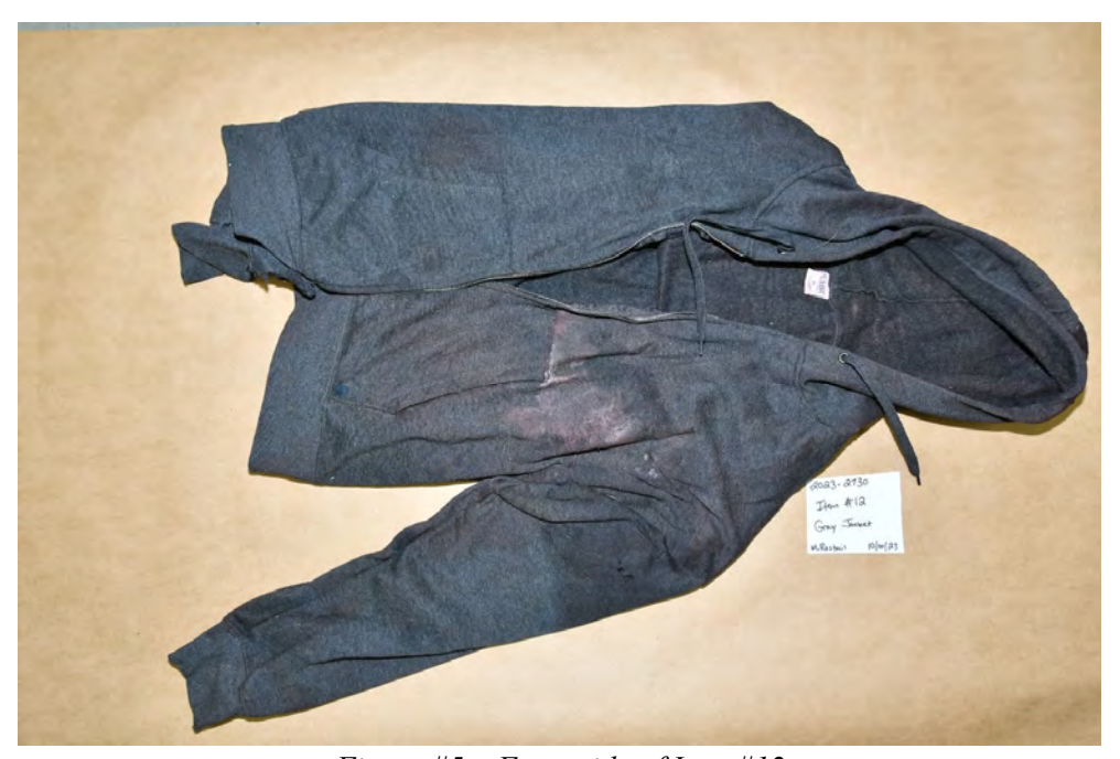
Figure #5 – Front side of Item #12