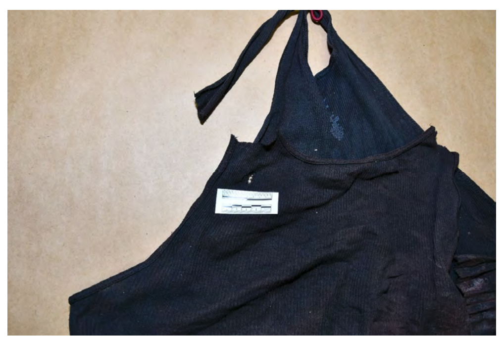
Figure #2 – Defect in front side of Item #11