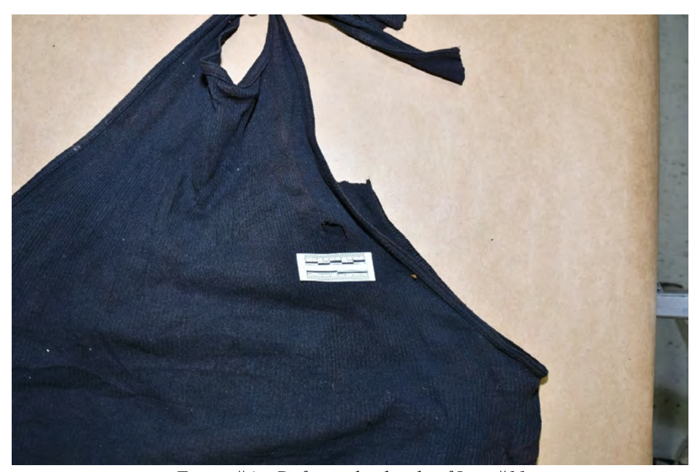
Figure #4 – Defect in back side of Item #11