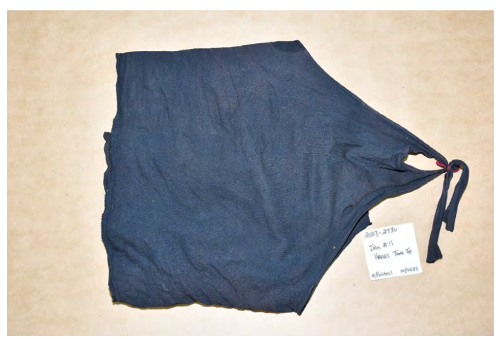
Figure #3 – Back side of Item #11