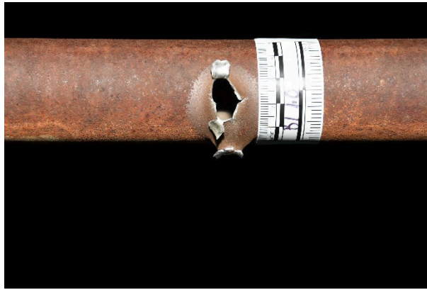
Figure 5: BI 1.0

Officer Involved Critical Incident - 4802 James Road, North Ridgeville, Ohio