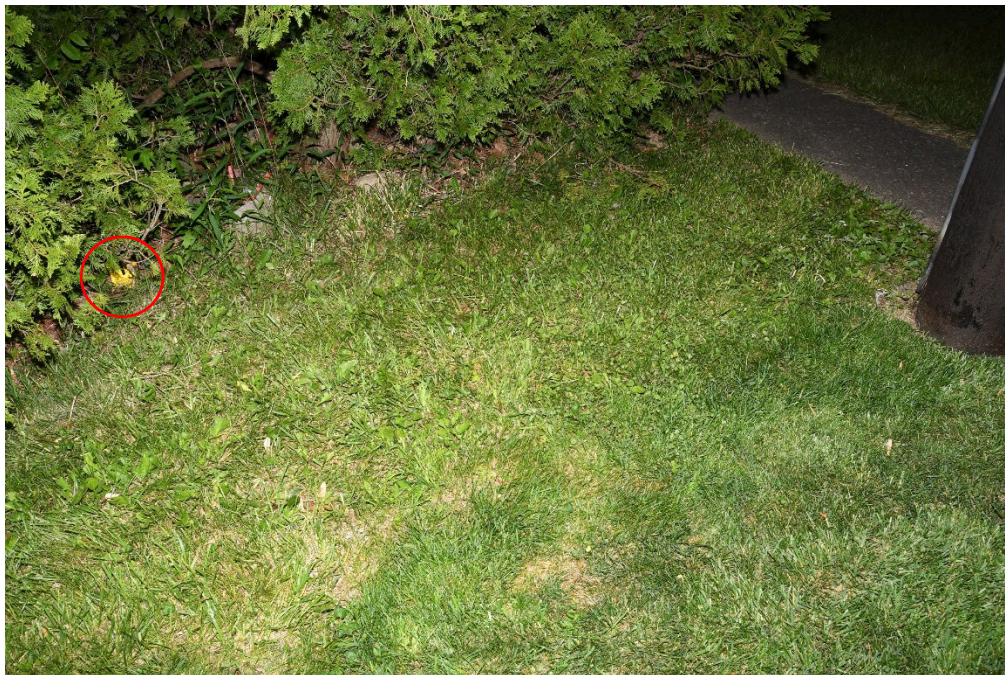
Figure 1: Evidence #1

The scene was photographed as found and examined for items of suspected evidence. Three separate areas of evidence were located, the two areas where the Officers were located described above and the driveway and yard of 4802 James Rd. The area where one officer was located, near the electric pole and bush located between addresses 4784 James Rd. and 4762 James Rd, produced one F. C. 223 Rem fired cartridge case under the bush and labeled evidence #1 .