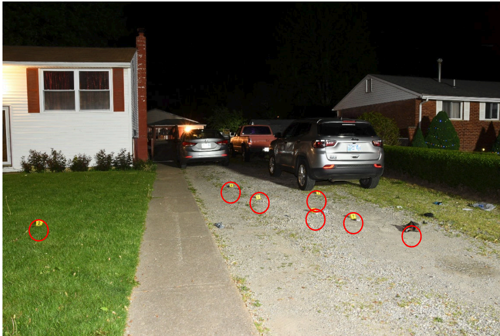
Figure 2: Evidence 2-8

Officer Involved Critical Incident - 4802 James Road, North Ridgeville, Ohio