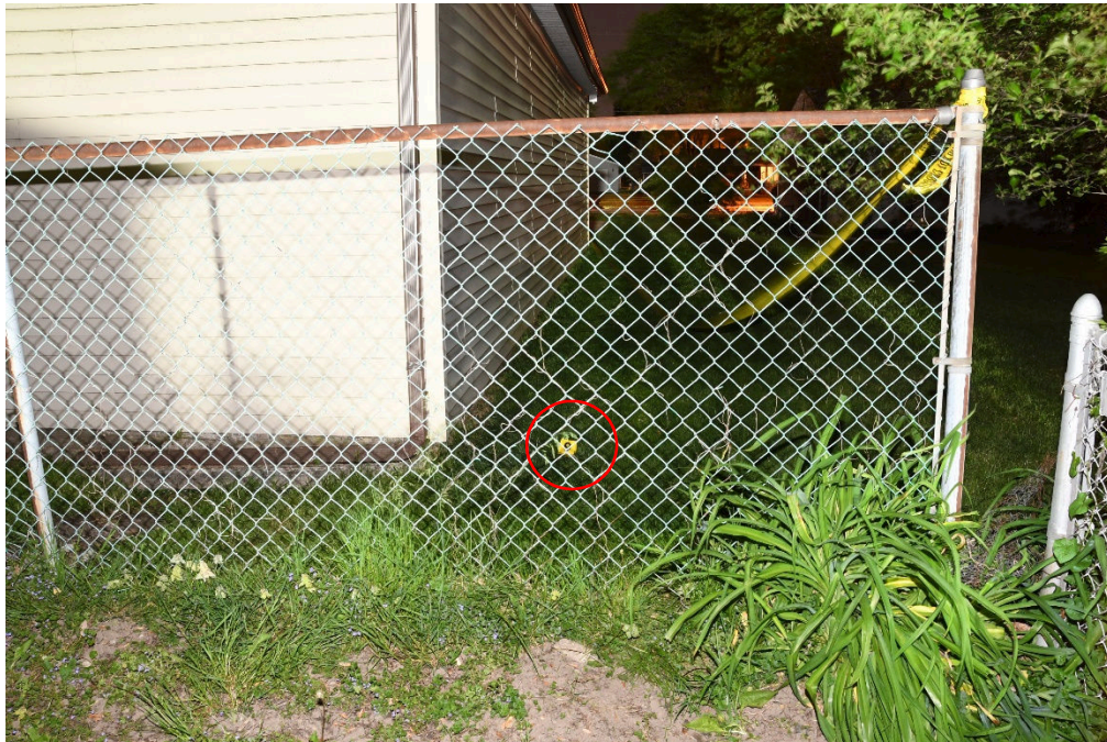
Figure 3: Evidence #9

Officer Involved Critical Incident - 4802 James Road, North Ridgeville, Ohio