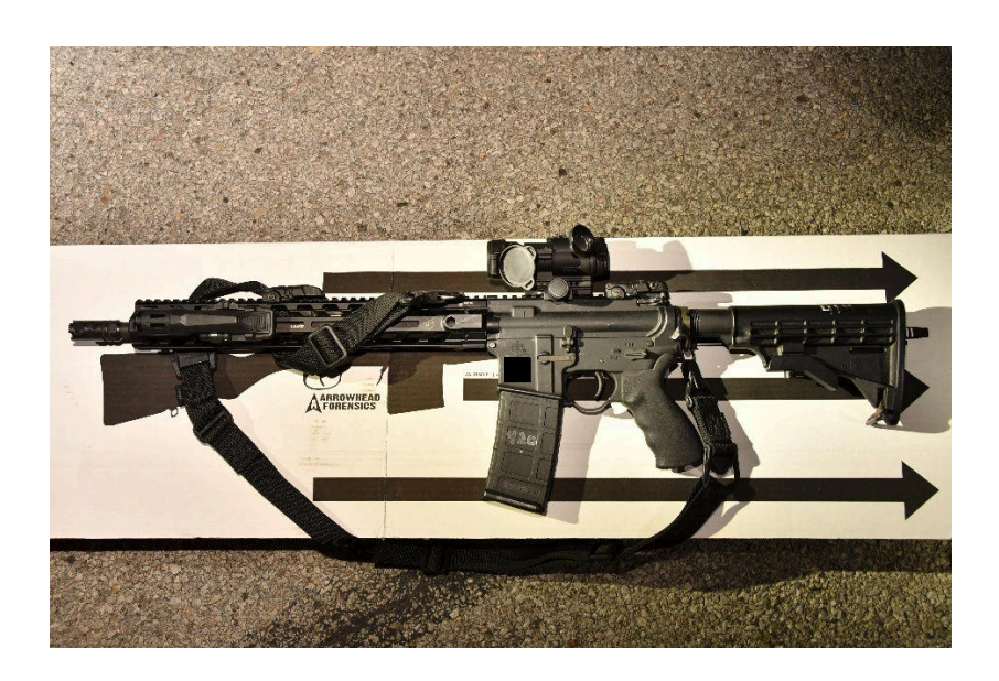
BCI Item #4

2024-1584 Officer Involved Critical Incident - 27695, Tracy Road, Walbridge, OH 43465