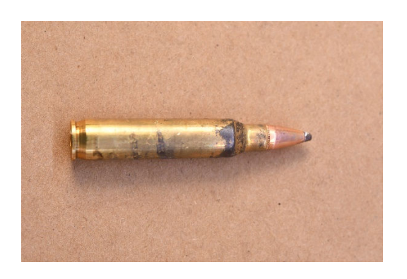
Full cartridge found in chamber of BCI Item #4