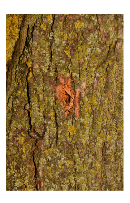
Damage to the north side of the tree.

2024-1584 Officer Involved Critical Incident - 27695, Tracy Road, Walbridge, OH 43465