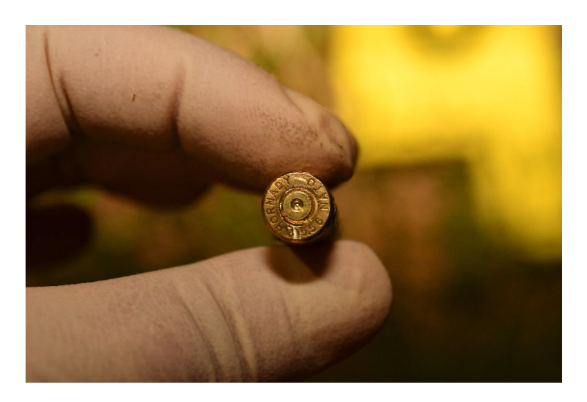
BCI Item #6

A phone with a black "LIFEPROOF" case was found on the east slope of the ditch. It was found with no power when collected. The phone was placed into a manila envelope, sealed with clear tape, and labeled as BCI Item #2 .