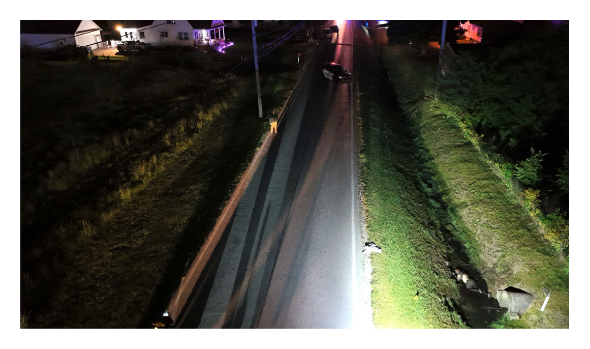
Ariel view of scene

2024-1584 Officer Involved Critical Incident - 27695, Tracy Road, Walbridge, OH 43465