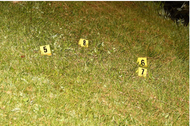
Photographs of BCI Item 5-8