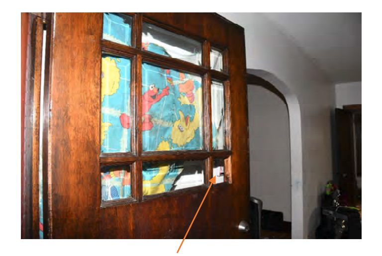
(Broken Window Front Door)