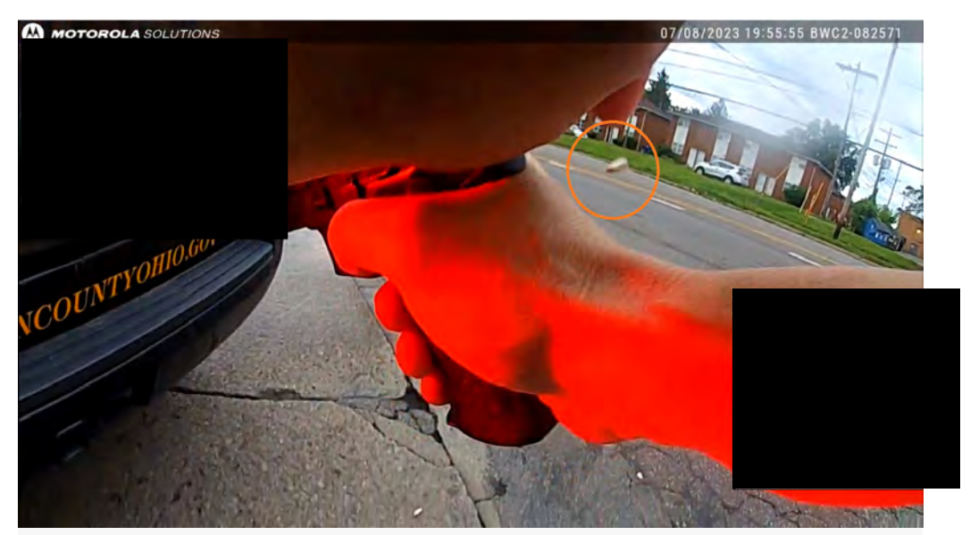
BWC 13: initiated a "Tap Rack Bang" response to the failure to fire and as he racked the slide, a fourth unfired cartridge is ejected from his pistol (BCI Item 4)