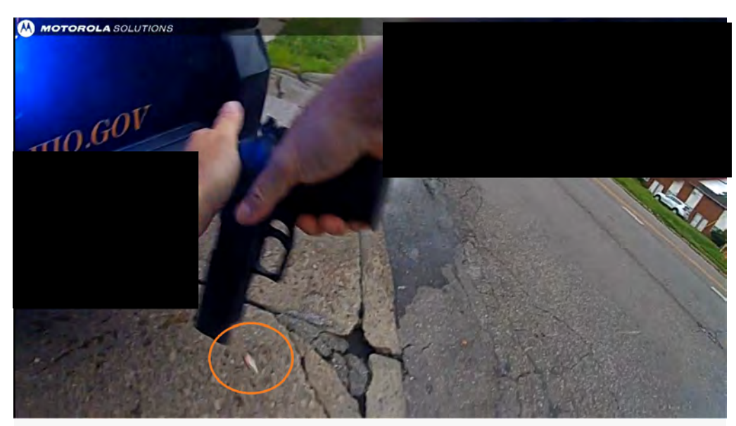
BWC 7: ejecting unfired cartridge from his pistol while attempting to fix malfunction (BCI Item 4)