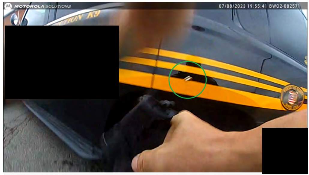
BWC 11: racked the slide after inserting new magazine causing third unfired cartridge to be ejected onto ground (BCI Item 3)