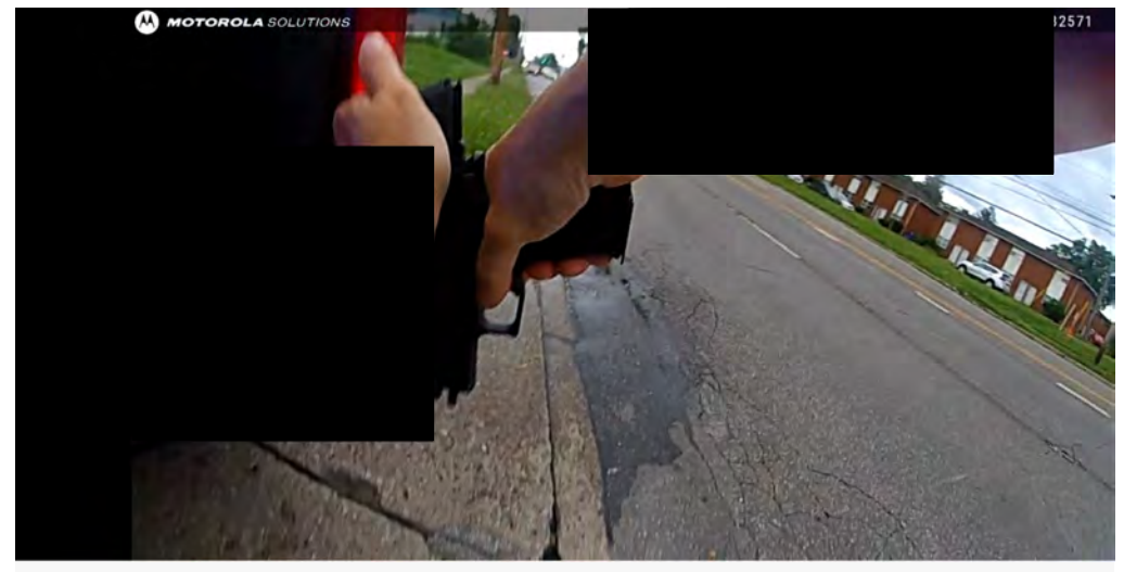
BWC 6: attempting to fix malfunction of his duty pistol