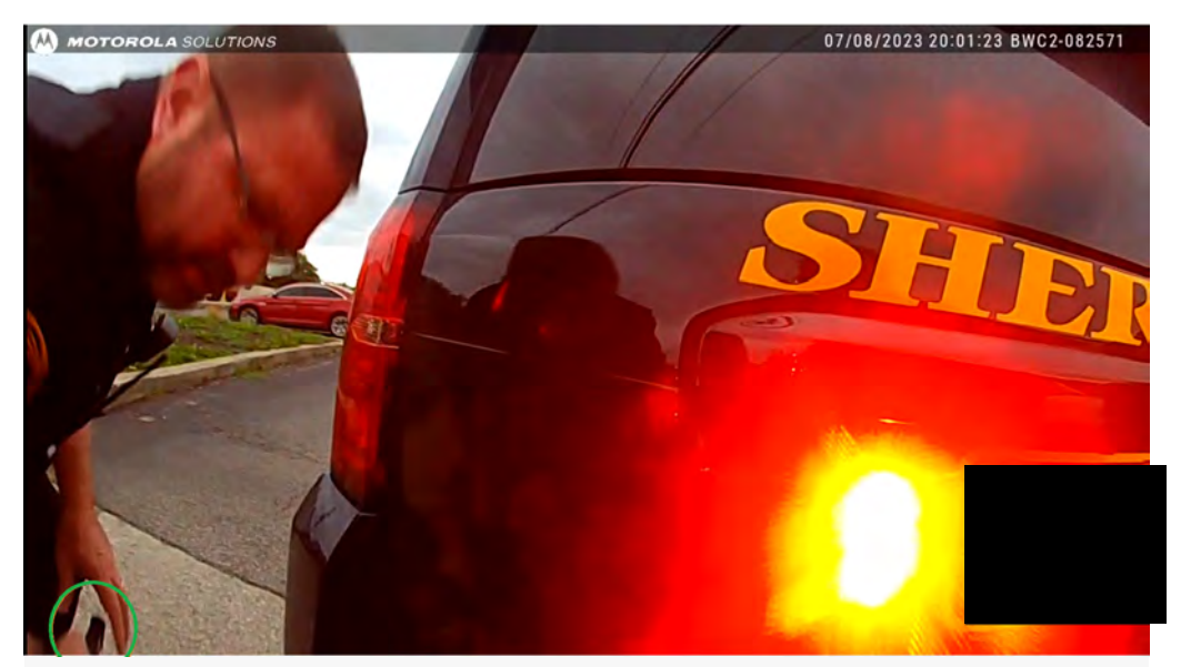
BWC 15: FCSO Sgt. Conkel retrieving spistol magazine from the pavement