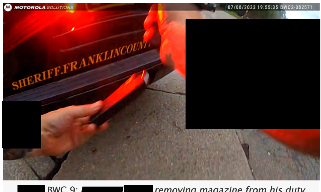
BWC 9: removing magazine from his duty pistol and letting it fall to the ground