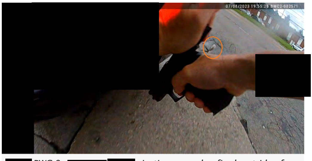
BWC 8: ejecting second unfired cartridge from his pistol while attempting to fix malfunction (BCI Item 4)

moved towards the driver's side door of his cruiser and updated Dispatch that Lindsey was still at the entrance door. then moved towards the rear of his cruiser and stripped the magazine from his pistol (See Photo BWC 9') and left it on the ground, then moved back towards the driver's side of his cruiser, inserted a replacement magazine into his pistol (See Photo BWC 10'), racked the slide on his pistol and caused another unfired cartridge (BCI Item 3) to eject from the pistol and fall to the ground (See Photo BWC 11'). After racking the slide on the pistol, spistol comes into view of the BWC and at that point it is observed that the magazine wasn't fully inserted into the magazine well of the pistol (See Photo BWC 12'). moved back to the passenger rear corner of his cruiser and attempted to discharge (audible indications trigger pulled and hammer falling) his pistol at Lindsey. response to the failure to fire and as he racked the slide, another unfired cartridge (BCI Item 4) is ejected from his pistol (See Photo BWC 13'). Lindsey can be observed ducking in and out of the front door waiving a jacket (See Photo CVS 5') and pointing towards (See Photo CVS 6') in what appears to be a "taunting" manner.