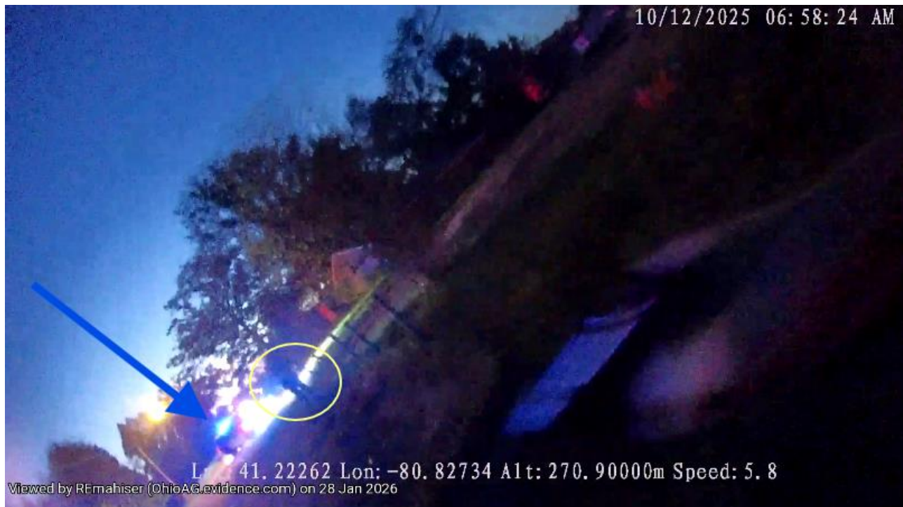
Figure 4:CTPD [REDACTED] BWC; [REDACTED] and [REDACTED] (circled in yellow) running towards WPD [REDACTED] Cruiser (depicted with blue arrow) while pursuing Brad Bailey.

This document is the property of the Ohio Bureau of Criminal Investigation and is confidential in nature. Neither the document nor its contents are to be disseminated outside your agency except as provided by law - a statute, an administrative rule, or any rule of procedure.