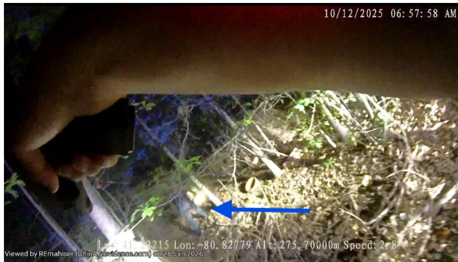
Figure 2: CTPD ██████████ BWC; ██████████ and ██████████ pursuing Brad Bailey through the debris filled wooded area, while still dark. ██████████ is depicted by the blue arrow.