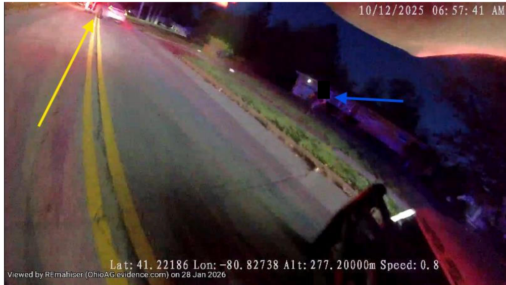
Figure 1:CTPD [REDACTED] BWC, white Buick Regal with driver's door ajar parked in the middle of Fifth Street depicted by the yellow arrow, [REDACTED] depicted by the blue arrow actively pursuing Brad Bailey who was running northbound into the wooded area.

below depicts the resting location in the roadway of the white Buick Regal driven by Brad during the vehicle pursuit, and [REDACTED] pursuing Brad on foot as he fled north towards the wooded area.