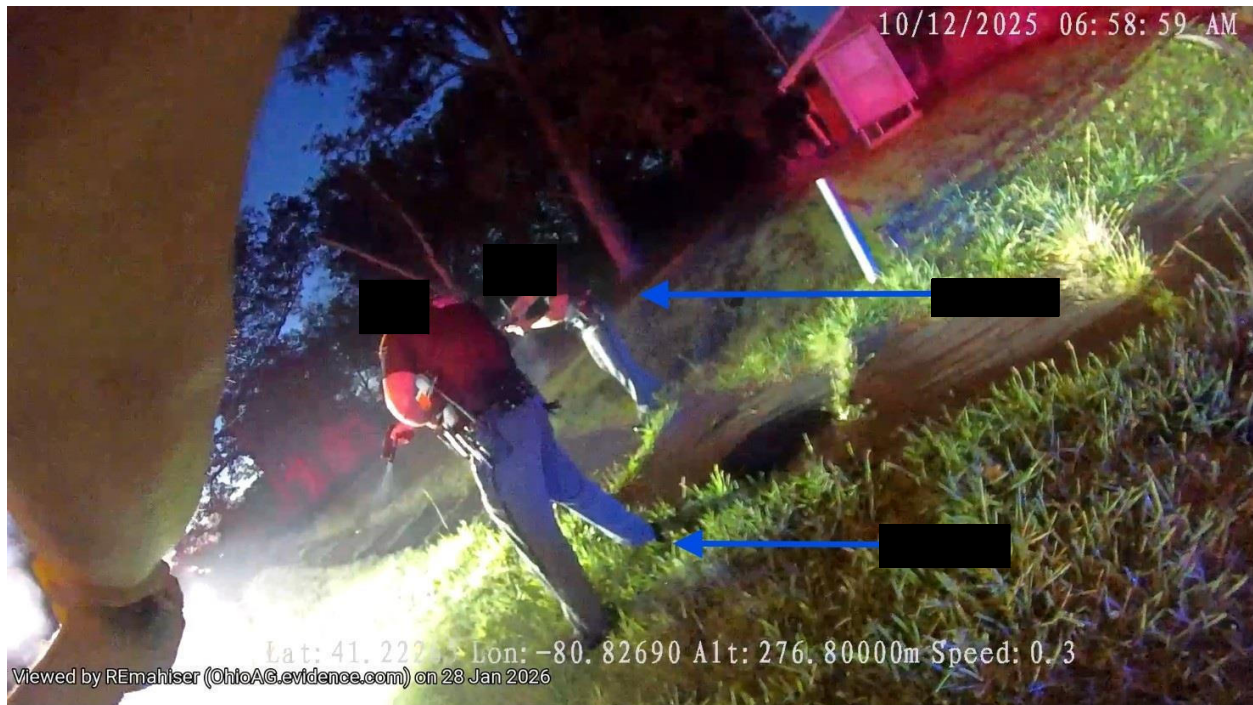
Figure 188:CTPD [REDACTED] BWC: Shots fired by [REDACTED] and [REDACTED] and [REDACTED] are depicted with marked blue arrows

This document is the property of the Ohio Bureau of Criminal Investigation and is confidential in nature. Neither the document nor its contents are to be disseminated outside your agency except as provided by law - a statute, an administrative rule, or any rule of procedure.