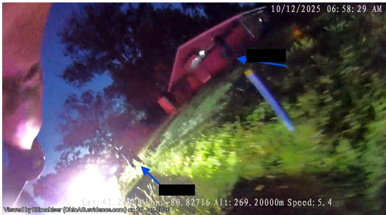
Figure 14: CTPD [REDACTED] BWC: Shots fired by [REDACTED] and [REDACTED] and [REDACTED] are depicted with marked blue arrows.

This document is the property of the Ohio Bureau of Criminal Investigation and is confidential in nature. Neither the document nor its contents are to be disseminated outside your agency except as provided by law - a statute, an administrative rule, or any rule of procedure.