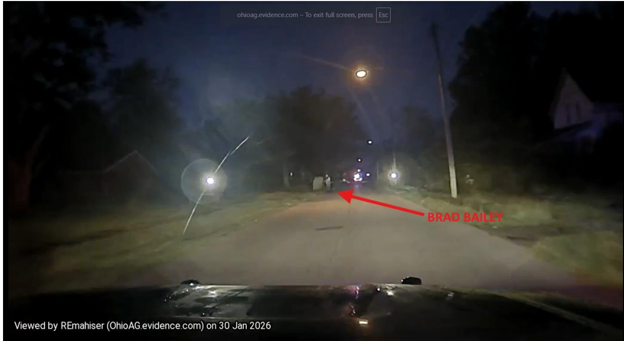
Figure 3 [REDACTED] Dash Cam Uni [REDACTED] As [REDACTED] pulls westbound onto Fourth Street, responding emergency lights and sirens, Brad Bailey (red arrow) can first be seen down the street moving towards [REDACTED] approaching WPD cruiser.

towards [REDACTED] approaching WPD cruiser as depicted in the photo below (T: 02:46).