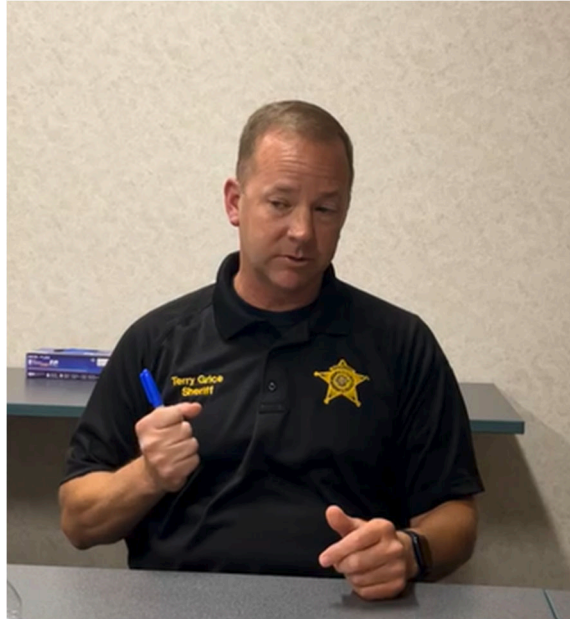
(Demonstration of how the knife was held)

Sheriff Grice was asked to demonstrate how the female was holding the knife during the encounter. With the use of a marker and the blue cap acting as the blade, Sheriff Grice grabbed it with his right hand and held it up as illustrated below. (28:27 mark)