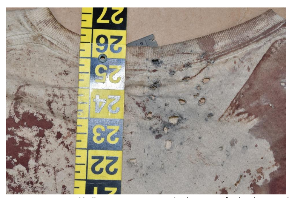
Figure #4 – Suspected ballistic impacts to upper back portion of t-shirt (Item #28)