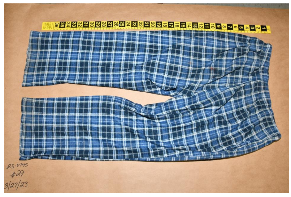
Figure #7 – Overall condition of the back of pajama pants (Item #29)

This document is the property of the Ohio Bureau of Criminal Investigation and is confidential in nature. Neither the document nor its contents are to be disseminated outside your agency except as provided by law - a statute, an administrative rule, or any rule of procedure.