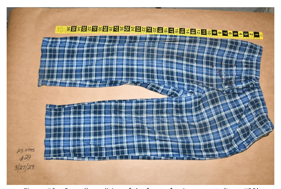
Figure #6 – Overall condition of the front of pajama pants (Item #29)

CST Rostocil photographed a pair of blue and white pajama pants with suspected bloodstains and defects to the front, showing the overall condition of the pants (Figures #6-7)