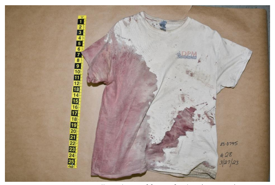
Figure #1 – Overall condition of front of t-shirt (Item #28)

CST Rostocil photographed a GILDAN brand, size L t-shirt with a DPM Construction logo on the front and back (Item #28), showing the overall condition of the t-shirt (Figures #1-2) The t-shirt had suspected bloodstains, a defect to the front left torso portion, and suspected ballistic impacts to the upper back area and to the left side of the torso portion (Figures #3-5).