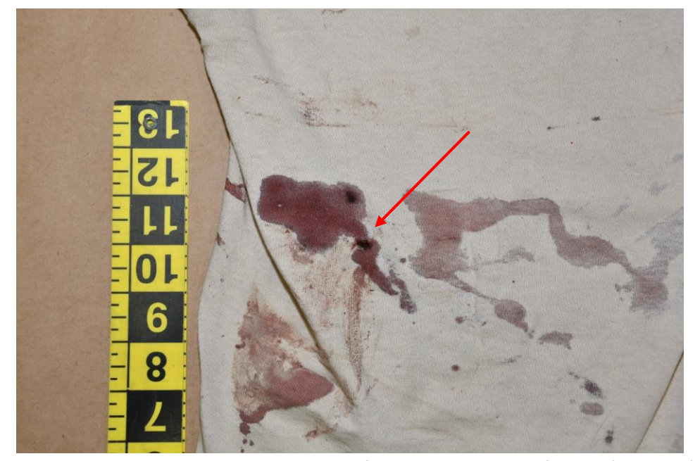
Figure #5 – Suspected ballistic impact to left side torso portion of t-shirt (Item #28)

This document is the property of the Ohio Bureau of Criminal Investigation and is confidential in nature. Neither the document nor its contents are to be disseminated outside your agency except as provided by law - a statute, an administrative rule, or any rule of procedure.