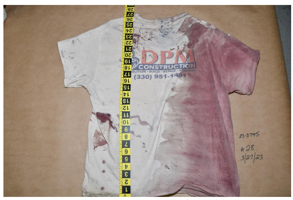
Figure #2 – Overall condition of back of t-shirt (Item #28)