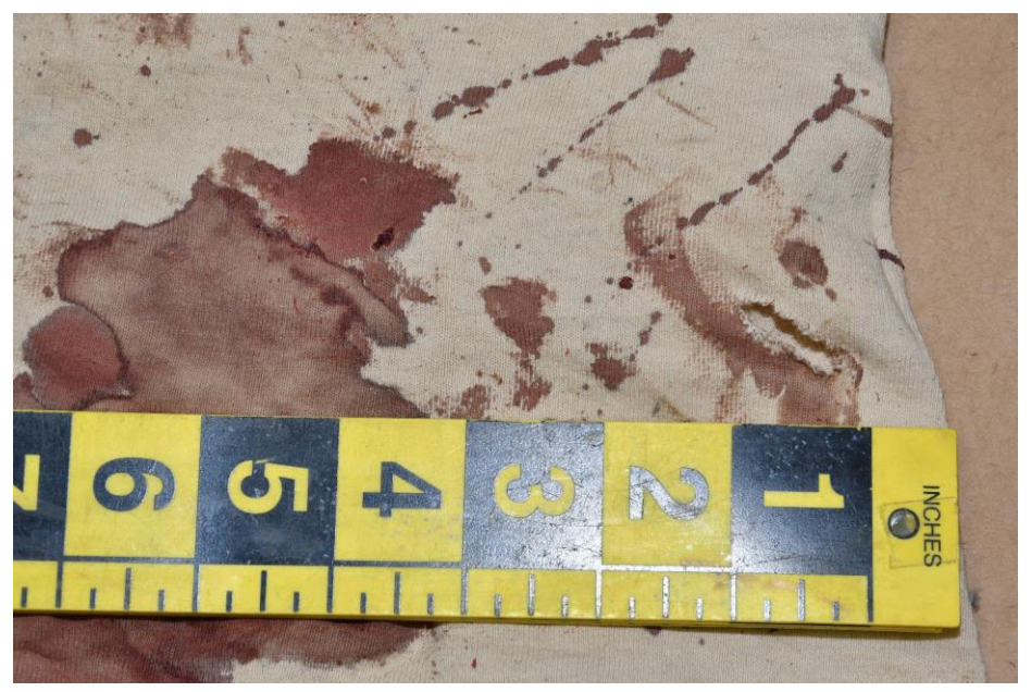
Figure #3 – defect to the left side front torso portion of t-shirt (Item #28)

This document is the property of the Ohio Bureau of Criminal Investigation and is confidential in nature. Neither the document nor its contents are to be disseminated outside your agency except as provided by law - a statute, an administrative rule, or any rule of procedure.