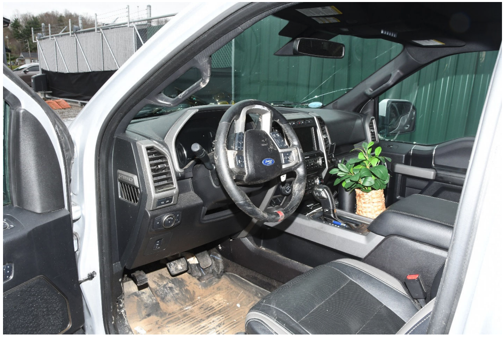
Figure #5 - Overall front driver compartment