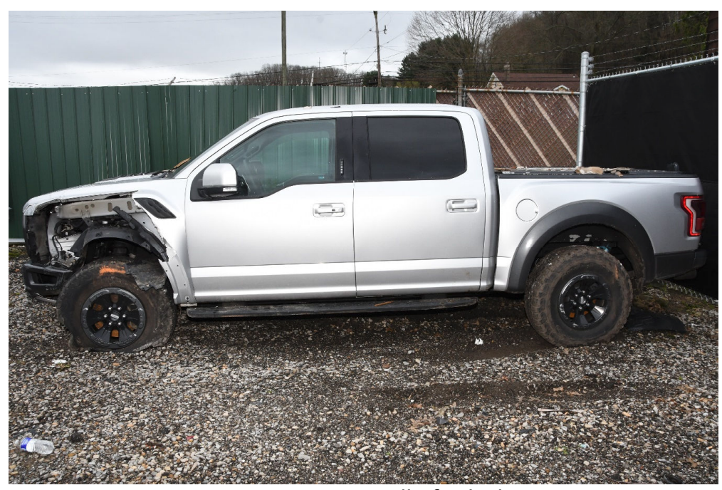
Figure #2 - Overall of vehicle

Officer Involved Critical Incident - 100 Block 8th Street, N.E. New Philadelphia, Ohio 44663