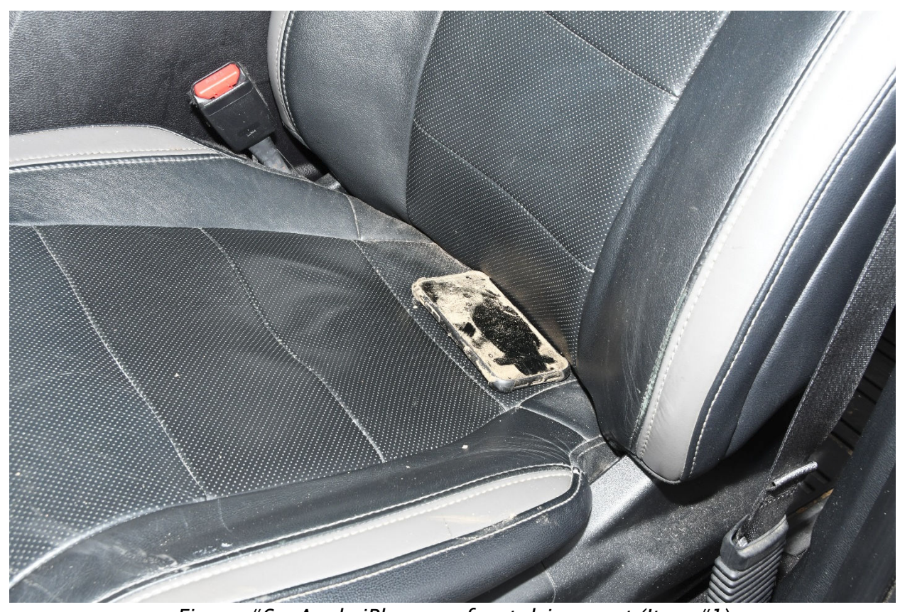
Figure #6 - Apple iPhone on front driver seat (Item #1)

2024-1015 Officer Involved Critical Incident - 100 Block 8th Street, N.E. New Philadelphia, Ohio 44663