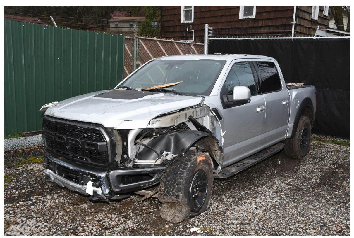
Figure #1 - Overall of vehicle

SA Doran photographed the exterior and interior of the vehicle as it was found outside in the secured fenced area (Figures #1-5). The vehicle exhibited damage to the front end. The vehicle was searched for items of suspected evidence and one (1) item of suspected evidence was located, documented, and collected; identified as a black Apple iPhone located on the front driver seat (Figure #6). It was determined that the phone was originally on the driver floorboard but was placed onto the seat by a tow truck driver.