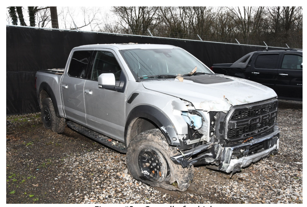
Figure #3 - Overall of vehicle