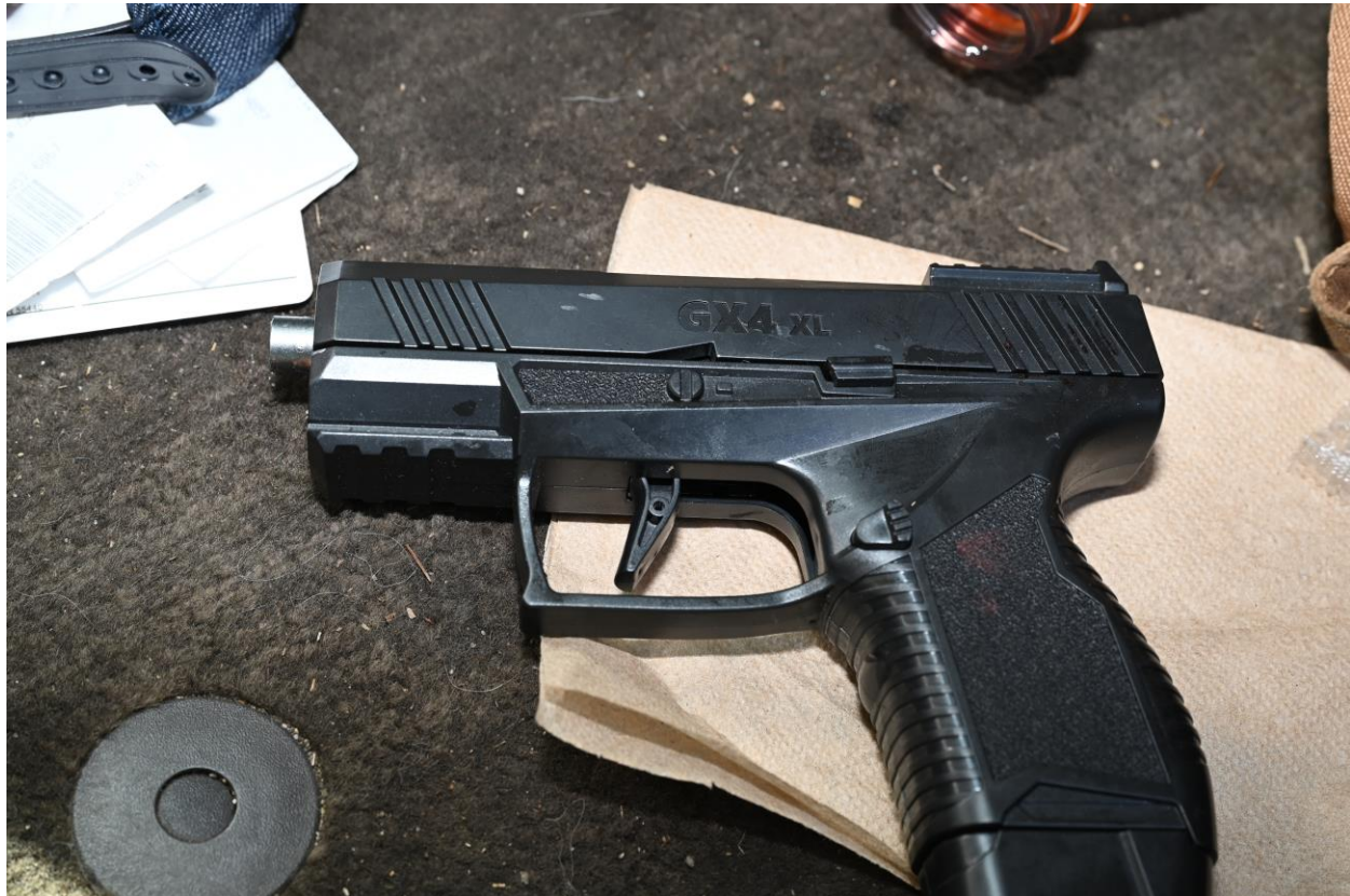
Figure 5: Replica GX4 XL Handgun found in passenger floorboard area of white Buick Regal (Photo LGH_1981)

Agents also recovered a second replica handgun from the front passenger floorboard area of the white Buick driven by Brad Bailey, as pictured below.