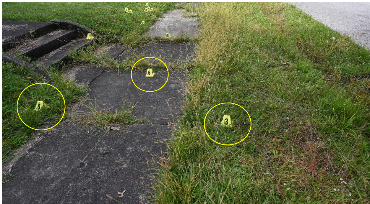
Figure 3: Items 3, 5, 6

This document is the property of the Ohio Bureau of Criminal Investigation and is confidential in nature. Neither the document nor its contents are to be disseminated outside your agency except as provided by law - a statute, an administrative rule, or any rule of procedure.