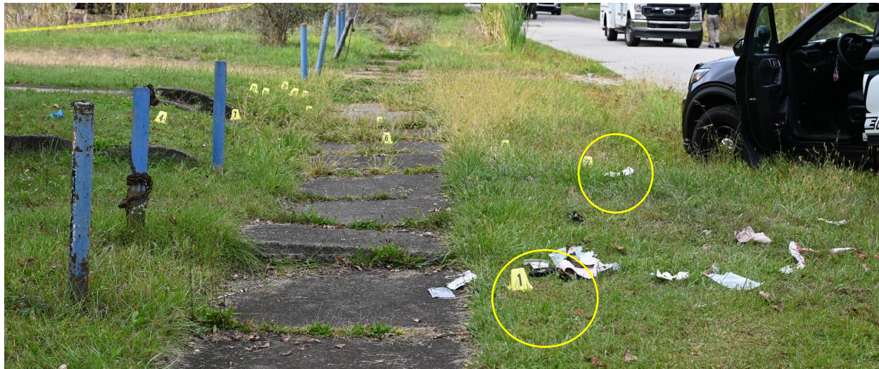
Figure 2: Items 1 & 2

Officer-Involved Critical Incident - Officer Involved Critical Incident - 681 4th St. SW, Warren, OH 44483, Trumbull County (L)