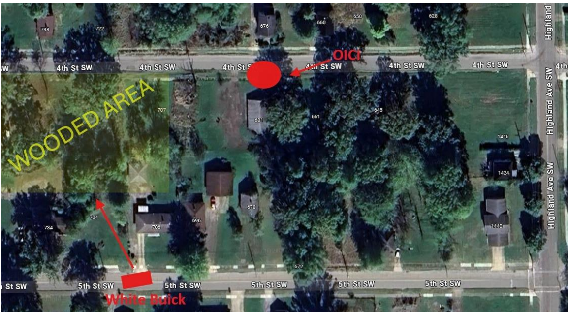
Figure 1: Red Square is the approximate resting location of the white Buick, the wooded area where Brad fled on foot to evade police is depicted in yellow, and the OICI area is depicted with a red circle.

Pursuing officers requested that WPD deploy vehicle spikes in an attempt to disable the vehicle and end the vehicle pursuit. At 06:57 hours WPD Ofc. Justin Fenstermaker deployed his assigned vehicle spikes which successfully disabled the white Buick, causing the vehicle to noticeably slow. Within seconds, the white Buick came to rest in the middle of Fifth Street SW, in front 706 Fifth Street SW, and according to involved and witness officers, Brad exited the driver's door of the white Buick with a black handgun in his possession. Brad then fled northbound on foot into a wooded area, while being pursued by [REDACTED], [REDACTED], [REDACTED], and Ofc. Rudesill. Below is an overview depiction of the block area between Fifth Street SW and Fourth Street SW where this and the OICI occurred.