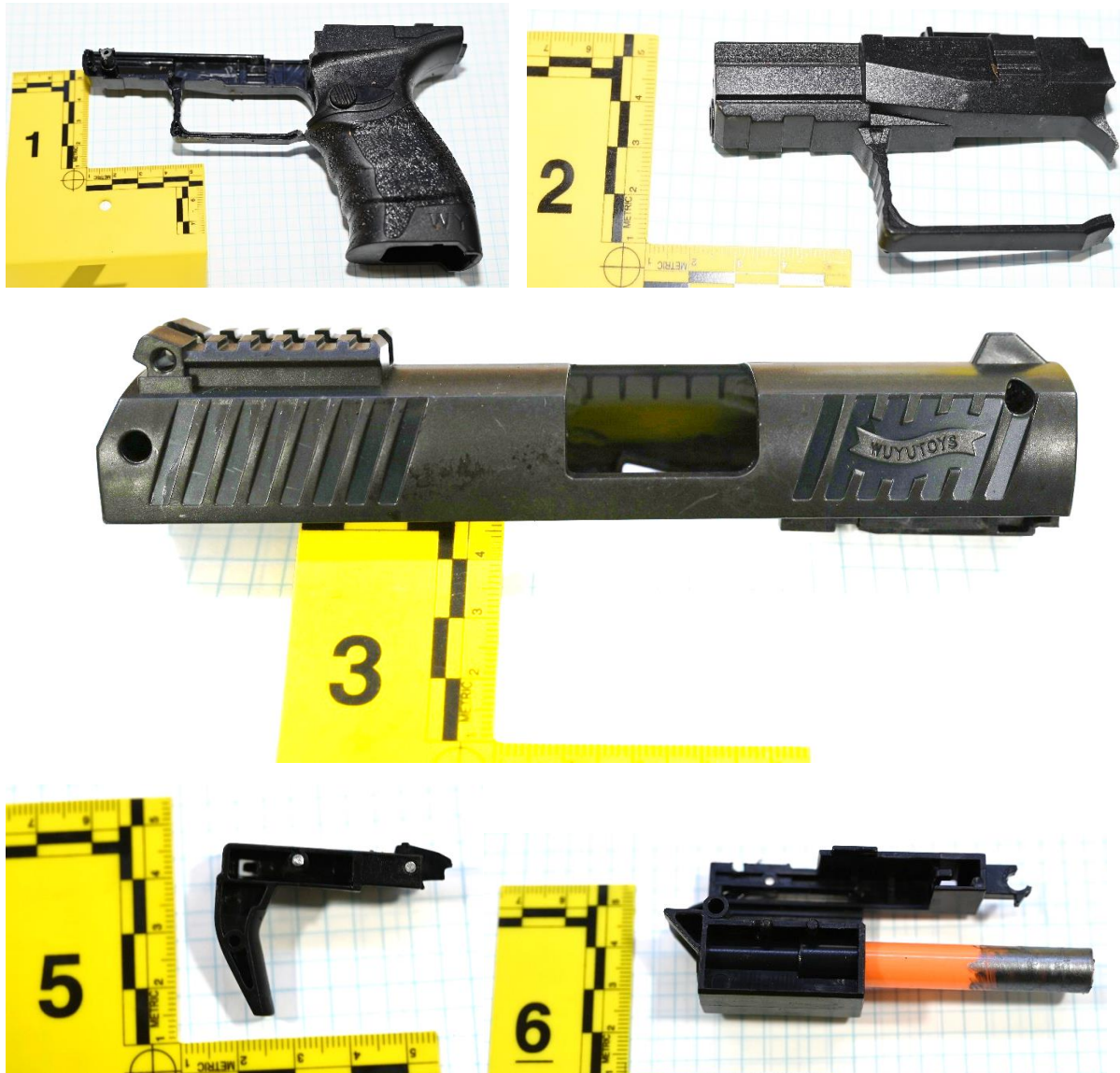
Figure 4: Evidence items 1, 2, 3, 5, 6 pieces of the replica handgun

Below are the corresponding evidence items SA Lulla collected belonging to the Wuyutoys replica handgun that was used in the OICI by Brad.