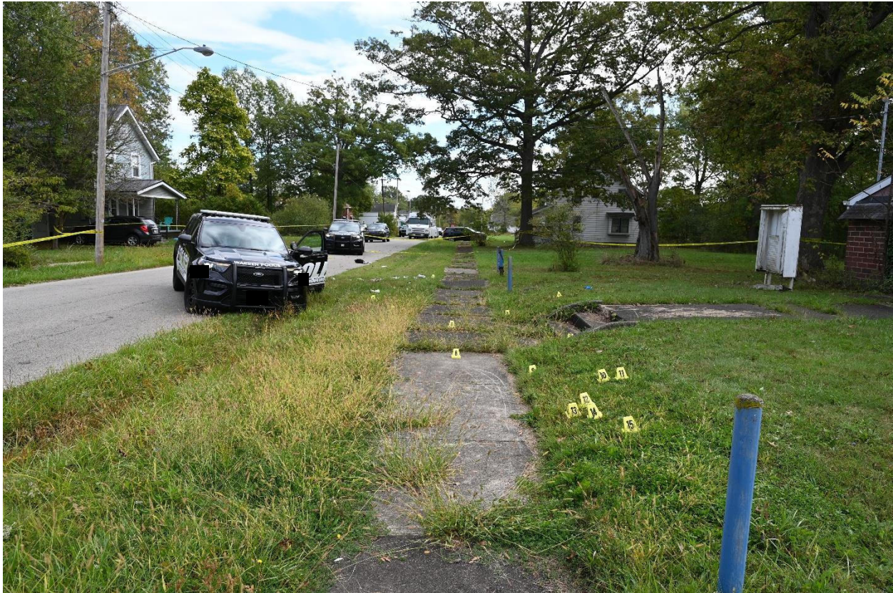
Figure 1: 600 Block of 4th Street SW

After the photographic documentation was completed, SA Lulla located several plastic pieces from a Wuyutoys replica handgun evidence items 1, 2, 3, 5, and 6.