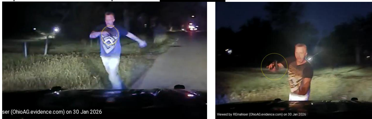
Figure 4 [REDACTED] Dash Cam Uni [REDACTED] Brad Bailey running towards WPD [REDACTED] cruiser displaying a black handgun in his right hand. The black handgun is circled in yellow.

Pursuing Officers radio and yell that Brad has a gun and Brad is headed directly into the path of an oncoming cruiser. As Brad still running approaches the front of [REDACTED] cruiser Brad can be seen in the video reviewed carrying a black handgun, as depicted in the screen capture from [REDACTED] dash camera video below.