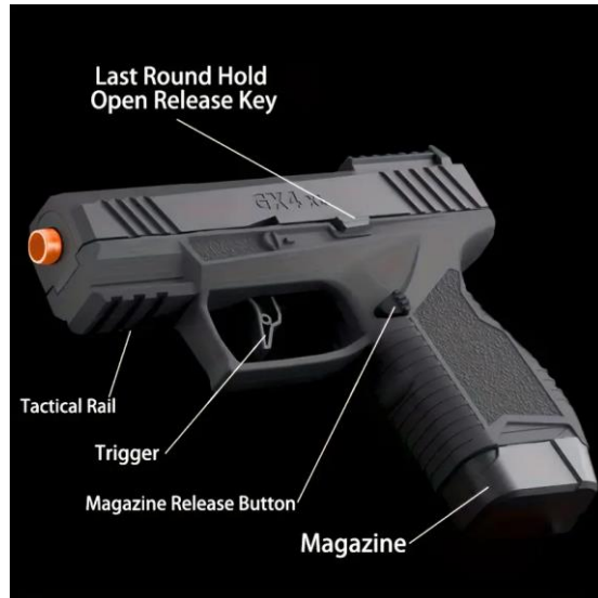
Figure 6: Left Photo – Real Taurus 9mm GX4 XL, Right Photo – Chinese made GX4 XL Shell Ejection “Toy Gun” direct replica of real-world handgun