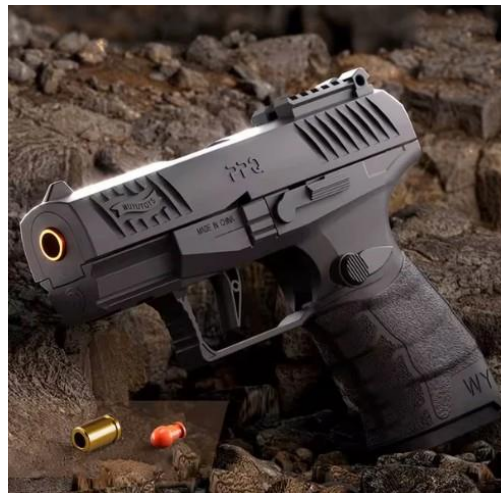
Figure 7: Left Photo – Real Walther 9mm PPQ, Right Photo – Chinese made PPQ Shell Ejection “Toy Gun” direct replica of real-world handgun

This document is the property of the Ohio Bureau of Criminal Investigation and is confidential in nature. Neither the document nor its contents are to be disseminated outside your agency except as provided by law - a statute, an administrative rule, or any rule of procedure.