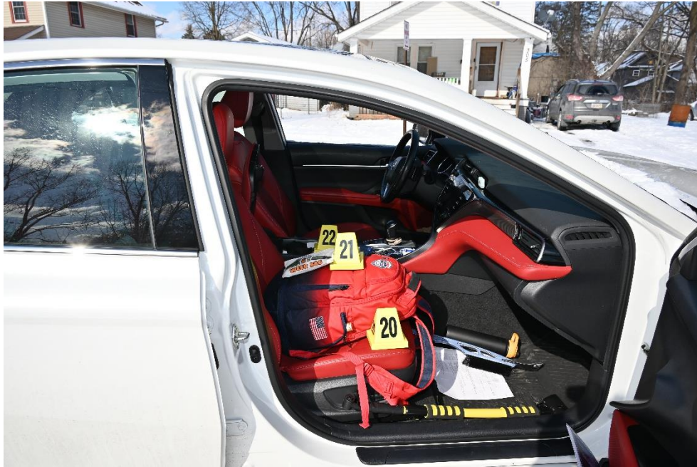
Figure 4: Evidence Items #20-22

Officer Involved Critical Incident - 294 Ira Avenue, Akron, OH 44301, Summit County