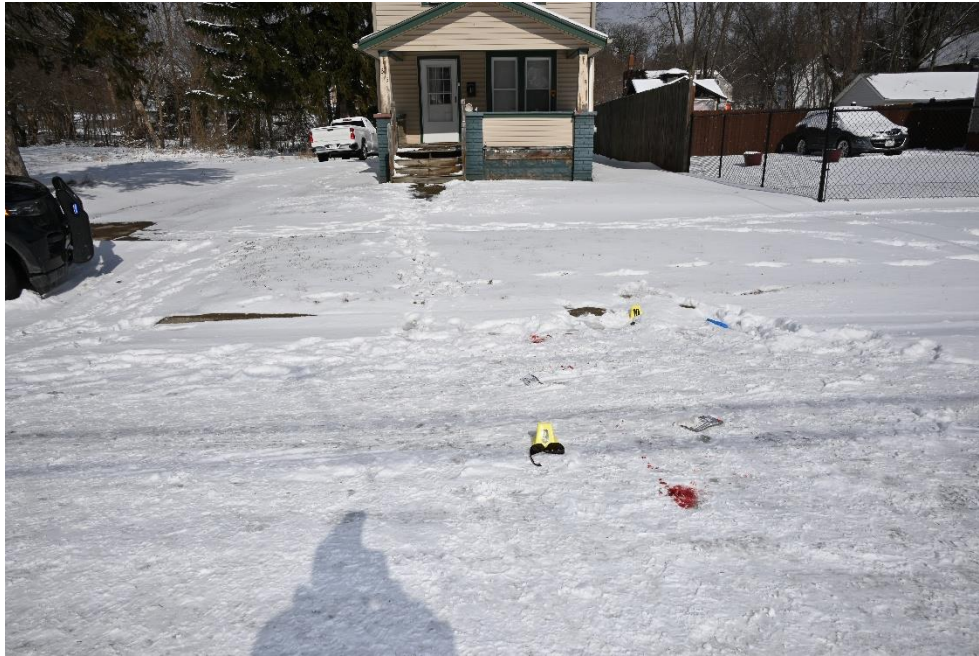
Figure 2: Evidence Items #9 & #10

Officer Involved Critical Incident - 294 Ira Avenue, Akron, OH 44301, Summit County