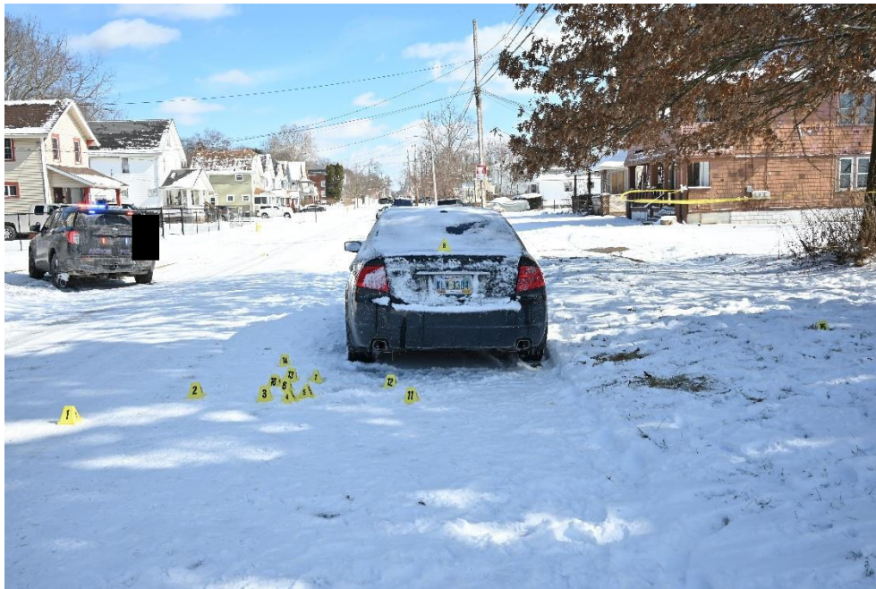
Figure 1: Evidence Items #1-8 & #11-16

This document is the property of the Ohio Bureau of Criminal Investigation and is confidential in nature. Neither the document nor its contents are to be disseminated outside your agency except as provided by law - a statute, an administrative rule, or any rule of procedure.