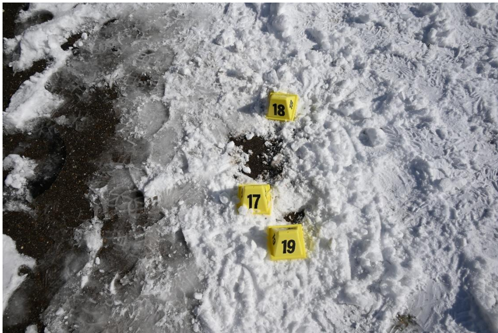
Figure 3: Evidence Items #17-19

This document is the property of the Ohio Bureau of Criminal Investigation and is confidential in nature. Neither the document nor its contents are to be disseminated outside your agency except as provided by law - a statute, an administrative rule, or any rule of procedure.