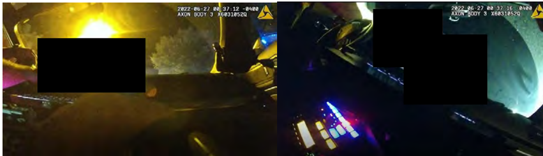
Example still images of Officer [REDACTED]'s body-worn camera footage

Nothing relevant is observed or heard in the footage prior to Officer [REDACTED] exiting the cruiser, due to the placement of Officer [REDACTED]'s body-worn camera and the audio delay.