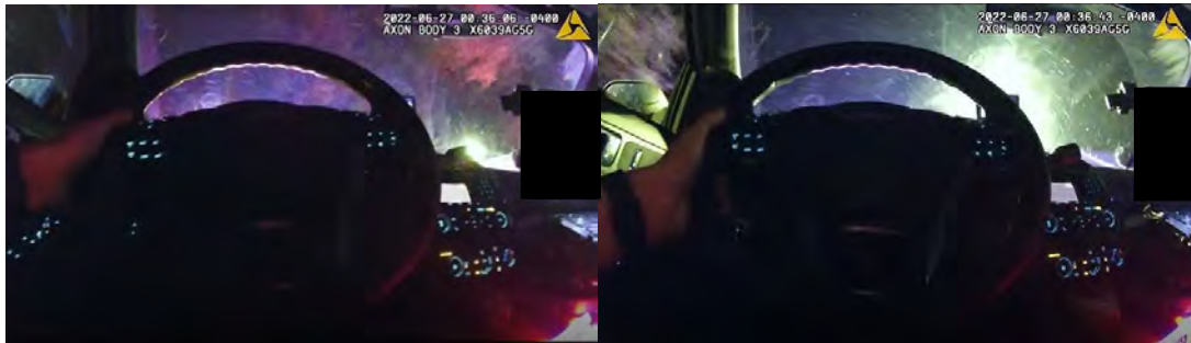
Example still images of Officer ██████'s body-worn camera footage

Nothing relevant is observed in the footage prior to Officer ██████ exiting the cruiser, due to the placement of Officer ██████'s body-worn camera.