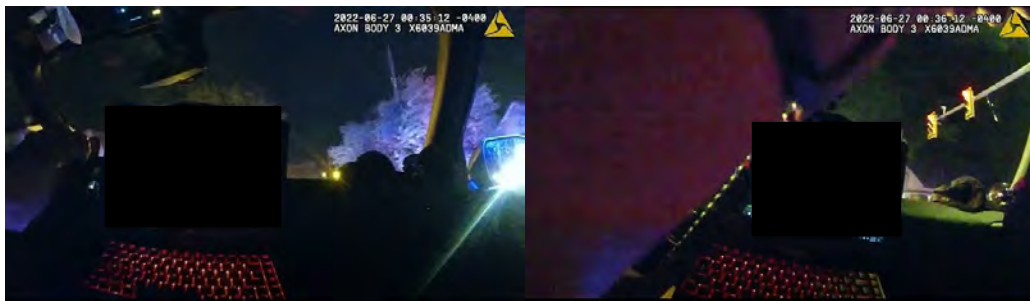
Example still images of Officer [REDACTED]'s body-worn camera footage

Nothing relevant is observed in the footage prior to Officer [REDACTED] exiting the cruiser, due to the placement of Officer [REDACTED]'s body-worn camera.