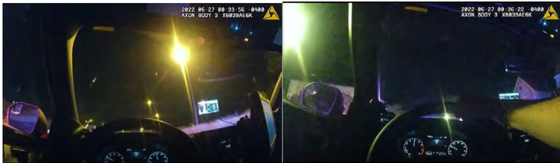
Example still images of Officer [REDACTED] s body-worn camera footage

Nothing relevant is observed in the footage prior to Officer [REDACTED] exiting the cruiser, due to the placement of Officer [REDACTED] s body-worn camera.