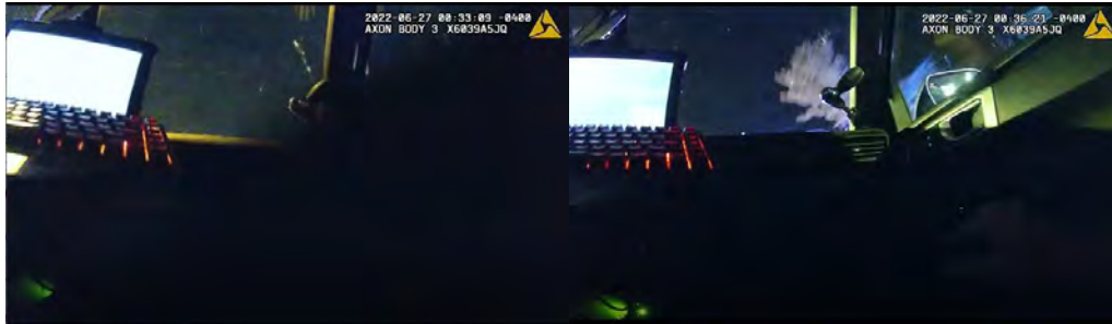
Example still images of Officer ██████'s body-worn camera footage

Officer Involved Critical Incident - 1659 S. Main Street, Akron, Ohio 44301