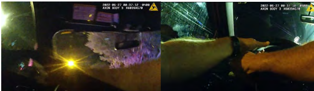
Example still images of Officer ██████'s body-worn camera footage

Nothing relevant is observed or heard in the footage prior to Officer ██████ exiting the cruiser, due to the placement of Officer ██████ body-worn camera and the audio delay.