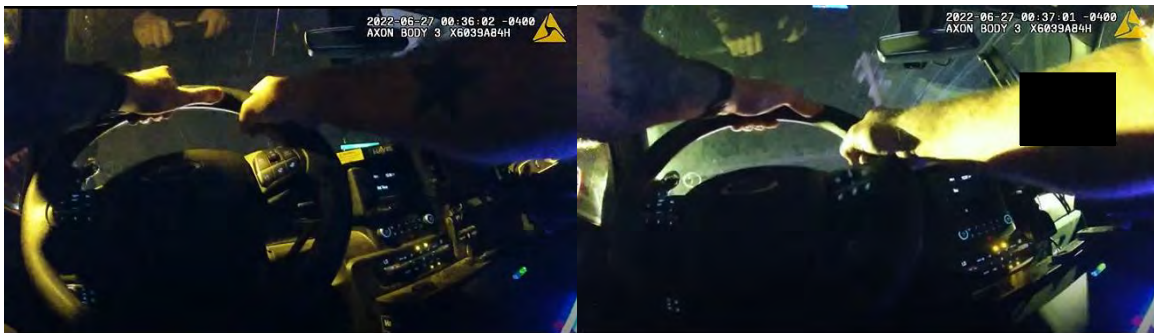
Example still images of Officer [REDACTED]'s body-worn camera footage

Nothing relevant is observed in the footage prior to Officer [REDACTED] exiting the cruiser, due to the placement of Officer [REDACTED]'s body-worn camera.