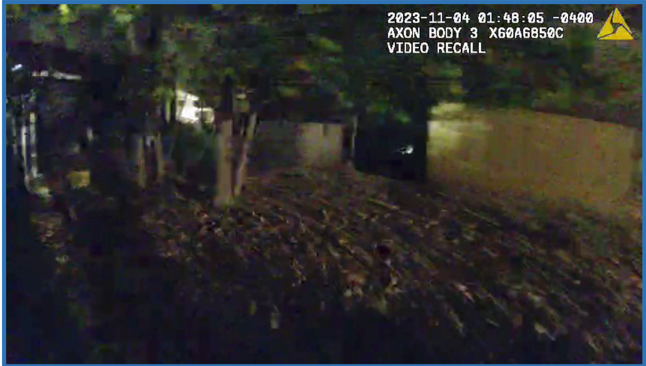
██████████ BWC - Image 9 (██████████ moving to his position between the fence [left] and the shed [right])

Officer Involved Critical Incident - 5230 Douglas Drive, North Olmsted, Ohio 44070