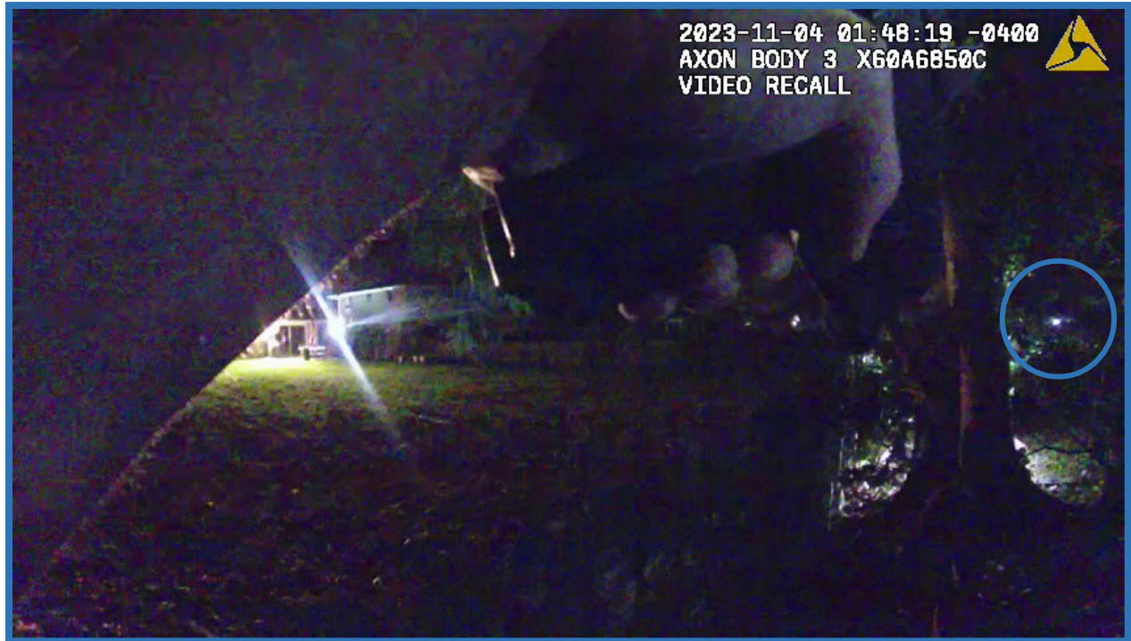
██████████ BWC - Image 11 (Another officer [likely ██████████] with a light on)

Officer Involved Critical Incident - 5230 Douglas Drive, North Olmsted, Ohio 44070