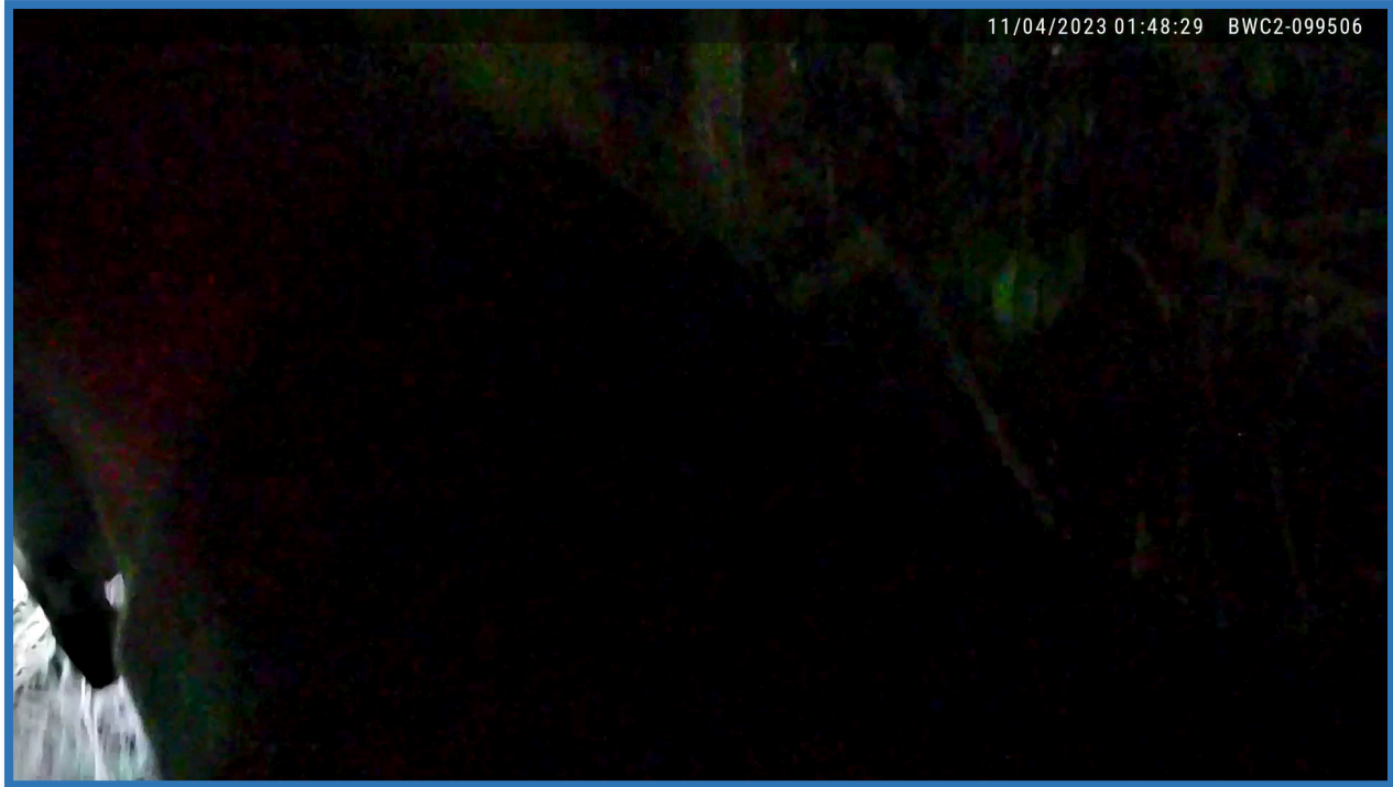
██████████ BWC - Image 3 (View when first gunshot was heard)

Officer Involved Critical Incident - 5230 Douglas Drive, North Olmsted, Ohio 44070