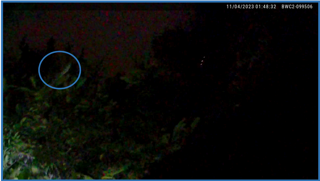
██████████ BWC - Image 5 (Second visible cartridge case)

Officer Involved Critical Incident - 5230 Douglas Drive, North Olmsted, Ohio 44070