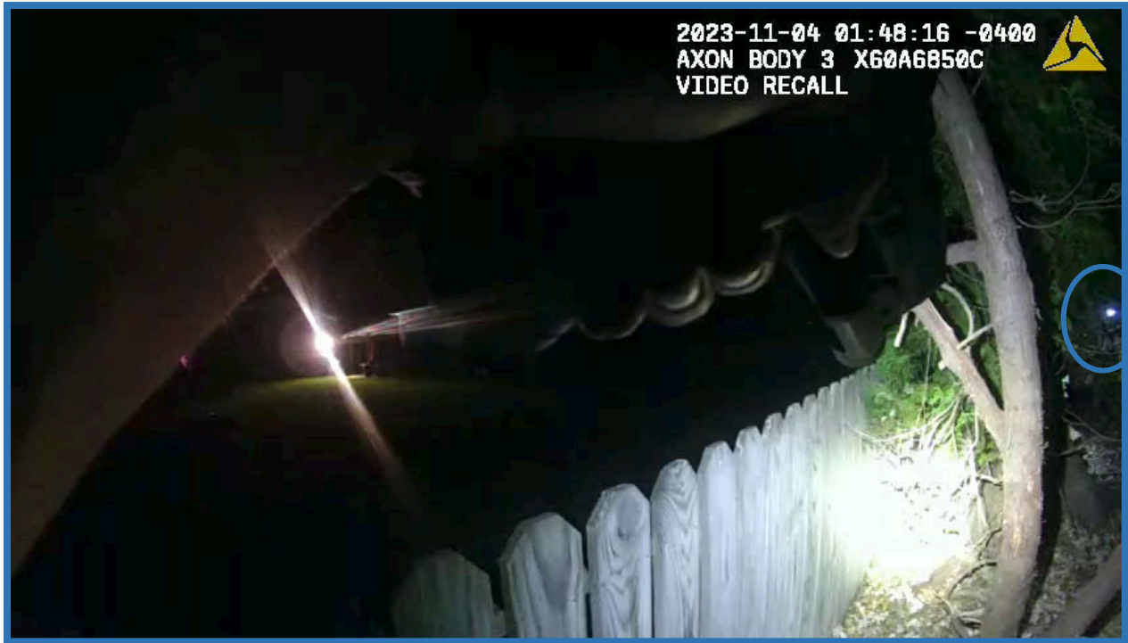
██████████ ██████████ BWC - Image 10 (Another officer [likely ██████████ ██████████] with a light)

Officer Involved Critical Incident - 5230 Douglas Drive, North Olmsted, Ohio 44070