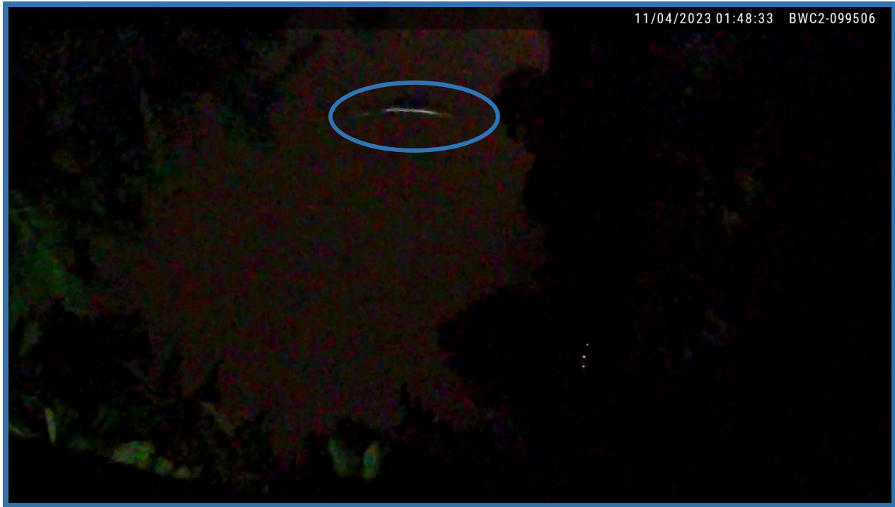
██████████ BWC - Image 7 (Fourth visible cartridge case)

Officer Involved Critical Incident - 5230 Douglas Drive, North Olmsted, Ohio 44070