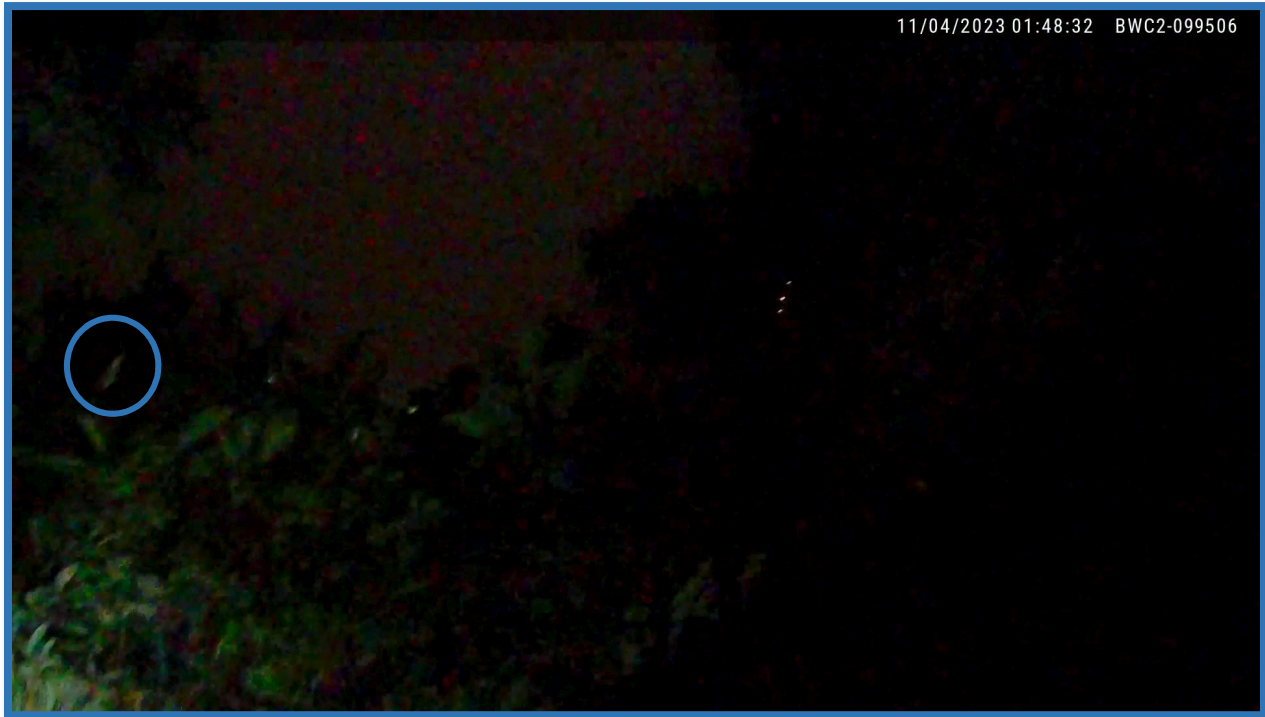
██████████ BWC - Image 6 (Third visible cartridge case)

Officer Involved Critical Incident - 5230 Douglas Drive, North Olmsted, Ohio 44070