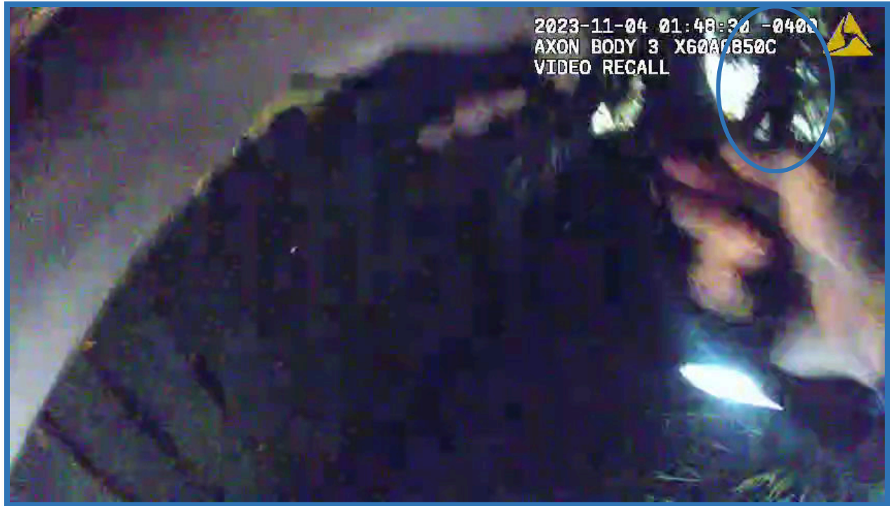
██████████ BWC - Image 12

Officer Involved Critical Incident - 5230 Douglas Drive, North Olmsted, Ohio 44070