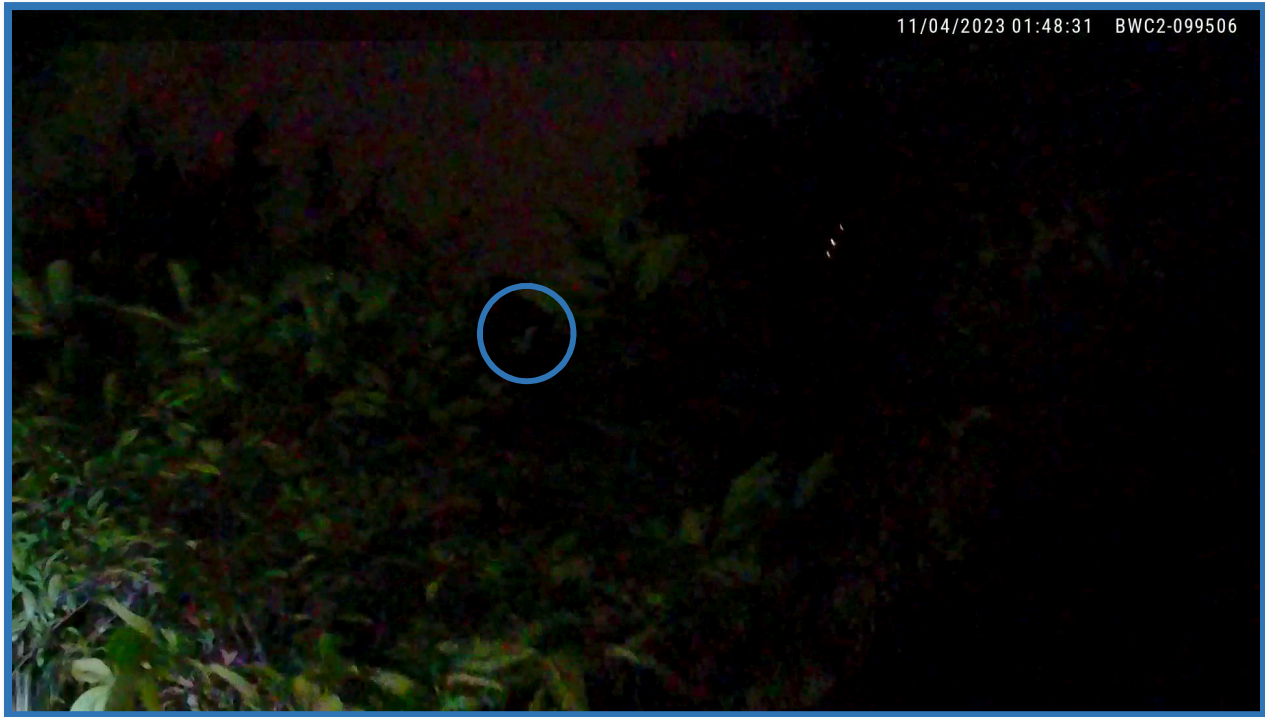
██████████ BWC - Image 4 (First visible cartridge case)

Officer Involved Critical Incident - 5230 Douglas Drive, North Olmsted, Ohio 44070