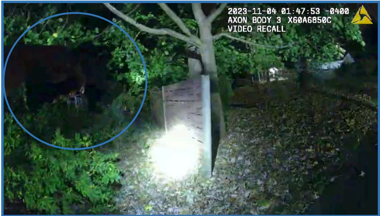
██████████ BWC - Image 8 (██████████'s pistol in his left hand)

Officer Involved Critical Incident - 5230 Douglas Drive, North Olmsted, Ohio 44070