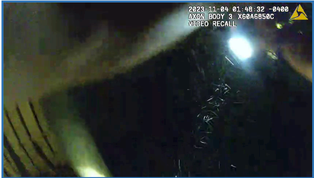
██████████ ██████████ BWC - Image 13 (Particles captured when ██████████ ██████████ appeared to be firing his pistol)

Officer Involved Critical Incident - 5230 Douglas Drive, North Olmsted, Ohio 44070