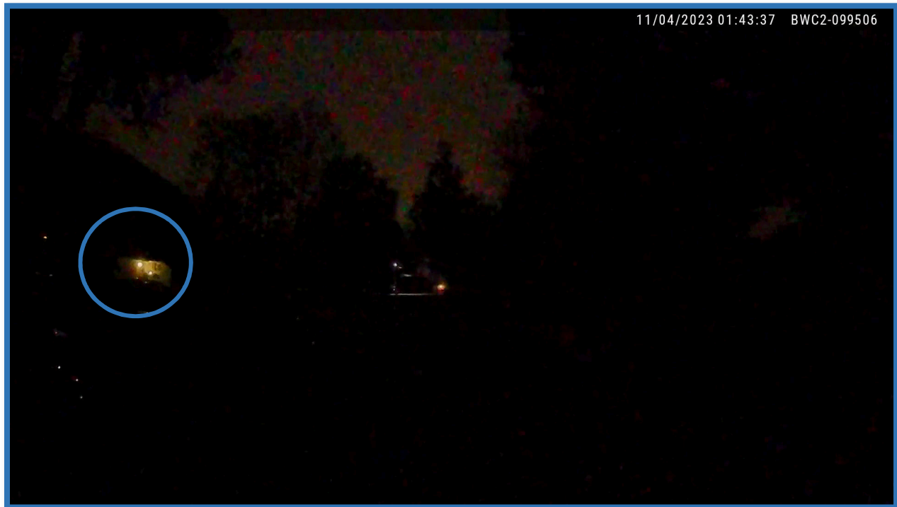
[REDACTED] [REDACTED] BWC - Image 1 [REDACTED] in the distance)

This document is the property of the Ohio Bureau of Criminal Investigation and is confidential in nature. Neither the document nor its contents are to be disseminated outside your agency except as provided by law - a statute, an administrative rule, or any rule of procedure.