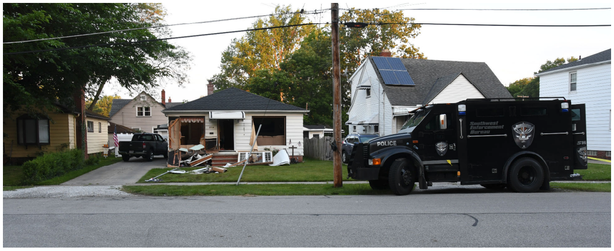
5714 South Park Blvd.

The REM 223 cartridge case on the sidewalk behind the armored vehicle was marked as item #1, and the REM 223 cartridge case in the tree lawn behind the armored vehicle was marked as item #2. The Federal 45 Auto cartridge case on the sidewalk behind the armored vehicle was marked as item #3. All items were photographed and collected. The tree lawn behind the armored vehicle and the front yard of 5708 South Park near the sidewalk was searched with the use of a metal detector. No additional cartridge cases were located. The gas projectile in the rear yard of 5708 South Park was marked as item #4, photographed, and collected.