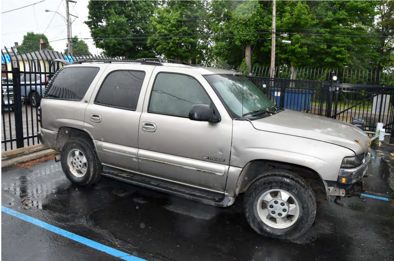
Image 3. 2002 Chevrolet Tahoe OH-JLE6671

Officer Involved Critical Incident - 428 Foster Ave, Cambridge (L)