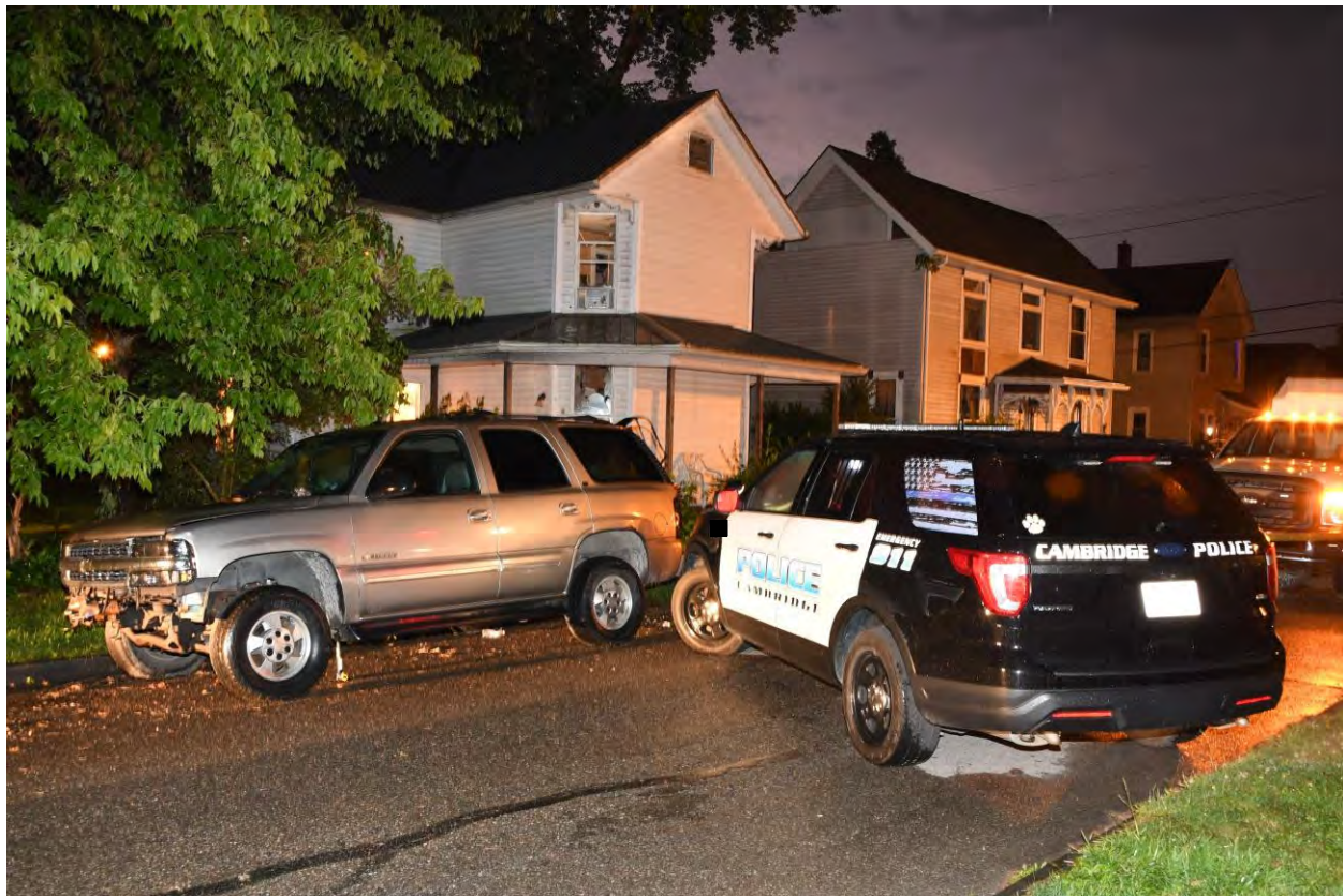
Image 1. Location of vehicles during scene 1 processing