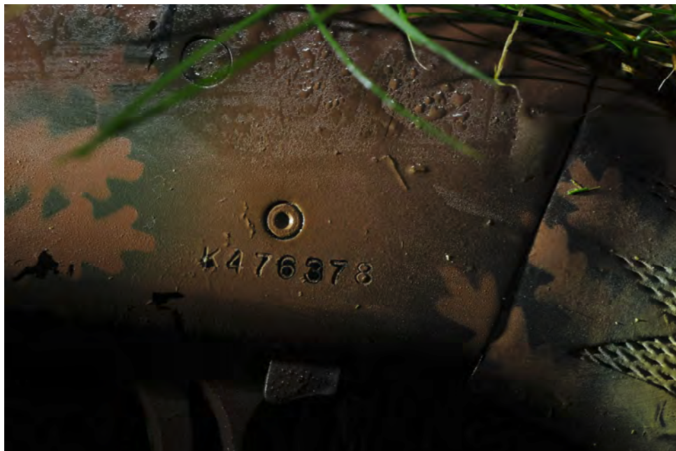
SER# on Photo ID #2 / Mossberg Shotgun

This document is the property of the Ohio Bureau of Criminal Investigation and is confidential in nature. Neither the document nor its contents are to be disseminated outside your agency except as provided by law - a statute, an administrative rule, or any rule of procedure.