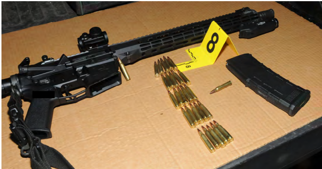
Photo ID #8 1 cartridge in chamber 26 cartridges in weapons magazine

This document is the property of the Ohio Bureau of Criminal Investigation and is confidential in nature. Neither the document nor its contents are to be disseminated outside your agency except as provided by law - a statute, an administrative rule, or any rule of procedure.