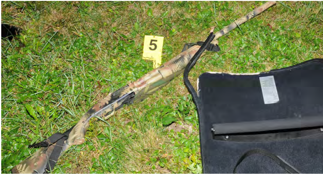
Photo ID #5 Maverick Arms 12-gauge shotgun SER#MV15911A Containing no ammunition

2023-2639 Officer Involved Critical Incident - 7498 Van Ness Avenue, Hubbard, Ohio 44425, Trumbull County