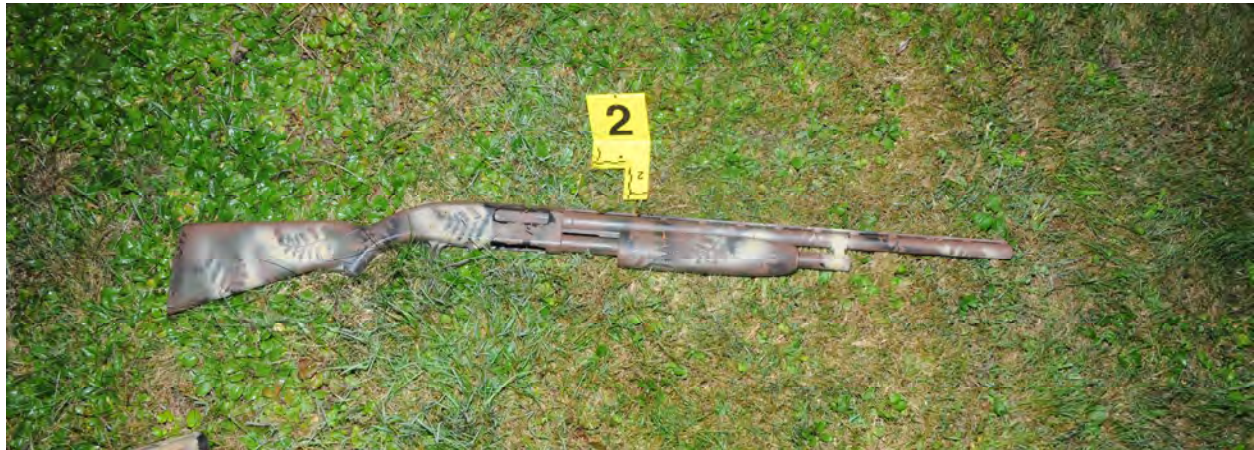
Mossberg 20-gauge shotgun SER# K476378 Contained no ammunition

2023-2639 Officer Involved Critical Incident - 7498 Van Ness Avenue, Hubbard, Ohio 44425, Trumbull County