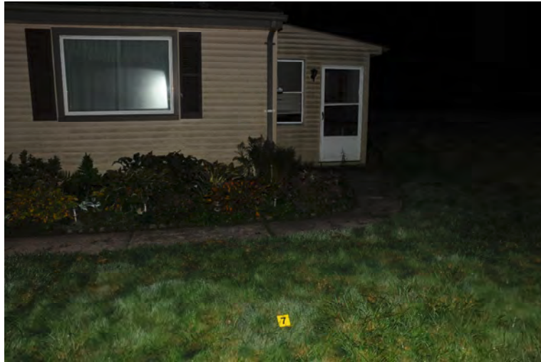
Photo ID #7 Cartridge Casing Located in the front yard of 7524 Van Ness Avenue

At this time and using multiple OSP Troopers, a systematic search of the area was made in an attempt to locate any cartridge casings. As a result of the search, one cartridge casing, a Hornady .223 REM was located, marked as Photo ID#7, collected and secured.