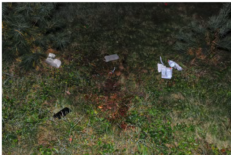
Volume bloodstain and medical packaging

This document is the property of the Ohio Bureau of Criminal Investigation and is confidential in nature. Neither the document nor its contents are to be disseminated outside your agency except as provided by law - a statute, an administrative rule, or any rule of procedure.