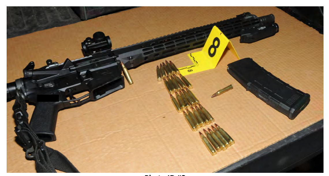
Photo ID #8 1 cartridge in chamber 26 cartridges in weapons magazine