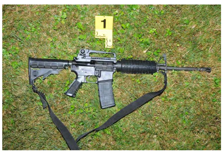
Photo ID #1 Windham Weaponry .223/5.56mm SER# (Vienna Police Department / Officer

Officer Involved Critical Incident - 7498 Van Ness Avenue, Hubbard, Ohio 44425, Trumbull County