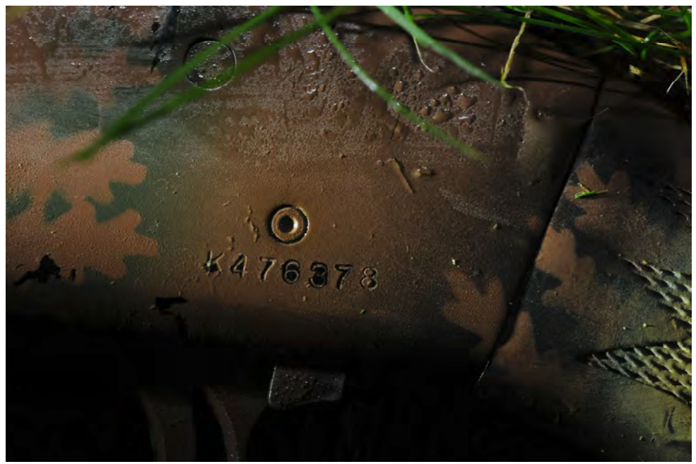
SER# on Photo ID #2 / Mossberg Shotgun

Mossberg 20-gauge shotgun SER# K476378 Contained no ammunition