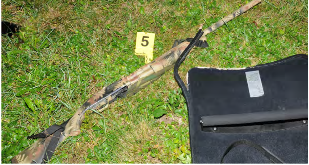
Photo ID #5 Maverick Arms 12-gauge shotgun SER#MV15911A Containing no ammunition