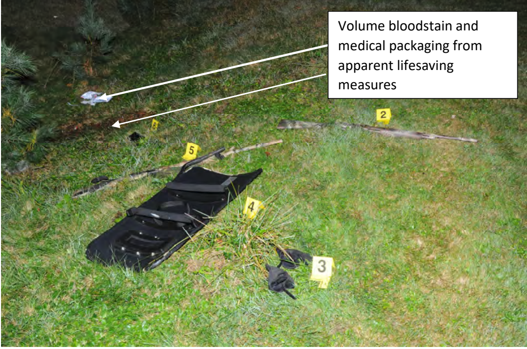
Lotion of Photo ID Items #2-#6 in reference to each other

Officer Involved Critical Incident - 7498 Van Ness Avenue, Hubbard, Ohio 44425, Trumbull County