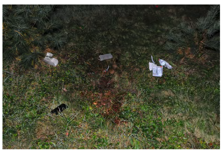
Volume bloodstain and medical packaging