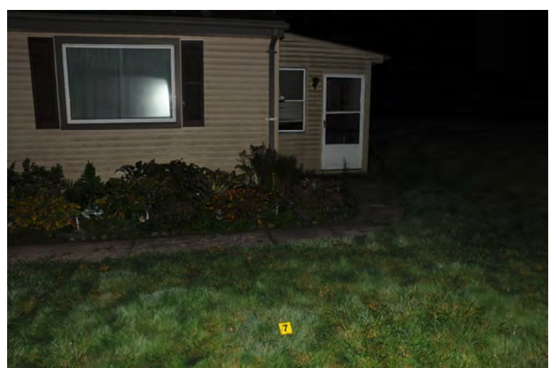
Photo ID #7Cartridge Casing Located in the front yard of 7524 Van Ness Avenue

At this time and using multiple OSP Troopers, a systematic search of the area was made in an attempt to locate any cartridge casings. As a result of the search, one cartridge casing, a Hornady .223 REM was was located, marked as Photo ID#7, collected and secured.