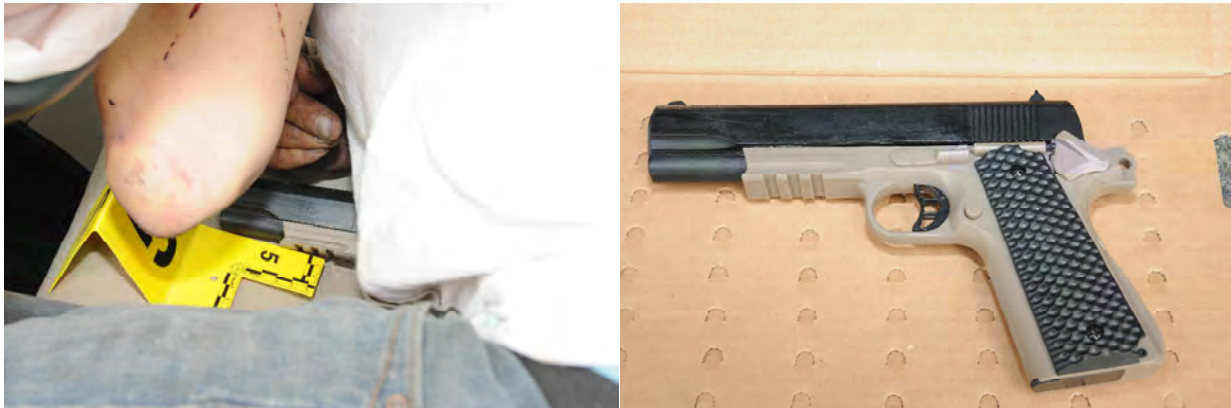
Images 2 & 3. Black and brown 1911-style BB gun located under Taylor (item 5)

Agents were able to pry open the front driver door to gain access to the front driver seat area. Slumped to the right, over the center console, was a young white male with short brown hair. The male, later identified as Devon Taylor, was wearing a white t-shirt, blue jeans, blue Hanes boxers, and Air Jordan shoes. A blue bandana was also tied loosely around his neck. Blood appeared to be coming from an injury to Taylor's head and suspected gunshot wounds were visible along his back, left arm and into his left thigh. From the passenger side front door, SA Austin observed the front sight of a firearm in the area of Taylor's lap. As Agents began to move Taylor, a black/brown handgun barrel became visible under his torso. SA Austin collected a plastic black/brown BB handgun (S/N 21C24408) that contained a magazine with BBs as item 5. The BB gun was in the style of a 1911 pistol and featured a cocked hammer that appeared broken along with a safety that was engaged. It should be noted that the BB gun appeared visually consistent with a real firearm and it was not until it was handled that the weight and construction difference became noticeable.