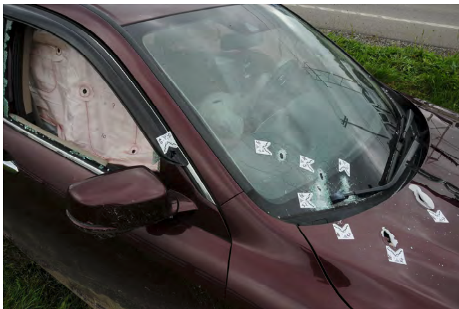
Image 4. BEs 3 through 12, 20 (BEs 1-2 further to the right into hood)

From the exterior of the vehicle, multiple ballistic events (BE) were observed and numerically labeled for identification purposes. BEs 1-5 were located in the hood of the vehicle with characteristics of a flight path from the front passenger corner of the vehicle. BEs 4 and 5 continued through the lower passenger corner of the windshield at 4.1 and 5.1 into the cabin of the vehicle. BEs 6 and 7 were distinct oval shaped bullet holes with beveling that indicated a shot direction of outside the vehicle into the vehicle. BE 8 was a hole that went through the upper edge of the front passenger door and appeared to stop at the A pillar evidenced by bullet splash. BEs 9-12 were suspected bullet holes through the drop-down side curtain air bag at the front passenger seat. BEs 9-11 were described as ragged holes in the airbag with smaller areas of secondary fragmentation damage whereas BE 12 was a circular hole with apparent bullet wipe. All of the observed damage indicated a shot direction from outside of the vehicle towards the area of the front driver seat. An additional suspected bullet hole in the front edge of the front passenger airbag was later located (BE 20).