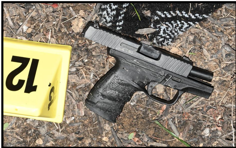
Figure 1: Image of recovered weapon