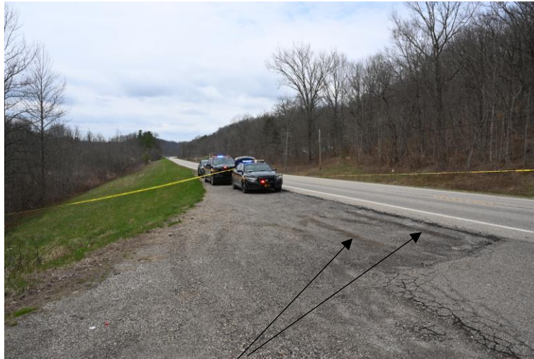
(Overall scene photograph including tire impressions left on shoulder)

Officer Involved Critical Incident - 31000 Block U.S. Route, Uhrichsville, Ohio, 44683, Harrison County