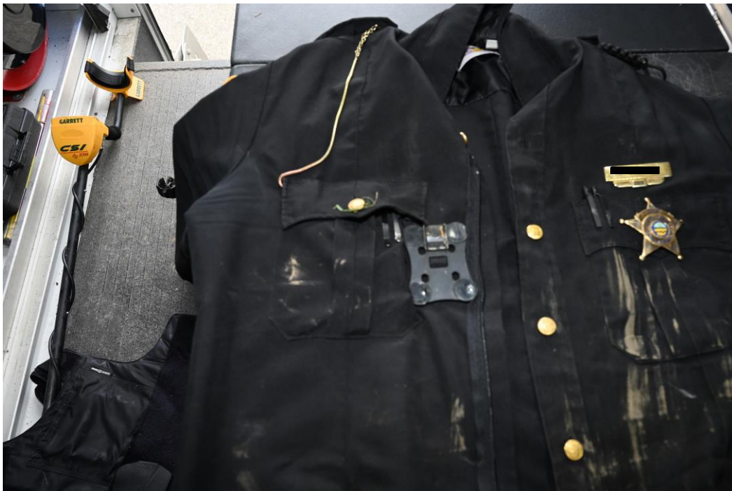
(Deputy Uniform Shirt)

The uniform shirt retrieved from the front passenger seat of Cruiser # [REDACTED] was photographed and then placed in a bag, sealed and initialed by SA Hootman.