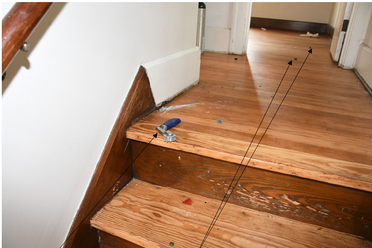
(tool believed to be in deceased hand) (two of three cartridge casings)