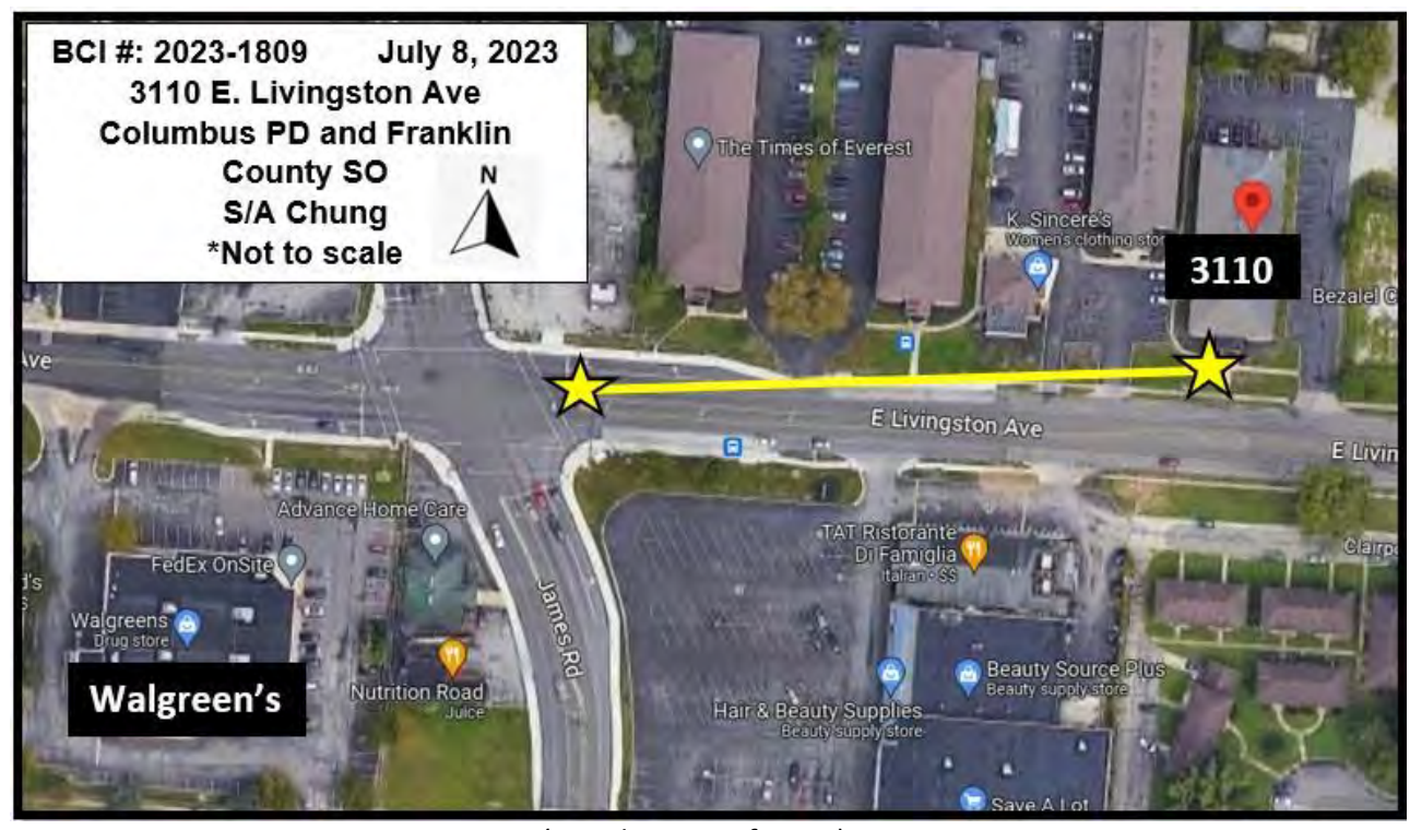
(Google Maps of scene)