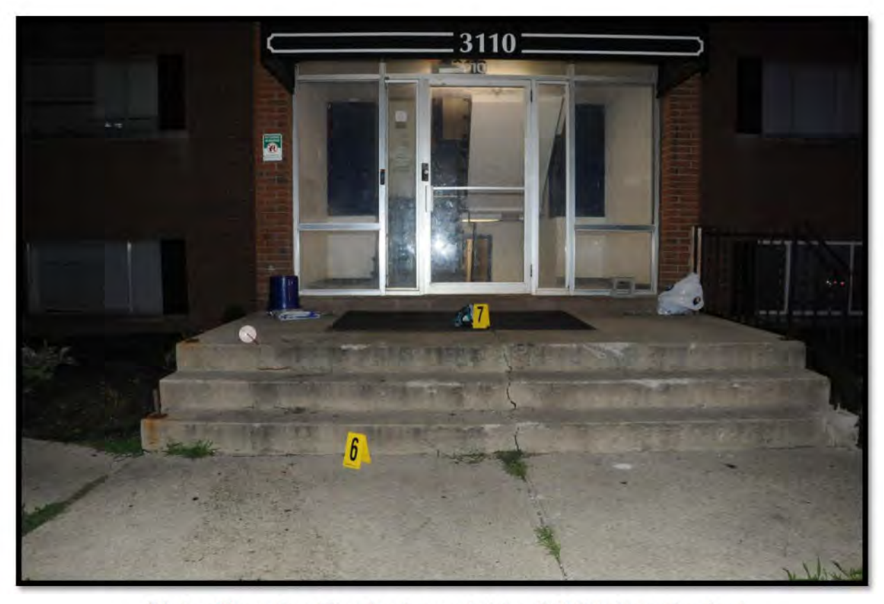
(Photo of items 6 and 7 on front cement stairs of 3110 E. Livingston Ave.)