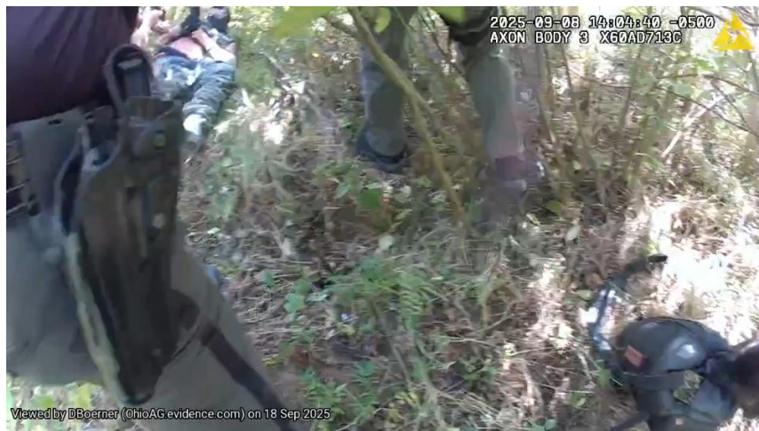
Figure 6, Dep. Chicarell Snippet6