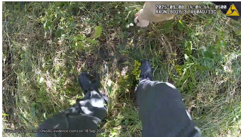
Figure 7, Dep. Chicarell Snippet7