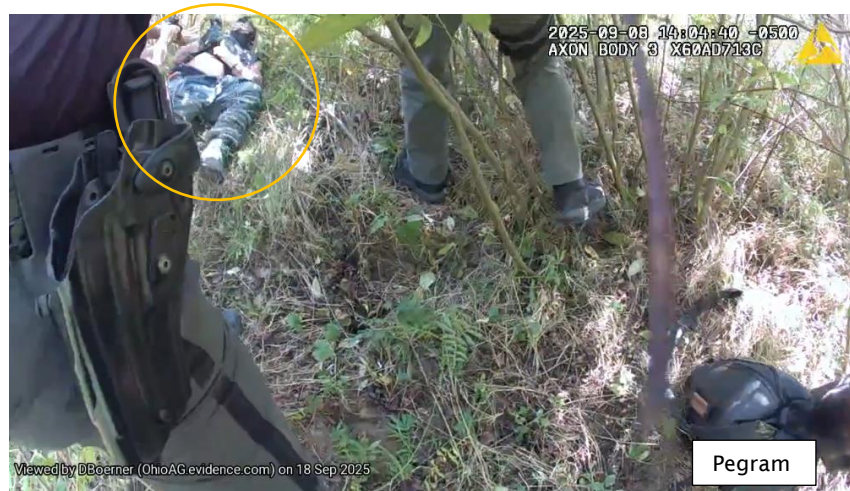
Figure 4, Dep. Chicarell Snippet4