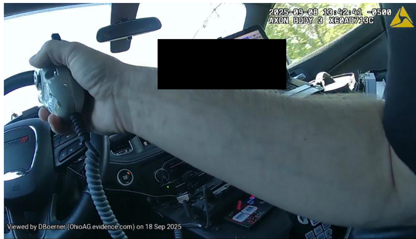
Figure 1, Dep. Chicarell Snippet1

This document is the property of the Ohio Bureau of Criminal Investigation and is confidential in nature. Neither the document nor its contents are to be disseminated outside your agency except as provided by law - a statute, an administrative rule, or any rule of procedure.