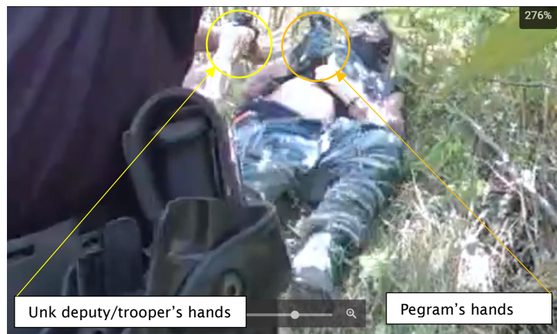
Figure 5, Dep. Chicarell Snippet5 (zoomed in)

This document is the property of the Ohio Bureau of Criminal Investigation and is confidential in nature. Neither the document nor its contents are to be disseminated outside your agency except as provided by law - a statute, an administrative rule, or any rule of procedure.