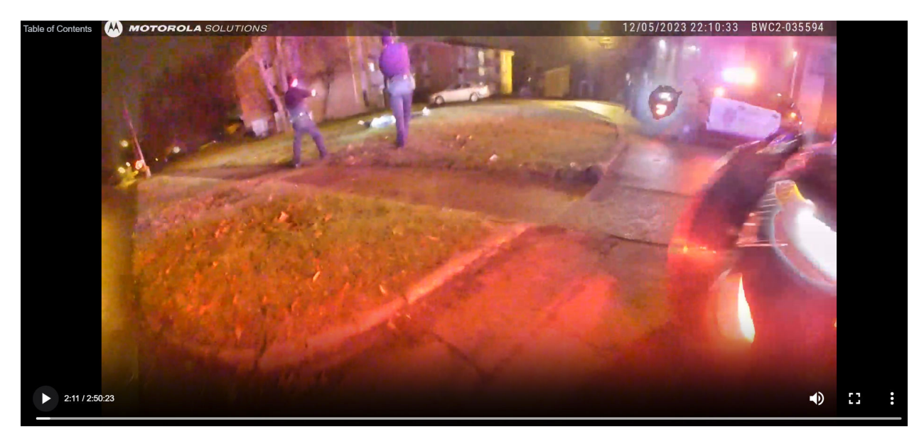
At 22:10:38, Loparo can be seen removing an item, later identified as a .177 caliber pellet pistol, from Fornash's jacket pocket. See screenshot below.