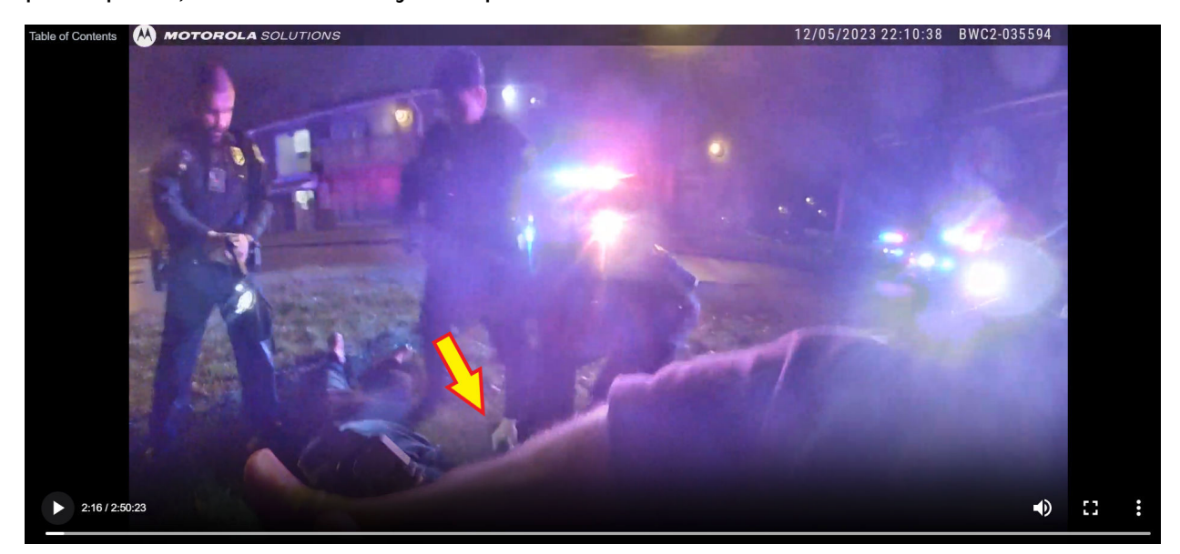
At 22:10:39, Loparo says "Gun's out." At 22:10:44, Loparo says "It's a BB gun, it's fake." Officers then begin providing aid to Fornash. At 22:12:52, an officer begins chest compressions on Fornash. At approximately 22:16:30, EMS arrives on scene. At