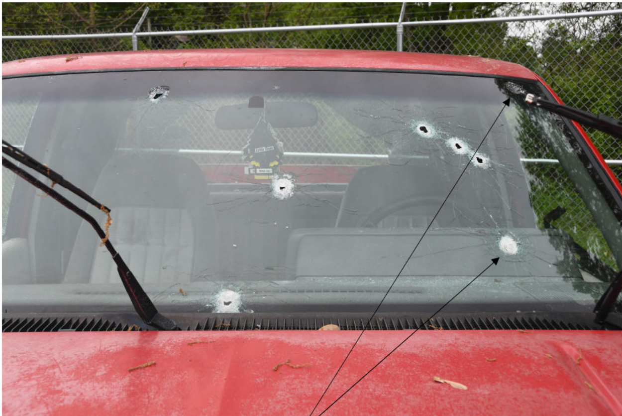
(impacts that did not exit)

The windshield had 8 impacts from inside the cab out, these impacts exited the windshield except for 2 that did not perforate. These were located on the top left and in front of the steering wheel. These impacts were from back to front with initial impacts not determined due to the rear window missing. The initial photographs taken at scene indicated several impacts coming from the rear of the vehicle entering the passenger compartment.