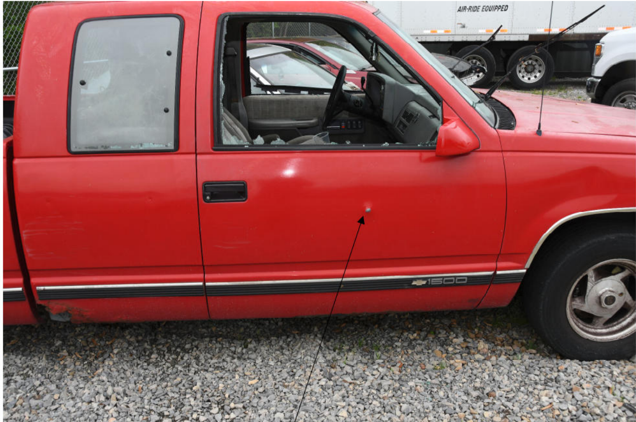
(Termination point in passengers' door)

There were two impacts into the passenger door panel that perforated the interior door skin with one terminating into the exterior passenger door. Both impacts were from driver side to passenger side of the vehicle.