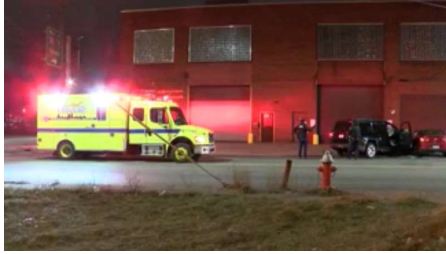
Woman injured in shooting on Cleveland's East Side