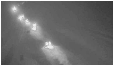
Winter weather conditions trigger speed limit reduction on I-90 in Lake County.