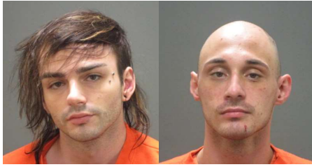
men accused of murdering Cleveland man dressed pizza delivery.