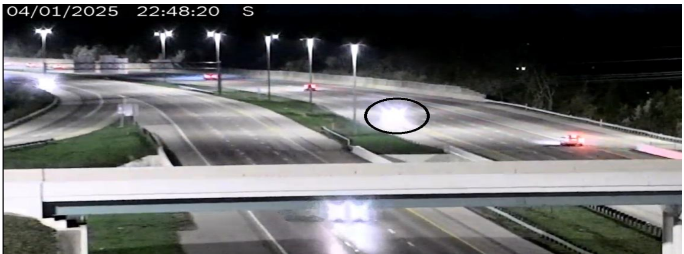
IR 275 at SR 32 - Still image of Hildal traveling south on Interstate 275 approaching oncoming traffic