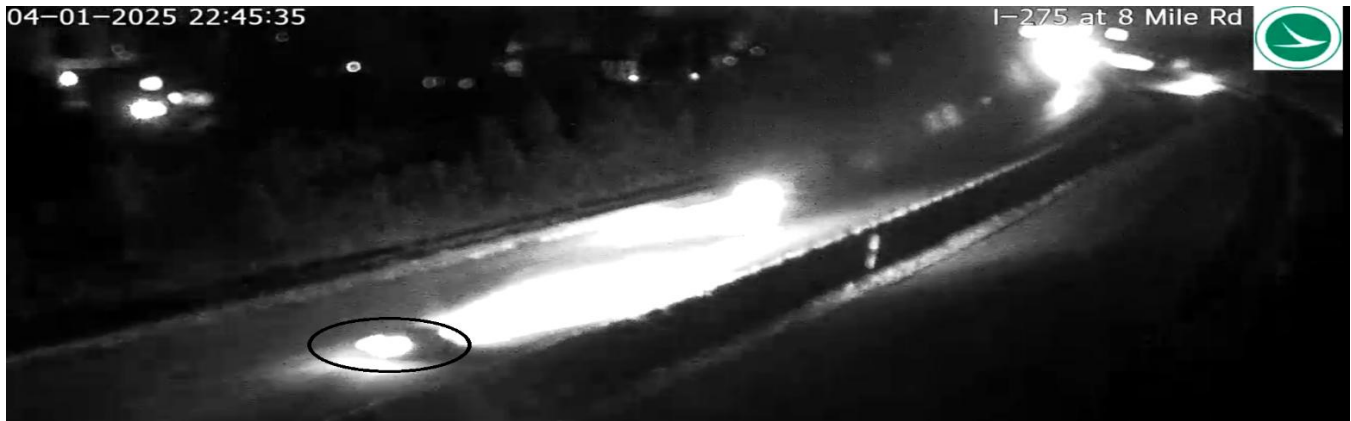
IR 275 at 8 Mile Rd - Still image of Hildal traveling north on IR 275 in the southbound lanes

The video footage accurately depicted the area of Interstate 275 and State Route 125. The video footage was of moderate quality. The video footage was captured in color, with diminished video quality proportionate to the distance from the camera. The video footage began at 22:40 hours on April 1, 2025. At 22:46:17 hours, headlights were observed which were consistent with a vehicle traveling north in the southbound lanes of Interstate 275. At 22:46:37 hours, the vehicle was positioned closest to the camera and appeared to be a red-colored SUV. At the same time, brake lights became illuminated on the back of the red-colored SUV. While examining the video footage, the vehicle appeared to again be traveling at highway speeds as it maintained a pace with the northbound commercial motor vehicle. The video footage concluded at 22:50 hours.