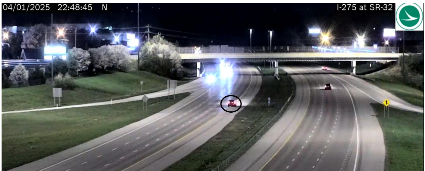
IR 275 at SR 32 - Still image of Hildal traveling north on Interstate 275 approaching oncoming traffic