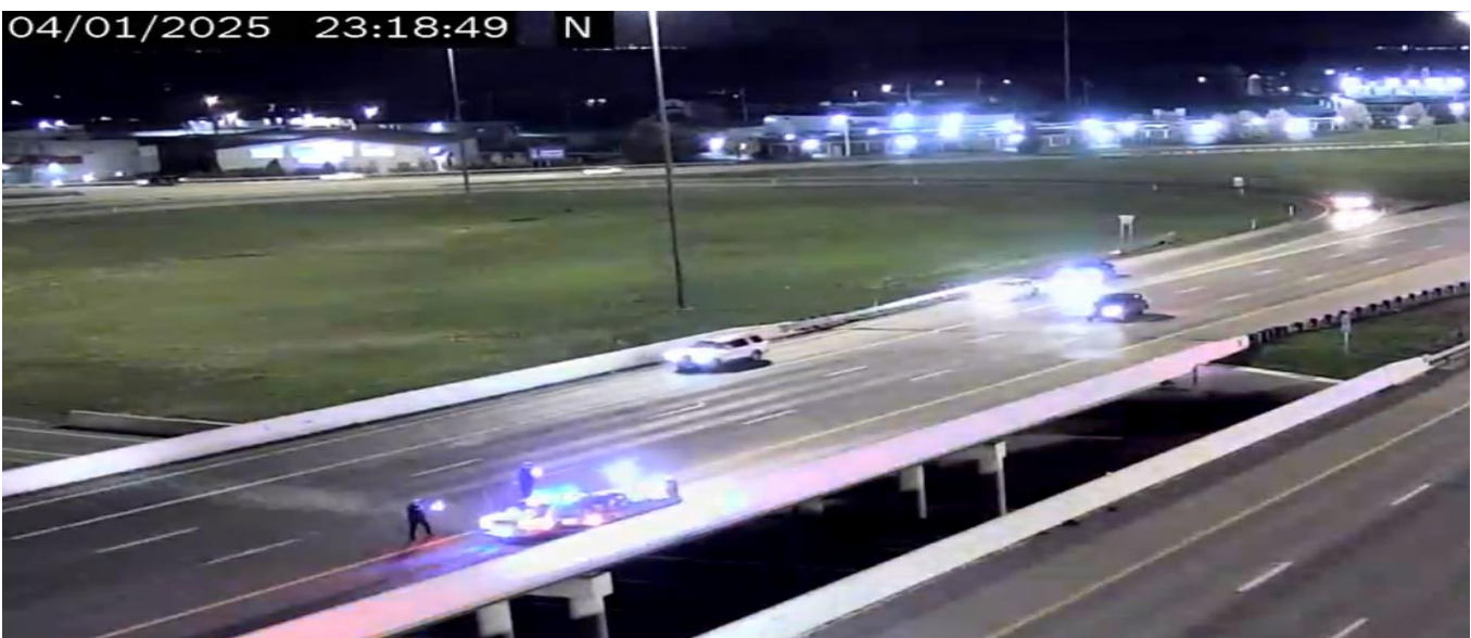
IR 275 at SR 32 - Still image of IR 275 at SR 32 after Hildal's vehicle was stopped