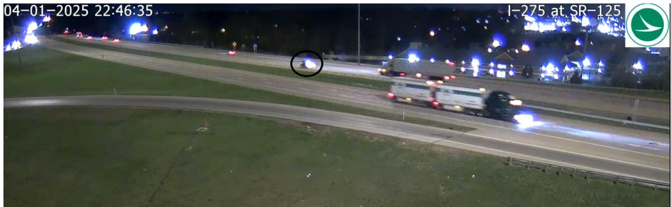
IR 275 at SR 125 - Still image of Hildal traveling north on IR 275 in the southbound lanes

The video footage accurately depicted the area of Interstate 275 and Barg Salt Run Road. The video footage was of poor quality. The video footage was captured in grayscale, likely as a result of the lack of ambient light in the area. The video footage began at 22:45 hours on April 1, 2025. At 22:49:46 hours, a vehicle traveling south in the northbound lanes of Interstate 275 was observed. The vehicle appeared to have been traveling in the left shoulder of the northbound roadway. The wrong way vehicle appeared to be traveling at a velocity greater than traffic in the southbound lanes of Interstate 275. The video footage concluded at 22:55 hours.