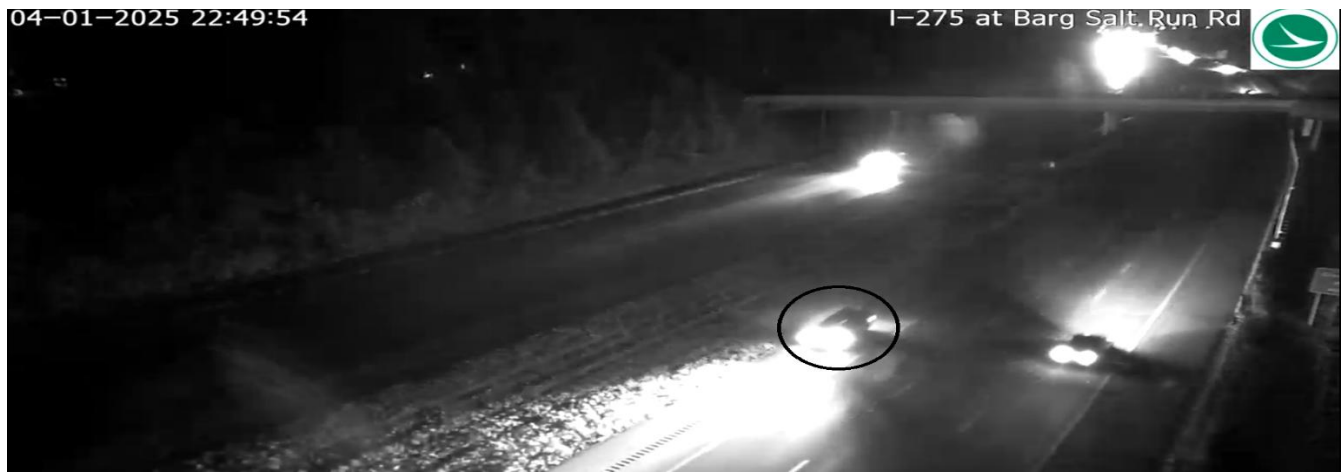
IR 275 at Barg Salt Run Rd – Still image of Hildal traveling north on IR 275 in the southbound lanes