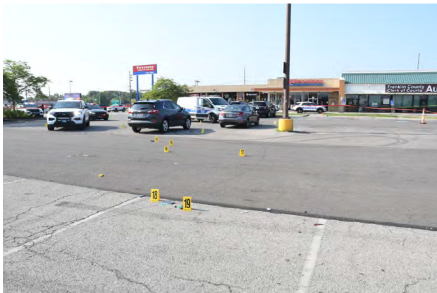
Image 1. Parking lot of 45 Great Southern Blvd.