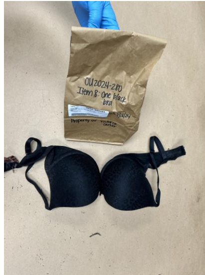
(Figure #2: black bra with blood stains)

Officer Involved Critical Incident - 555 Independence Dr., Medina, Ohio 44256