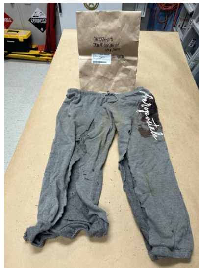
(Figure #3: Gray pants with blood stains)

This document is the property of the Ohio Bureau of Criminal Investigation and is confidential in nature. Neither the document nor its contents are to be disseminated outside your agency except as provided by law - a statute, an administrative rule, or any rule of procedure.