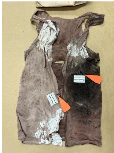
(Figure #1: two defects in white tank top)

Upon retrieving the items, SA Goudy photographed and examined Carter's clothing, which included the following: white tank top (Matrix Item #041) with blood stains and two defects on the front (Figure #1), a black bra (Matrix Item #042) with blood stains (Figure #2), a gray pair of sweatpants (Matrix Item #043) with blood on the upper left side (Figure #3), and a gray pair of underwear (Matrix Item #044) with blood stains (Figure #4).