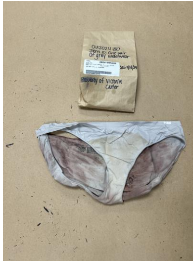
(Figure 4: underwear with bloodstains)

Officer Involved Critical Incident - 555 Independence Dr., Medina, Ohio 44256